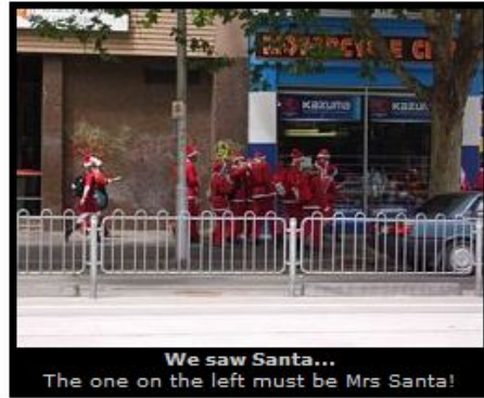
We saw Santa... The one on the left must be Mrs Santa!