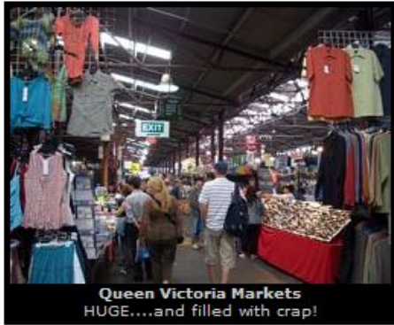
Queen Victoria Markets HUGE....and filled with crap!