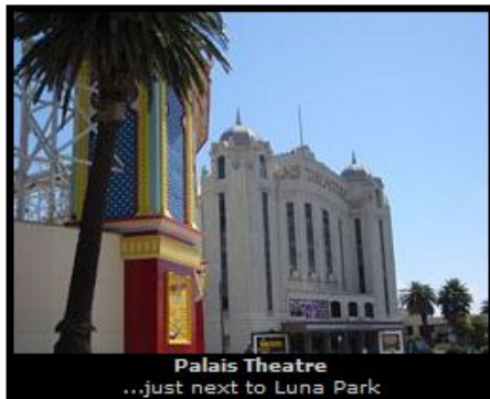
Palais Theatre ...just next to Luna Park

Melbourne is a great city, I loved everything about it, the ambiance, the people and its restaurants.....I can't wait to go back!!