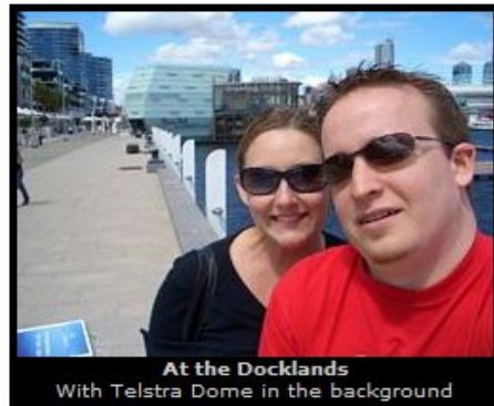
At the Docklands With Telstra Dome in the background