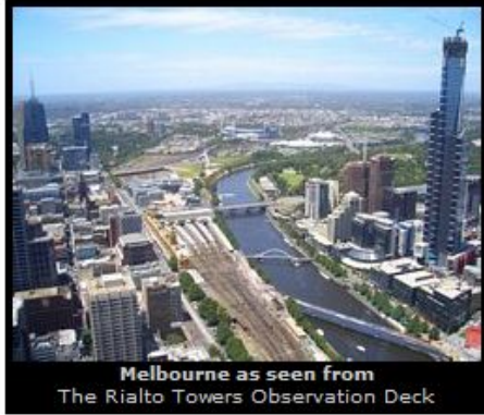
Melbourne as seen from The Rialto Towers Observation Deck