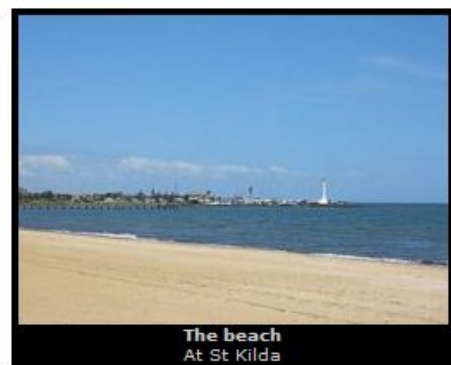
The beach At St Kilda

The next morning Suz, Kate, Adam and I went for a drive south of Melbourne. We drove up the hill to Arthurs Seat where we had some great views over the bay. We ended later on in Portsea, where we sat next to the beach while having lunch at the Portsea Hotel.