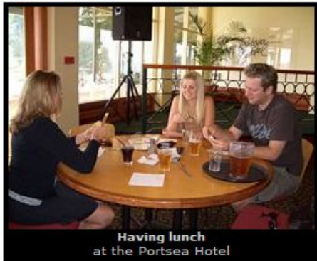
Having lunch at the Portsea Hotel