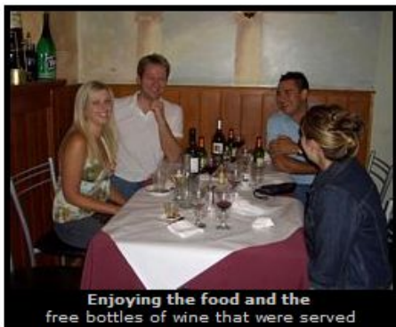
Enjoying the food and the free bottles of wine that were served