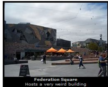
Federation Square Hosts a very weird building