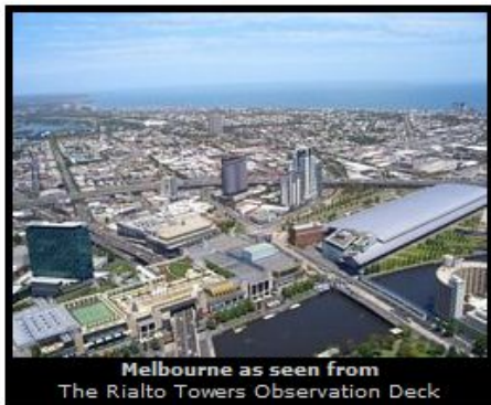
Melbourne as seen from The Rialto Towers Observation Deck