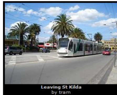
Leaving St Kilda by tram