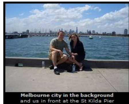
Melbourne city in the background and us in front at the St Kilda Pier