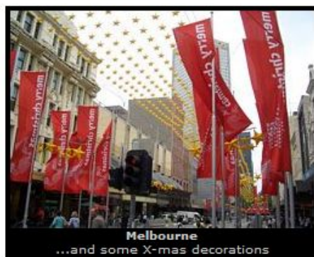
Melbourne ...and some X-mas decorations

We walked around for quite a while with no real goal, just exploring a new city for me. The weather was sunny and nice, but unfortunately quite cold (it was still early morning). I almost ended up buying an extra sweater, but instead we sneaked into a cafe and sat there having some hot drinks for a little while.