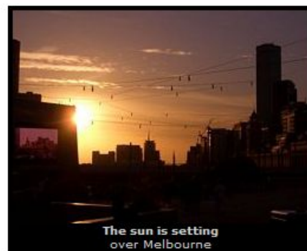
The sun is setting over Melbourne