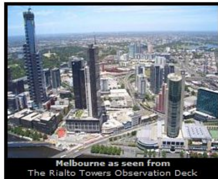
Melbourne as seen from The Rialto Towers Observation Deck