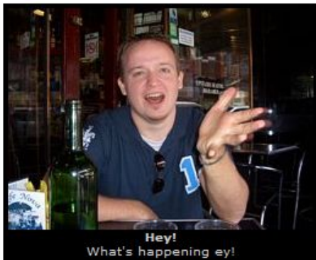
Hey! What's happening ey!