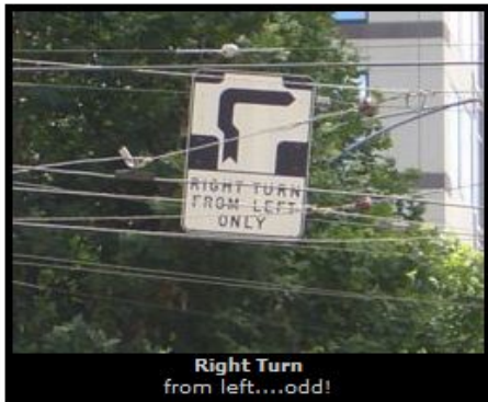
Right Turn from left....odd!