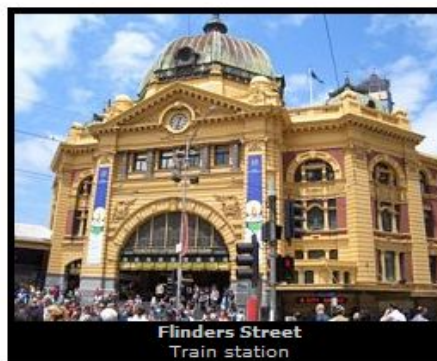
Flinders Street Train station

We took our food with us and walked down to the beach where we found a great place to sit under a palm tree. After we finished eating we realized that we had forgotten to use the sunscreen we had purchased. Unfortunately sitting on the sand doesn't help. Applying the sunscreen mixed with the sand felt a bit like having a facial....ah well, protection against the sun and a nice smooth face at the same time =)