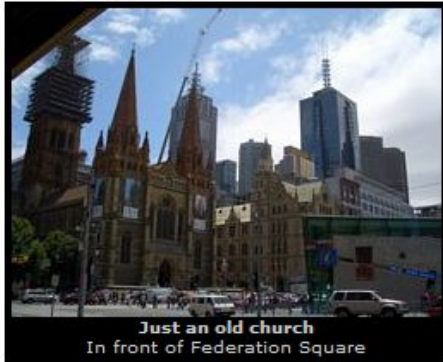
Just an old church In front of Federation Square

That afternoon we met up with Suz's friend Kate over a few drinks just behind Federation Square and watched the sunset while the girls caught up on old times. We moved on and crossed the Yarra River to the Southbank area. The views of the city from the bridge is just awesome!