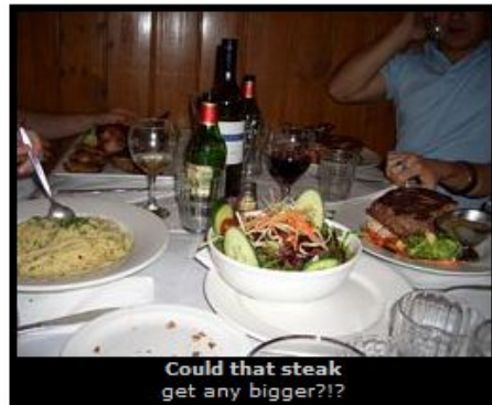
Could that steak get any bigger?!?