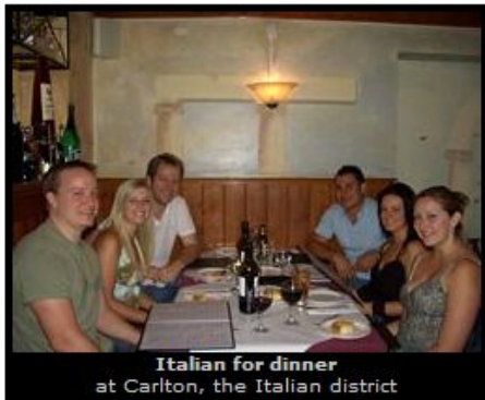
Italian for dinner at Carlton, the Italian district