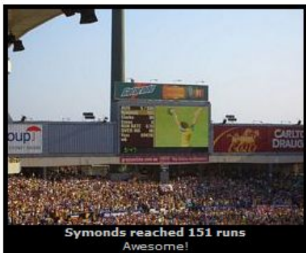
Symonds reached 151 runs Awesome!