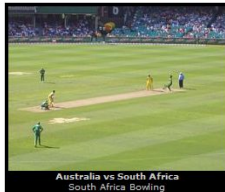
Australia vs South Africa South Africa Bowling