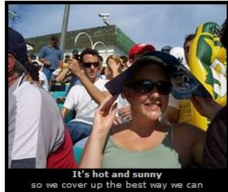
It's hot and sunny so we cover up the best way we can

The first few hours we had to make sure we kept renewing our sunscreen but eventually the sun settled. Before that it's sunnies, hats and lots sunscreen, specially since we were sitting in a section without a roof. And the game, well...Australia smashed South Africa in the match.