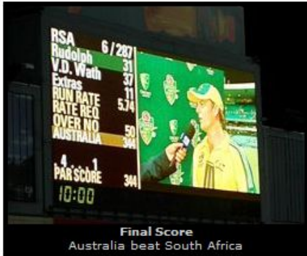
Final Score Australia beat South Africa