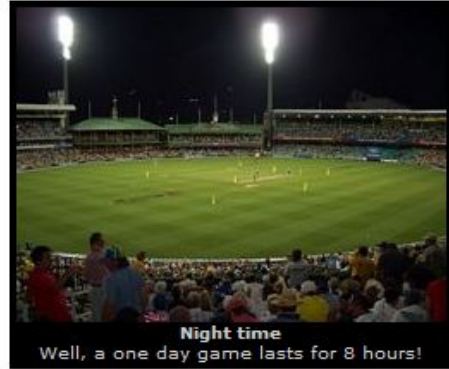
Night time Well, a one day game lasts for 8 hours!