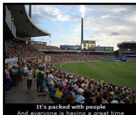
It's packed with people And everyone is having a great time