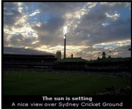
The sun is setting A nice view over Sydney Cricket Ground