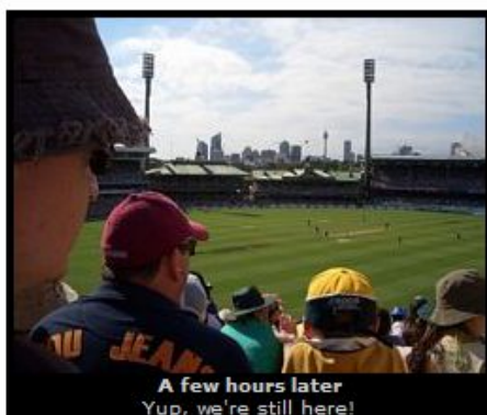
A few hours later Yup, we're still here!