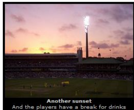
Another sunset And the players have a break for drinks