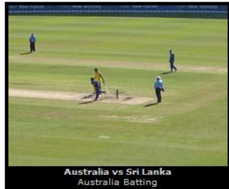
Australia vs Sri Lanka Australia Batting