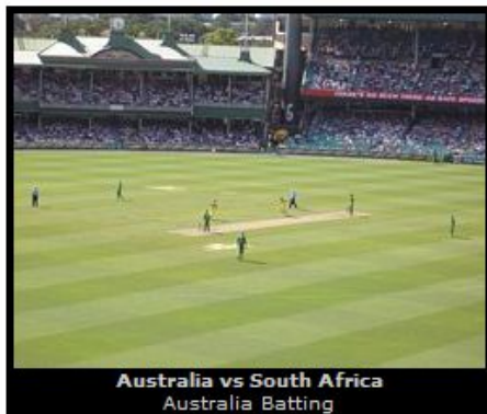
Australia vs South Africa Australia Batting