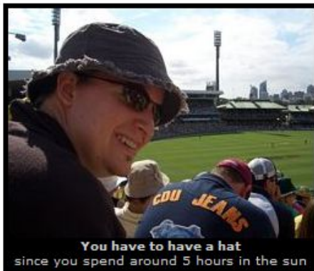
You have to have a hat since you spend around 5 hours in the sun