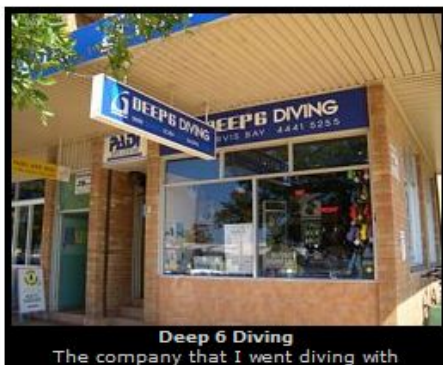
Deep 6 Diving The company that I went diving with