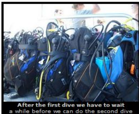
After the first dive we have to wait a while before we can do the second dive