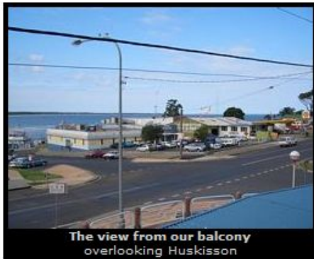
The view from our balcony overlooking Huskisson