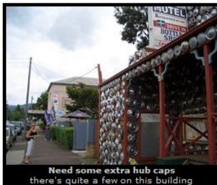
Need some extra hub caps there's quite a few on this building

We spent the rest of our day just relaxing and not doing much. Since we were at a coastal town we tried some of the local fish and chips (grilled fish though, can't stand the battered one) while sitting on our balcony that faced the main street of town.