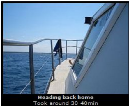
Heading back home Took around 30-40min