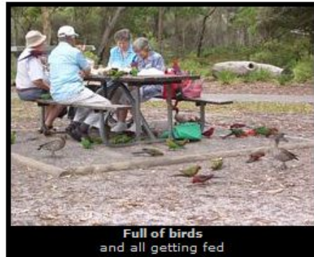
Full of birds and all getting fed