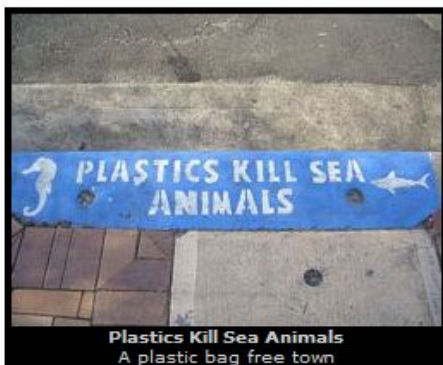
Plastics Kill Sea Animals A plastic bag free town