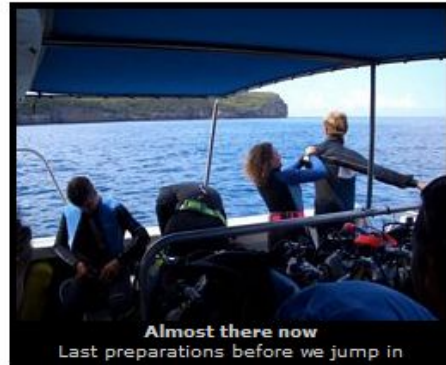
Almost there now Last preparations before we jump in