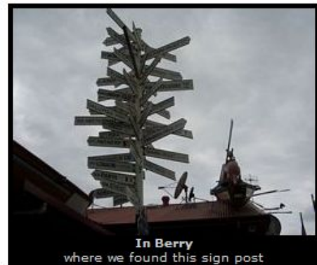
In Berry where we found this sign post

Exploring the area and it's beaches was fun but not great, since the day was overcast it was hard to see the whiteness in the beach, we just had to hope for some sun later on.