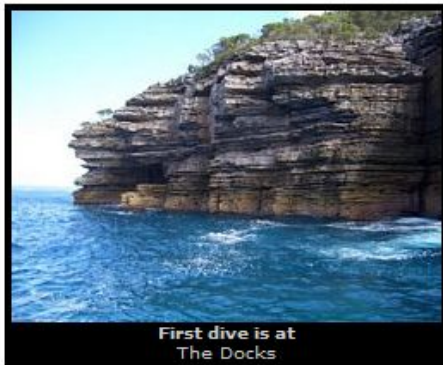
First dive is at The Docks