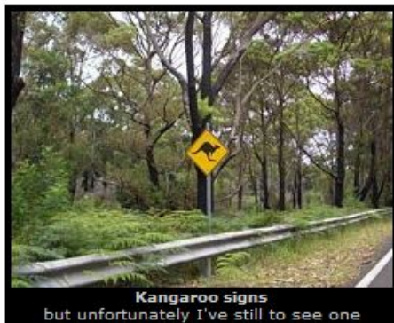
Kangaroo signs but unfortunately I've still to see one