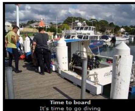
Time to board It's time to go diving