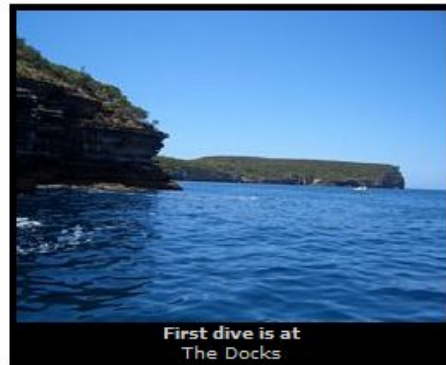
First dive is at The Docks