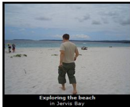
Exploring the beach in Jervis Bay