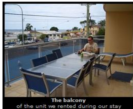
The balcony of the unit we rented during our stay