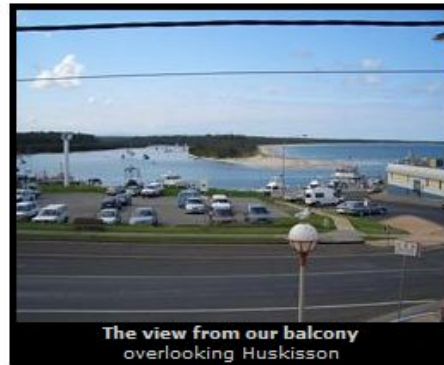
The view from our balcony overlooking Huskisson