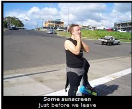
Some sunscreen just before we leave