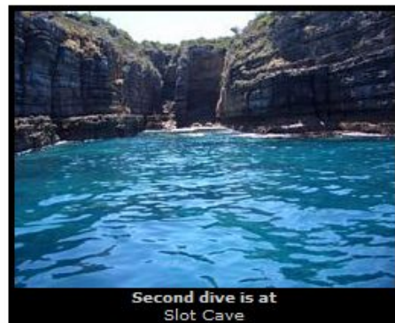
Second dive is at Slot Cave