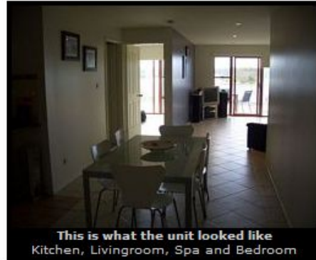
This is what the unit looked like Kitchen, Livingroom, Spa and Bedroom