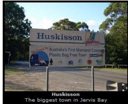
Huskisson The biggest town in Jervis Bay