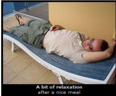
A bit of relaxation after a nice meal