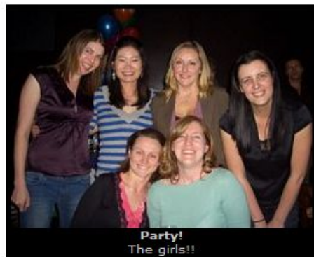
Party! The girls!!