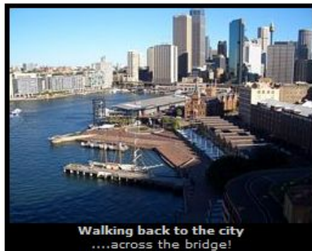
Walking back to the city ...across the bridge!

Suz's birthday we celebrated in big style! She turned 30 and together with two of her mates they planned a combined 30th party.