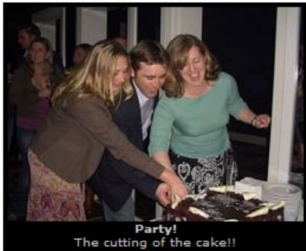
Party! The cutting of the cake!!