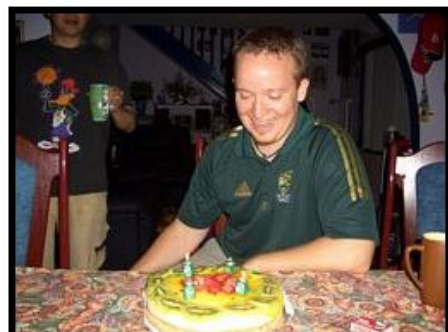
My Birthday cake!!! Notice the awesome Beer candles =))