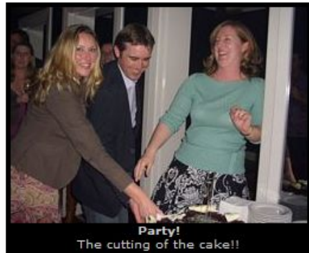
Party! The cutting of the cake!!