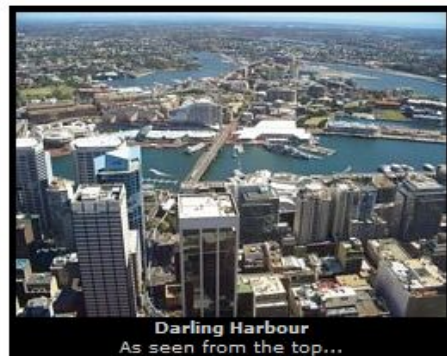
Darling Harbour As seen from the top...