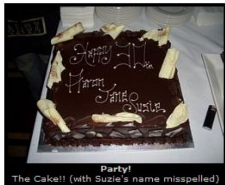
Party! The Cake!! (with Suzie's name misspelled)