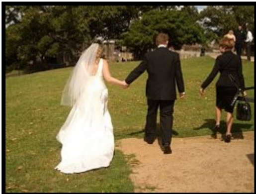
Suz and I on our way to the group photo