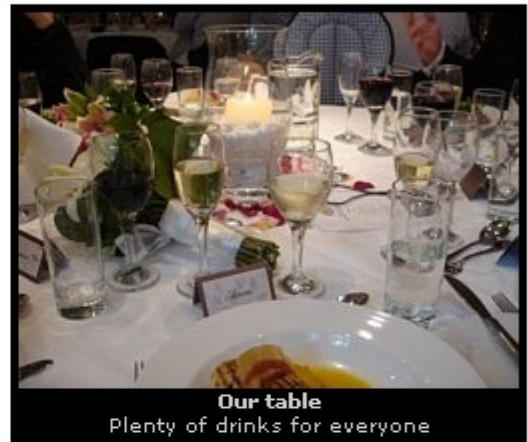
Our table Plenty of drinks for everyone