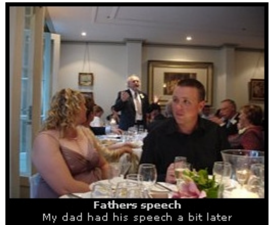
Fathers speech My dad had his speech a bit later