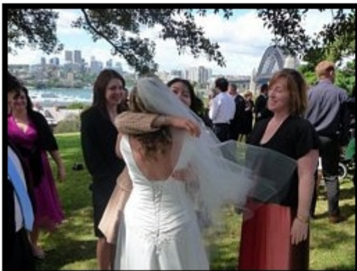
Congratulations Hugs all around...