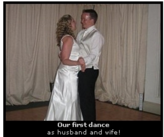
Our first dance as husband and wife!