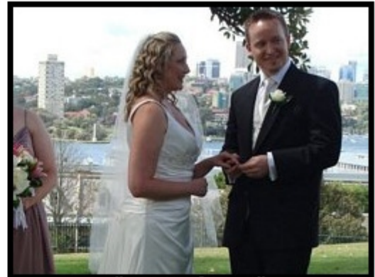
"Repeat after me" We're almost there...