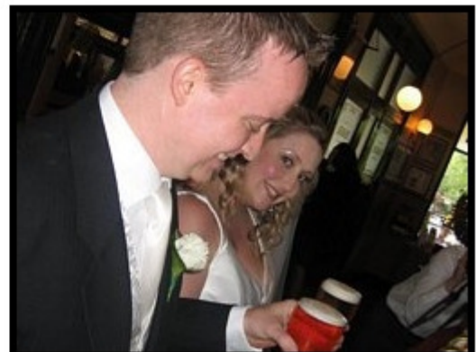
At the Australian Hotel right after the ceremony