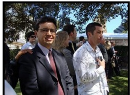
Waiting... for the bride to arrive