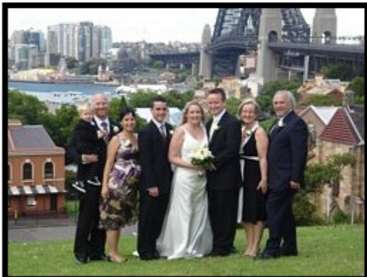
Family photos with my family