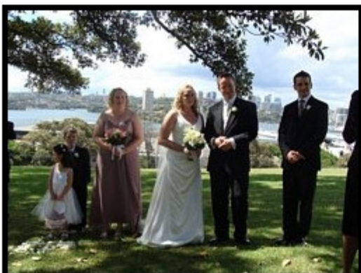
The bridal party Let's get this show started!