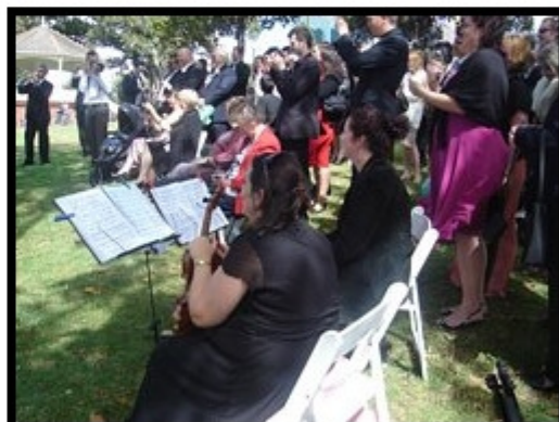
Our guests at the ceremony