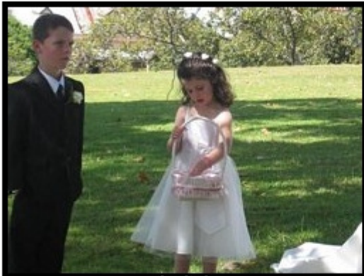
The kids are getting a bit bored =)