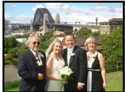
Family photos with my parents