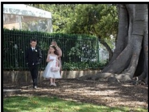
The page boy and flower girl make their way down the isle