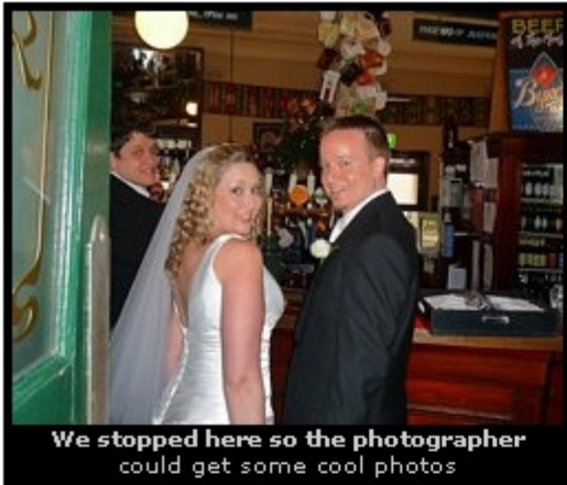
We stopped here so the photographer could get some cool photos