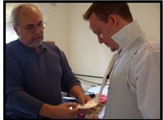
Dad and I Inspecting the knot...