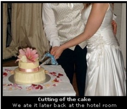
Cutting of the cake We ate it later back at the hotel room