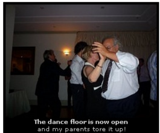
The dance floor is now open and my parents tore it up!