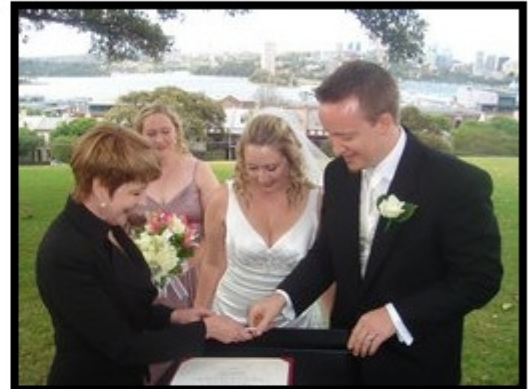
Signing the marriage certificate