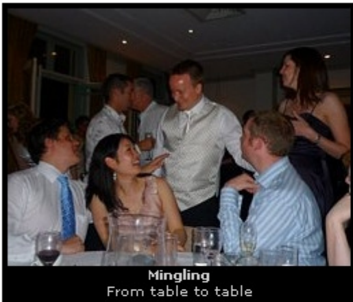
Mingling From table to table