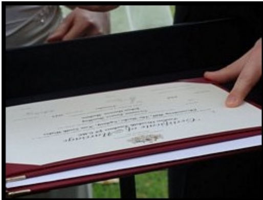
Our marriage certificate Signed by us and our witnesses