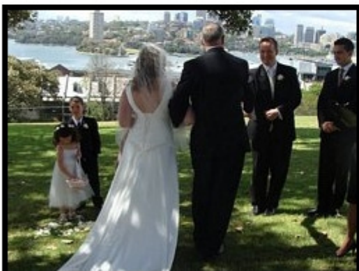
The father hands the bride over ...she's all mine now!