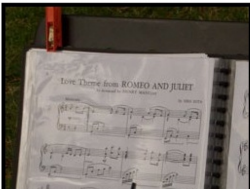
"Love theme from Romeo & Juliet" Romantic of course...