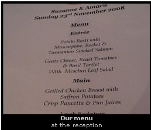
Our menu at the reception