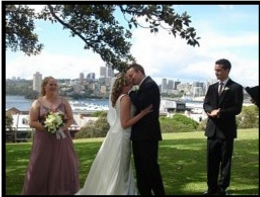
"You may now kiss the bride" We are now officially married!