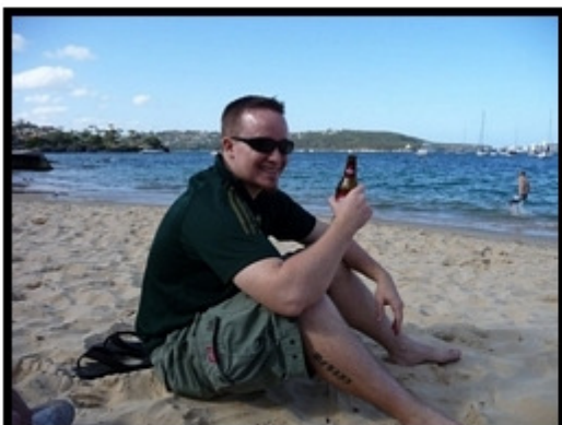
Having a cold one at the Beach Down at Balmoral Beach