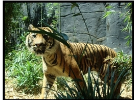
Here Kitty kitty... Not THAT close!