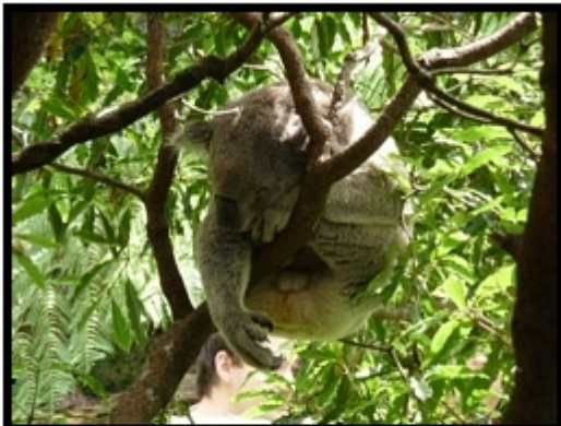
A sleeping Koala... Who would have thought?!?