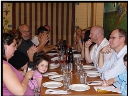
THE family dinner Where our families met for the first time