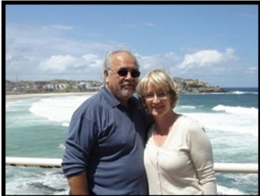
Mum and Dad at Bondi Beach