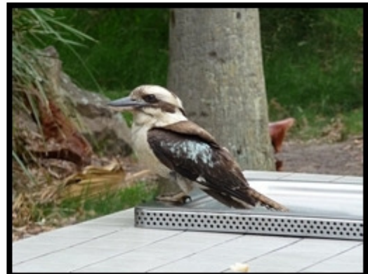
A Kookaburra one of the local birds