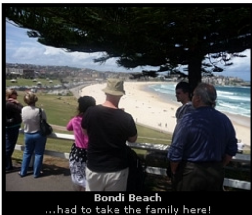
Bondi Beach ...had to take the family here!