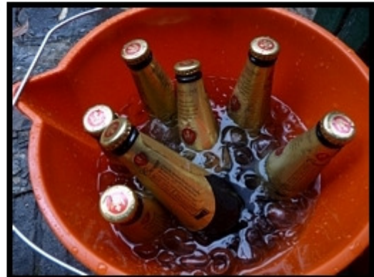
Some Cold ones after the game ...always great!