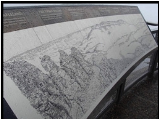
The Three Sisters This is what we're supposed to see