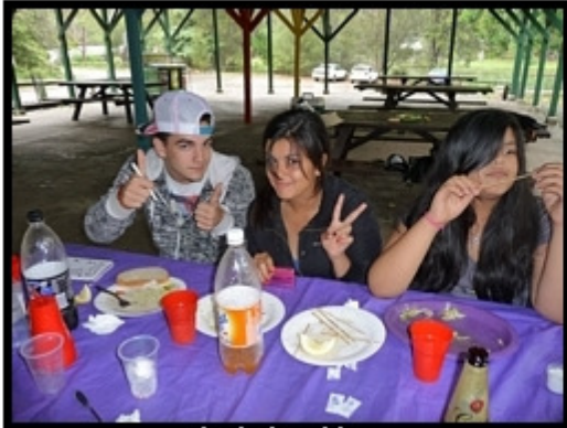
The kids table... Where we also sat!