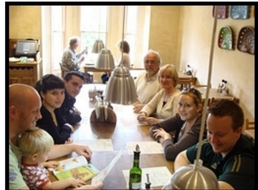
Breakfast before heading to the Blue Mountains