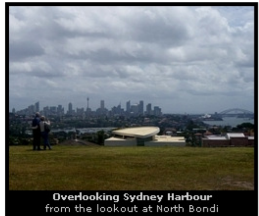
Overlooking Sydney Harbour from the lookout at North Bondi