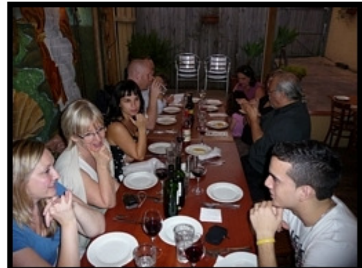
THE family dinner Where our families met for the first time