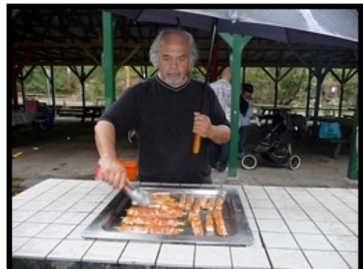
We don't sing in the rain... we cook in it!