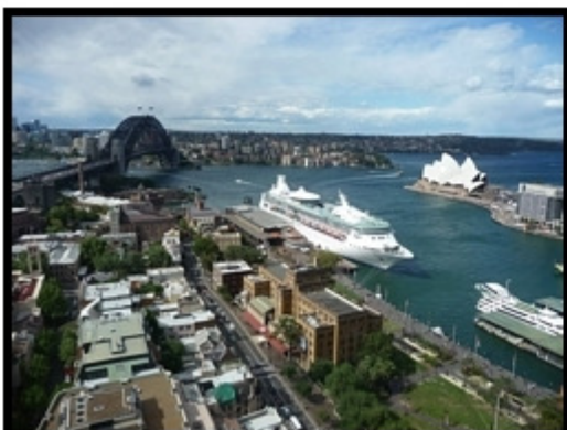
The view from our hotel room Not too bad =)