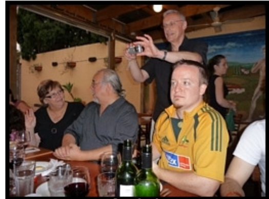
THE family dinner Where our families met for the first time