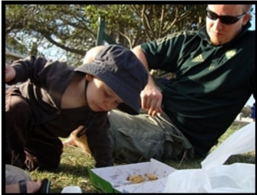
Fish & Chips Some good food to finish the day!