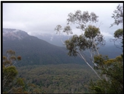
At least the fog cleared a bit over here...