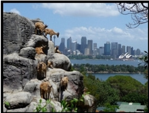
Best view in the city ...lucky goats!