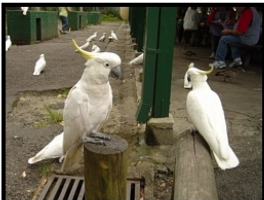
And here are a few other ones... Cockatoos