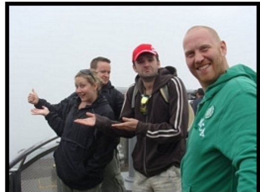
Can you see it? it's right there, somewhere...