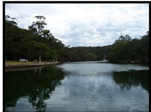
The National Park at Audley