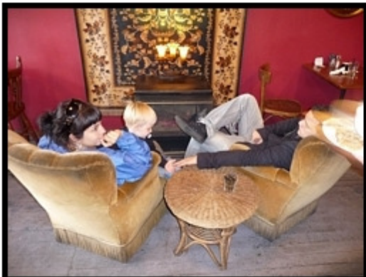
A nice place to relax on a wet and cold day