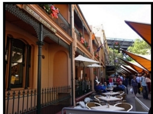
Decorations in The Rocks area On our way to the pub