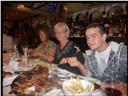
Trying out a Peruvian restaurant ...soooo much meat!!