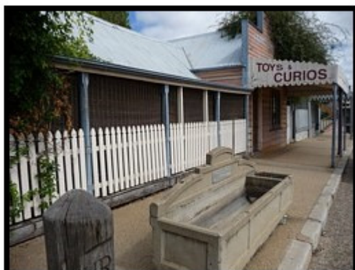
Gulgong is a very cute town Very old fashioned...