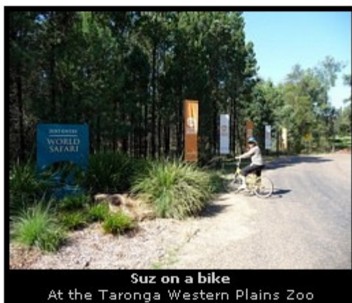
Suz on a bike At the Taronga Western Plains Zoo