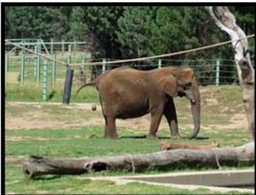
Caught in the act... Yeah I know... we're weird ;)