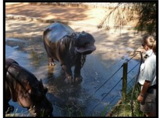
Washing time! The Hippos are really loving it