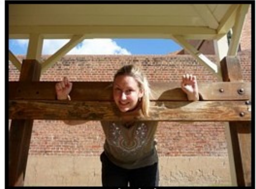
I managed to lock Suz up And she looks very happy about it!