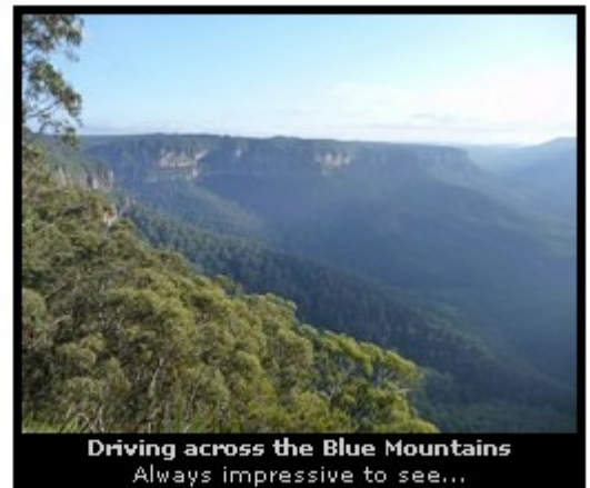
Driving across the Blue Mountains Always impressive to see...

We beat traffic by setting off early of Friday morning and managed to cross the Blue Mountains without any issues. Our first stop was Bathurst where the plan was to drive along the racetrack on Mt Panorama, but unfortunately on that day a race was on and the circuit was closed off to the public.