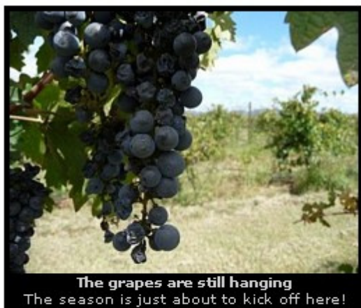
The grapes are still hanging The season is just about to kick off here!