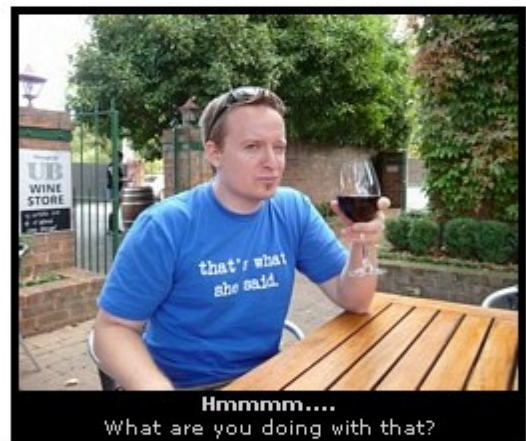
Hmmm.... What are you doing with that?