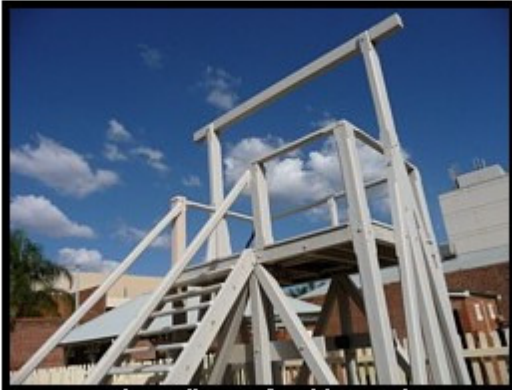
The Gallows of Dubbo Gaol Still quite scary...