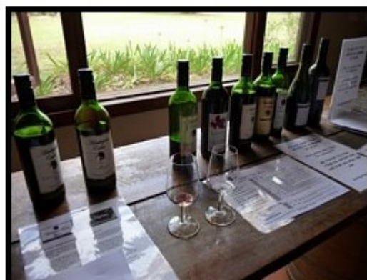
We'll start with the bubbies and finish with the fortified reds...