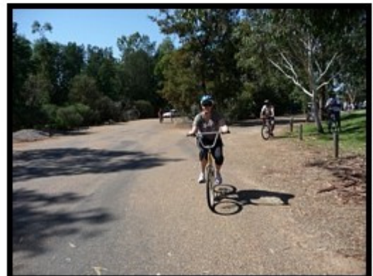
Still in the park Enjoying a lovely sunny day!