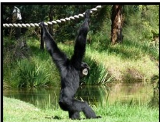
The Gibbons put on quite a show for the crowds