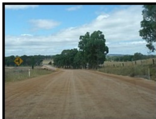
We're off the main path now... Dirt roads ahead!