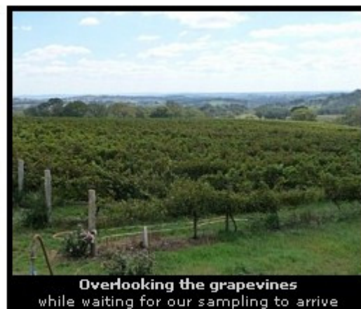
Overlooking the grapevines while waiting for our sampling to arrive

We had a great day at the Zoo, the weather was perfect (nice and sunny but not too hot), the animals a lot of fun and the company just couldn't get any better ;) After handing in our bikes we drove and found our hotel, freshened up a bit and then went back into town.