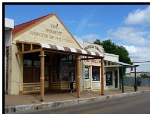
And the town also contains lots of old fashioned shops