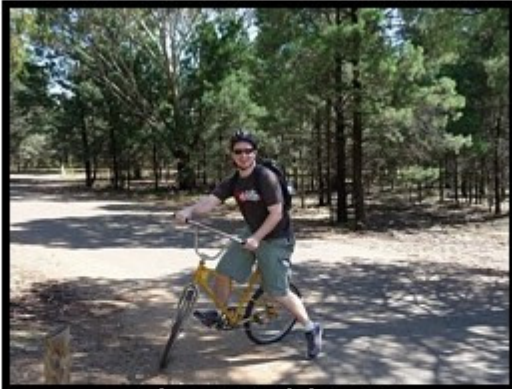
Biking around the zoo is a great way to get around...