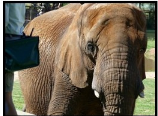
African Elephants Big boys...