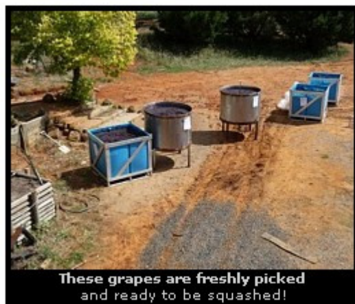
These grapes are freshly picked and ready to be squashed!

Later that afternoon we visited the Old Dubbo Gaol (that means Jail for our American friends), where we wandered the grounds, saw the cramped cells and also got to experience the scary solitary cell. The solitary cell was a very small room and once you entered you could not see any light at all... just being in there for 30 sec was scary and I can't imagine what a few days in there would be like.