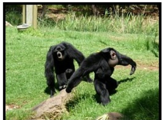
They were chasing each other while howling loudly... hilarious!