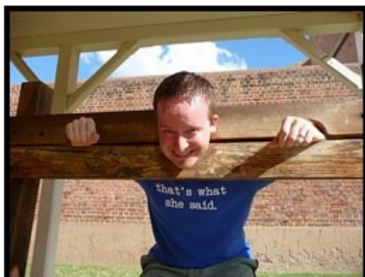
Not totally unexpected... My T-shirt will get me in trouble ;)