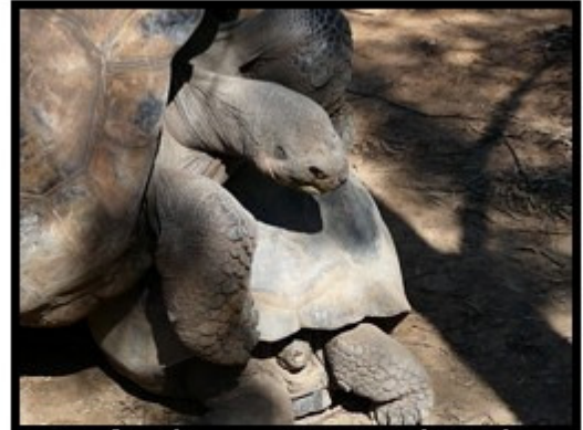
We found some massive turtles in the middle of some... hmmm... activities