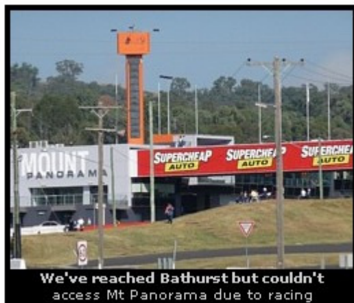
We've reached Bathurst but couldn't access Mt Panorama due to racing