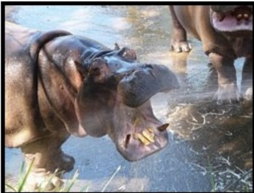
Who needs a dentist... when you have a pressure hose!