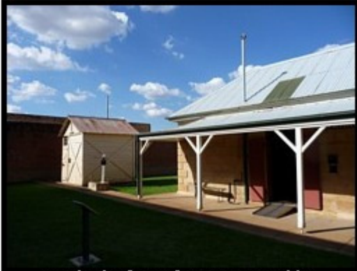
We had a free afternoon in Dubbo and spent it at a Prison...