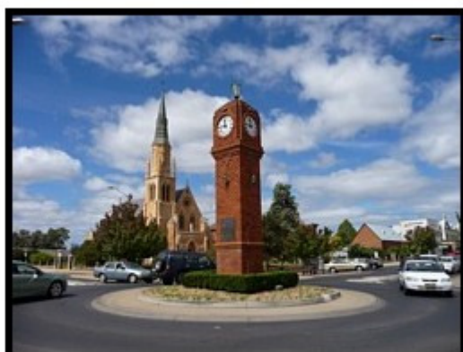
Made it to Mudgee Time to sample some more wines