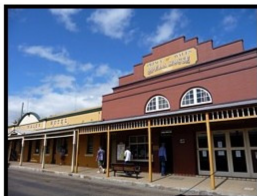
Along the Main street in Gulgong