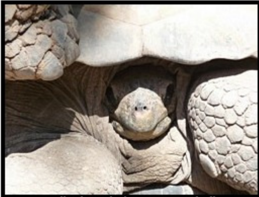
Talk about hiding in your shell Can barely see it's face...