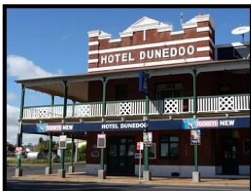
We found Dunedoo... where a loo stop was mandatory ;)