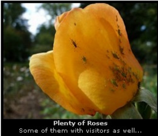
Plenty of Roses Some of them with visitors as well...

Later on while reading the hotel description it did say that since the area is close to the desert and very dry they do get quite a few insects.... really, a FEW?!? Anyway, we eventually got rid of them all and the rest of the evening continued uneventful.