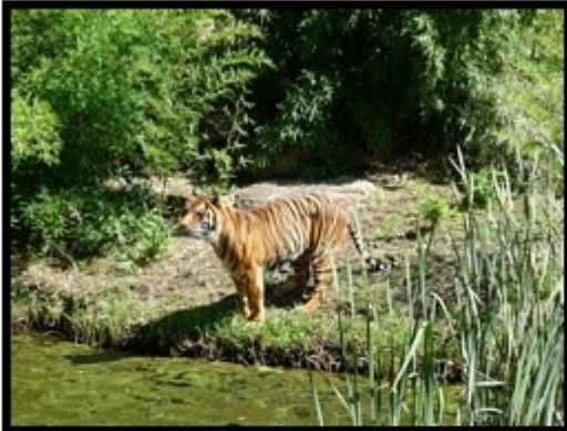
Here Kitty, Kitty... Good Kitty!