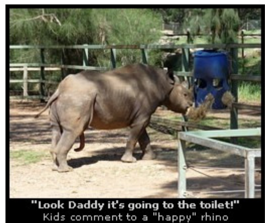
"Look Daddy it's going to the toilet!" Kids comment to a "happy" rhino