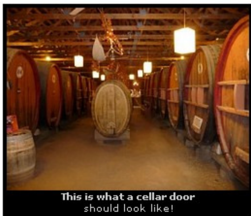
This is what a cellar door should look like!