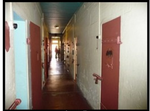
The Cells Quite small...