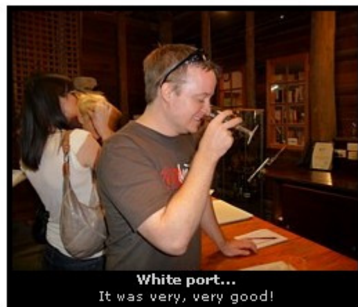
White port... It was very, very good!