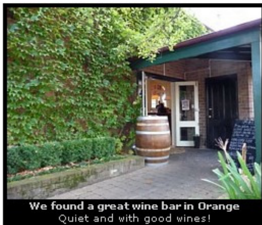
We found a great wine bar in Orange Quiet and with good wines!

So, another Easter came and went and we had another great little roadtrip, in fact it was so good that in the future I don't know if we should go to the Hunter Valley, Orange or Mudgee for wines!