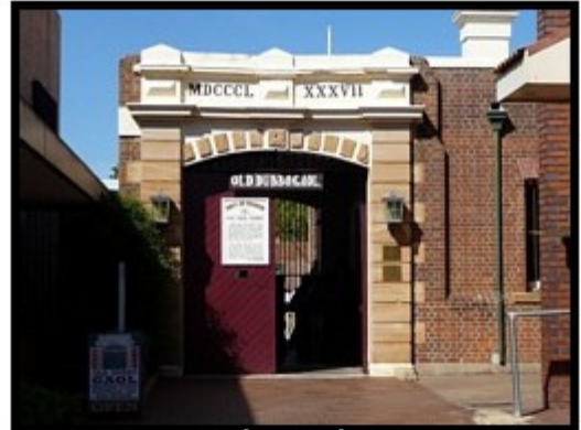
Jail or Gaol?!? Old Dubbo Gaol is where we are...