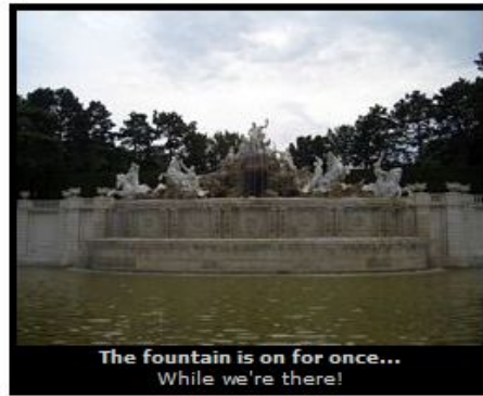
The fountain is on for once... While we're there!