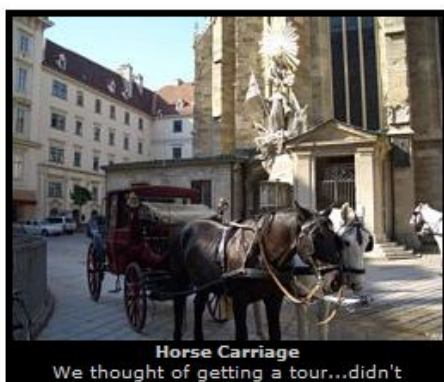
Horse Carriage We thought of getting a tour...didn't