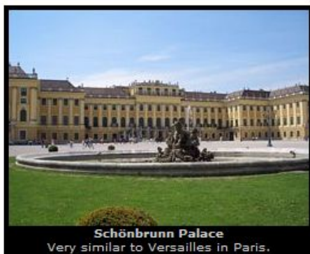
Schönbrunn Palace Very similar to Versailles in Paris.

Easy to tell.... ...that we are back in Europe!