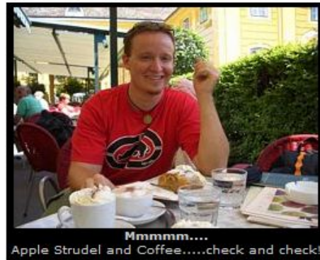
Mmmmm.... Apple Strudel and Coffee....check and check!