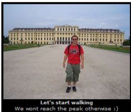
Let's start walking We won't reach the peak otherwise ;)