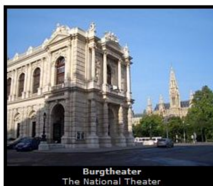
Burgtheater The National Theater

The tour took us around 40min and we then walked to the back of the Palace, the garden section. By now our feet were pretty tired from lots and lots of walking the last few days, a long flight with no sleep and I had some blisters annoying me as well. But that didn't stop us, we realized that we would have regretted not continuing up to the top of the hill. So 20min later we were standing on the top of the The Gloriette (the building on the hill) looking down at the Palace and having quite a view over the rest of Vienna as well. Well worth it.... Such a walk deserved a beer before heading back and here I had my first beer of the day (another one off the list).