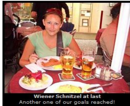
Wiener Schnitzel at last Another one of our goals reached!