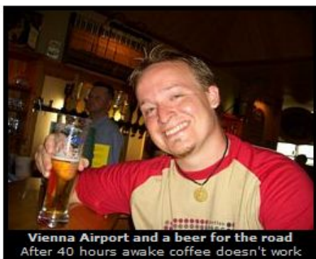
Vienna Airport and a beer for the road After 40 hours awake coffee doesn't work