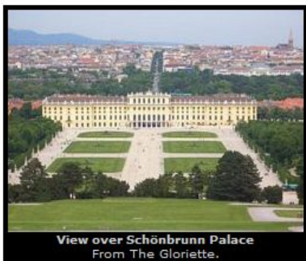
View over Schönbrunn Palace From The Gloriette.