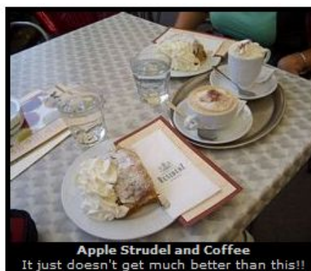
Apple Strudel and Coffee It just doesn't get much better than this!!

Around 9am we were back at Stephansplatz where we found a coffee house, had some coffee and also a small piece of Apple Strudel (that's 2 off our list). After that we did some more exploring, we went inside the Cathedral and then caught the Ring Tram which circles the city centre. This took us around 15min and we got off the tram a few stops from where we started it.