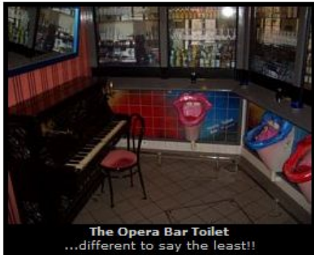
The Opera Bar Toilet ...different to say the least!!