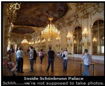
Inside Schönbrunn Palace Schhh....we're not supposed to take photos.