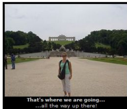
That's where we are going... ...all the way up there!