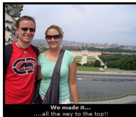
We made it... ...all the way to the top!!