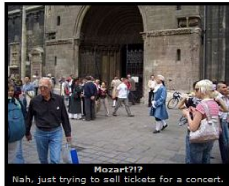
Mozart?!? Nah, just trying to sell tickets for a concert.