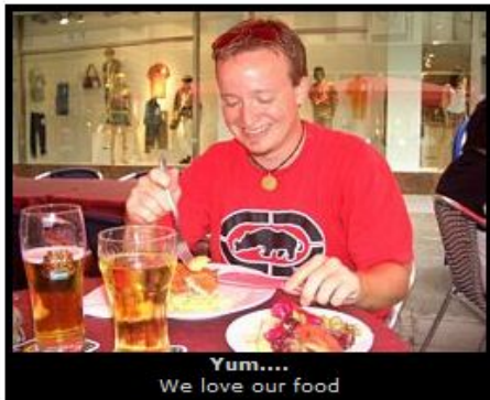
Yum.... We love our food