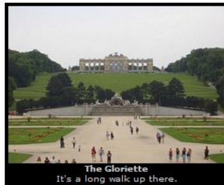
The Gloriette It's a long walk up there.