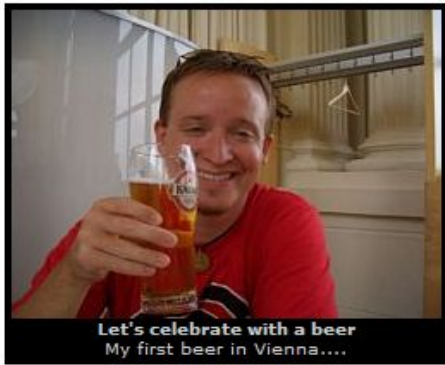
Let's celebrate with a beer My first beer in Vienna....