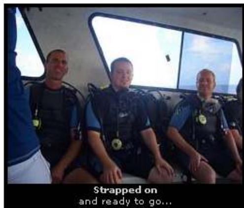
Strapped on and ready to go...