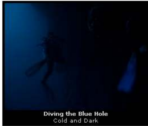
Diving the Blue Hole Cold and Dark