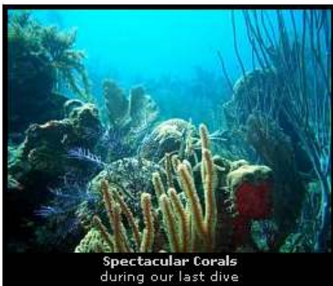
Spectacular Corals during our last dive