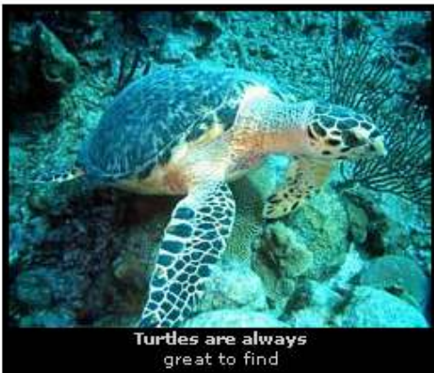
Turtles are always great to find