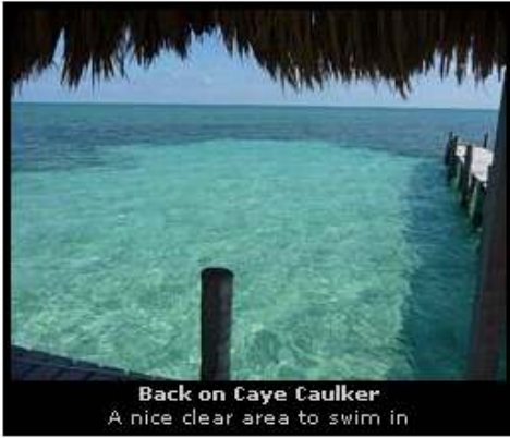
Back on Caye Caulker A nice clear area to swim in