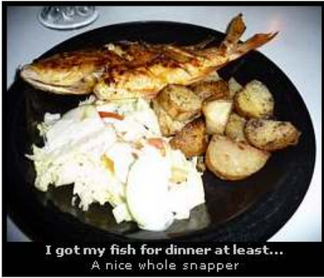
I got my fish for dinner at least... A nice whole snapper