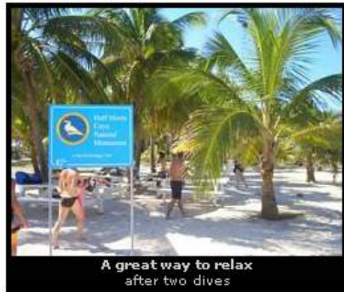
A great way to relax after two dives