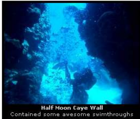
Half Moon Caye Wall Contained some awesome swimthroughs