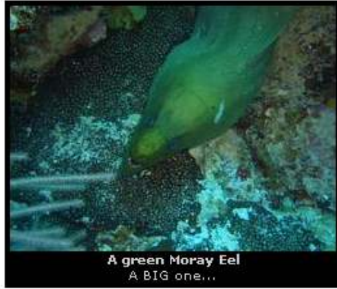
A green Moray Eel A BIG one...