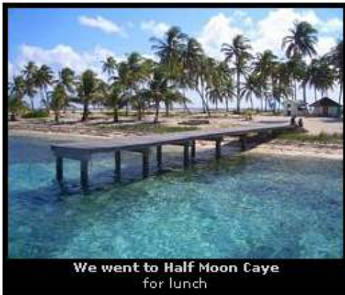
We went to Half Moon Caye for lunch