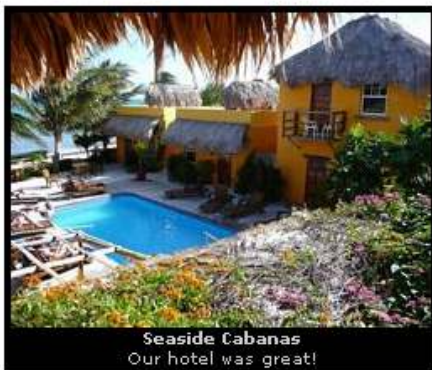
Seaside Cabanas Our hotel was great!

This is located at the end of the island and it's just what it sounds like, the north and south island are split by a water way. Apparently hurricane Hattie split the island in two in 1961. Today this is the best part of the island if you want to go for a dip in the ocean.