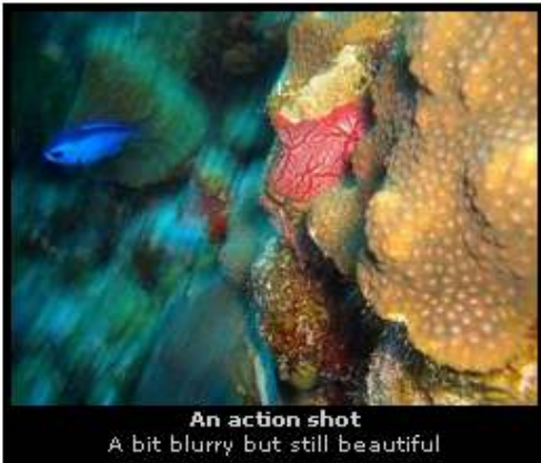
An action shot A bit blurry but still beautiful