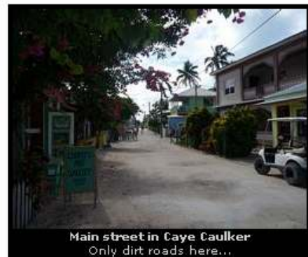
Main street in Caye Caulker Only dirt roads here...

The rest of the day and the evening we did as little as possible, we relaxed by the pool, we had a few drinks and after dinner we had an early night since I had to get up early for my dives.