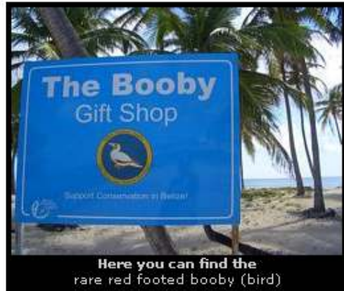
Here you can find the rare red footed booby (bird)