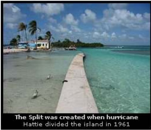
The Split was created when hurricane Hattie divided the island in 1961

The next morning I got up at 5.00am (the things I do for my diving), got dressed and walked very slowly to the dive shop at 5.30am where they provided us zombies with some much needed coffee and some bread for breakfast.