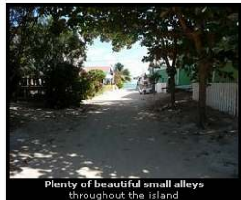
Plenty of beautiful small alleys throughout the island