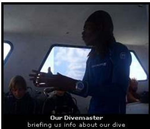
Our Divemaster briefing us info about our dive