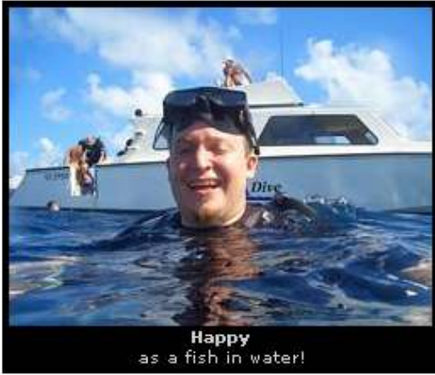
Happy as a fish in water!