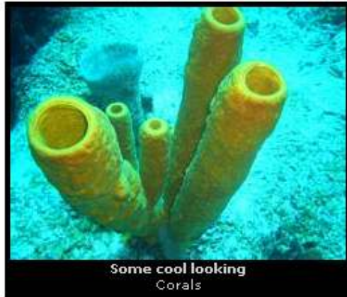
Some cool looking Corals