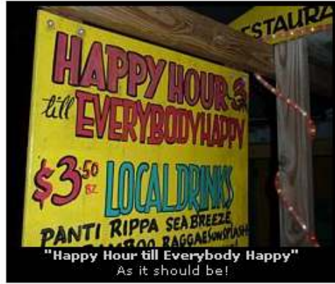
"Happy Hour till Everybody Happy" As it should be!