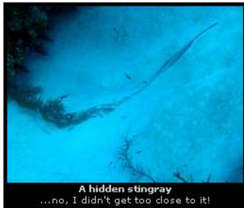
A hidden stingray ...no, I didn't get too close to it!