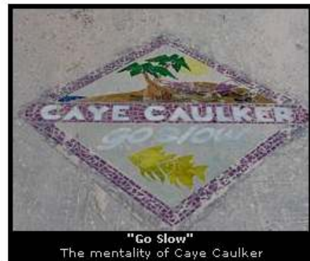
"Go Slow" The mentality of Caye Caulker

We had a booking at the Seaside Cabanas but since we arrived on the island earlier than expected we couldn't check in for another 3 hours or so.... So we just adapted to the island and took it slow, had a nice breakfast and just strolled up and down the island. Eventually we came upon what's known as "The Split",