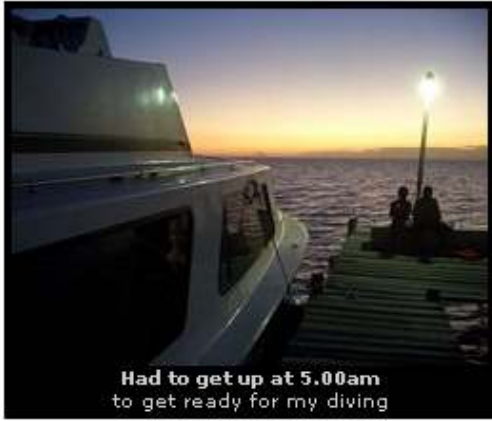
Had to get up at 5.00am to get ready for my diving