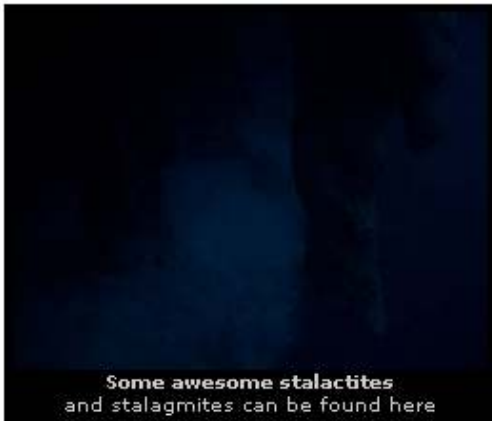
Some awesome stalactites and stalagmites can be found here