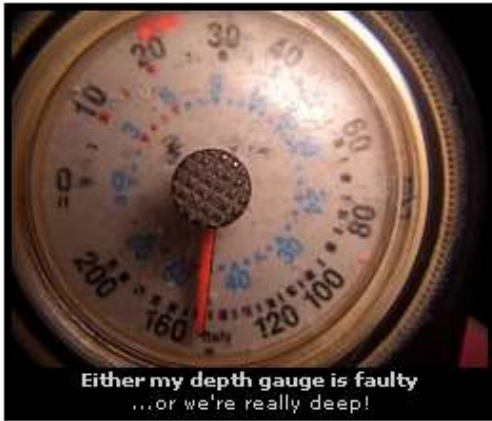
Either my depth gauge is faulty ...or we're really deep!