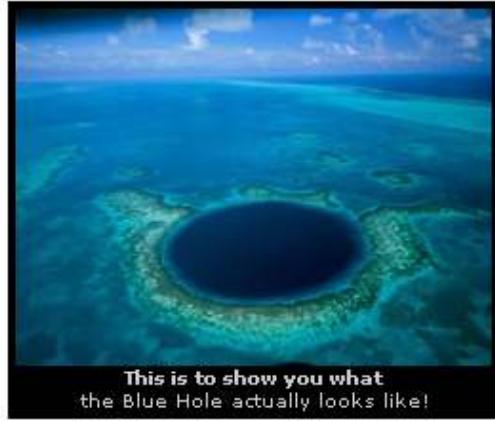
This is to show you what the Blue Hole actually looks like!