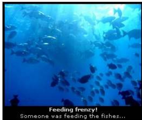
Feeding frenzy! Someone was feeding the fishes...