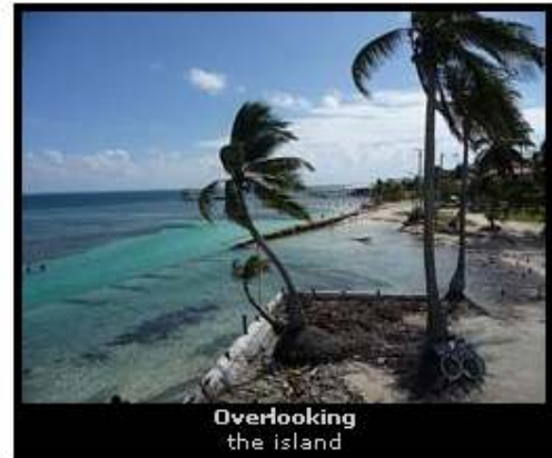
Overlooking the island

I must say that of all the dives I've done, this one places in my top 5!