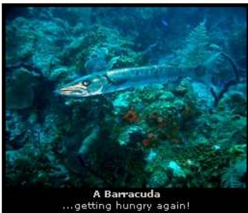
A Barracuda ...getting hungry again!