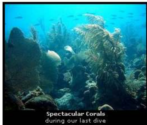
Spectacular Corals during our last dive