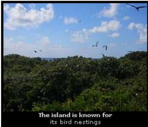
The island is known for its bird nestings