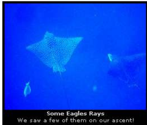
Some Eagles Rays We saw a few of them on our ascent!