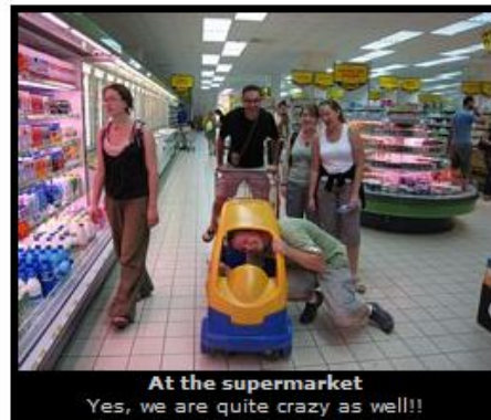
At the supermarket Yes, we are quite crazy as well!!