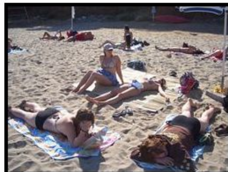
And the girls are really appreciating it!