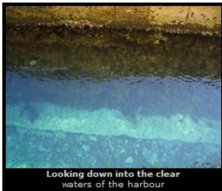
Looking down into the clear waters of the harbour