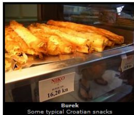
Burek Some typical Croatian snacks