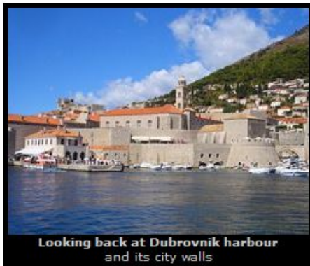
Looking back at Dubrovnik harbour and its city walls