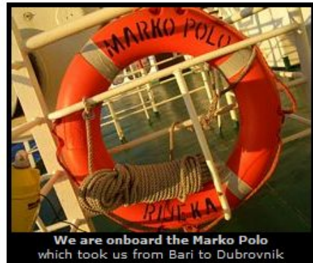
We are onboard the Marko Polo which took us from Bari to Dubrovnik