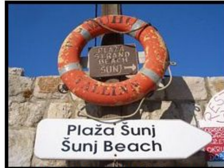
We're on our way to the famous beach on the island