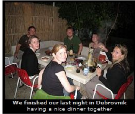
We finished our last night in Dubrovnik having a nice dinner together