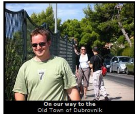
On our way to the Old Town of Dubrovnik

The ferry was quite cheap and it didn't take us longer than 40min to get to where we wanted to go. And our first impression of the island was that it's beautiful, just as the boat takes you into the harbour you first notice the old church hovering over the small village. Then when the boat anchors to the dock you look down into the water and you're able to see all the way to the bottom of the ocean. We have never been in water with such clarity, it's amazing!