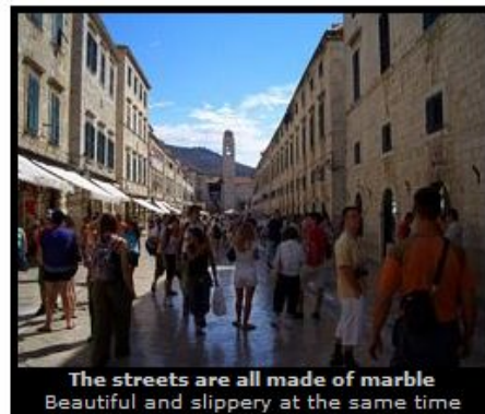
The streets are all made of marble Beautiful and slippery at the same time