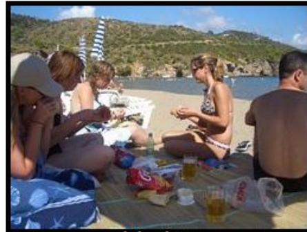
It's lunch time Good thing we brought a picnic