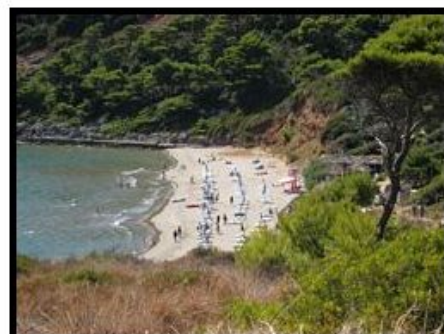
It has a very nice sandy beach Supposed to be one of the best in Croatia