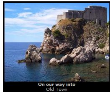
On our way into Old Town