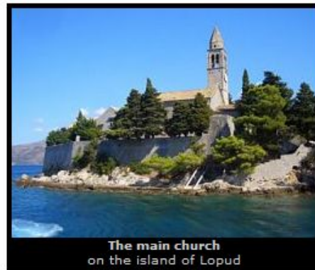
The main church on the island of Lopud