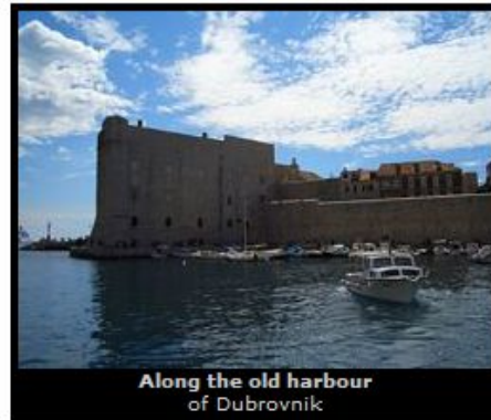
Along the old harbour of Dubrovnik