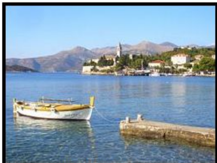
The island of Lopud is really beautiful