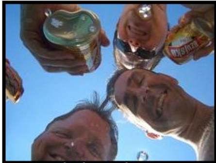
The Three Musketeers Enjoying our beers!