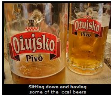
Sitting down and having some of the local beers