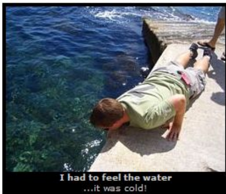
I had to feel the water ...it was cold!