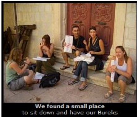
We found a small place to sit down and have our Bureks