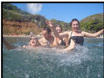
The few of us who braved the cold are just playing around in the water