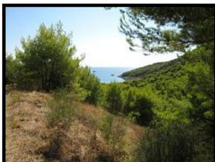
We had to walk all over the island to get there though