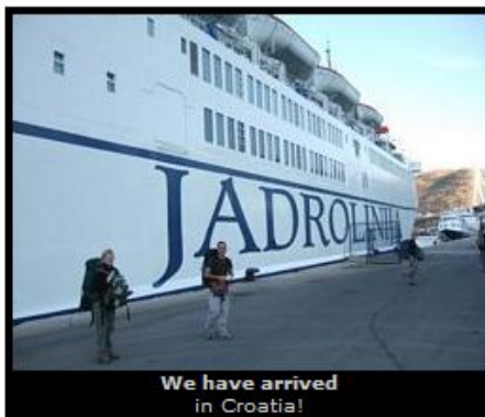
We have arrived in Croatia!