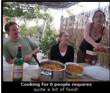
Cooking for 6 people requires quite a bit of food!