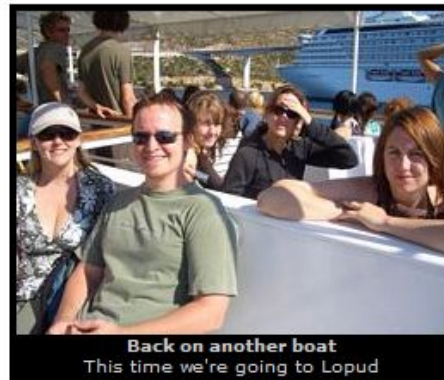
Back on another boat This time we're going to Lopud