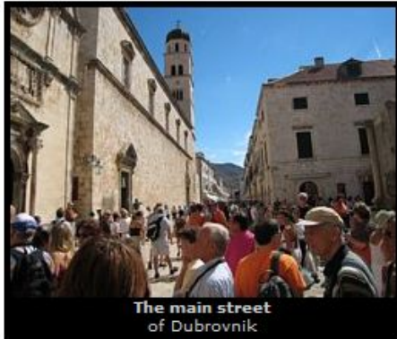
The main street of Dubrovnik