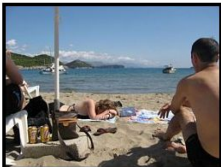
Such a nice beach to snooze on