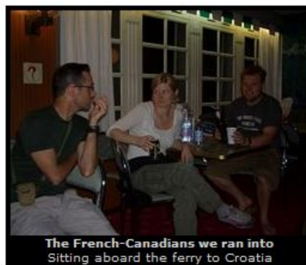
The French-Canadians we ran into Sitting aboard the ferry to Croatia