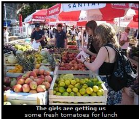
The girls are getting us some fresh tomatoes for lunch