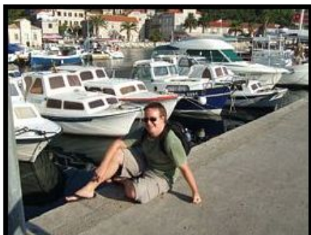
Sitting down and waiting for our boat back to Dubrovnik