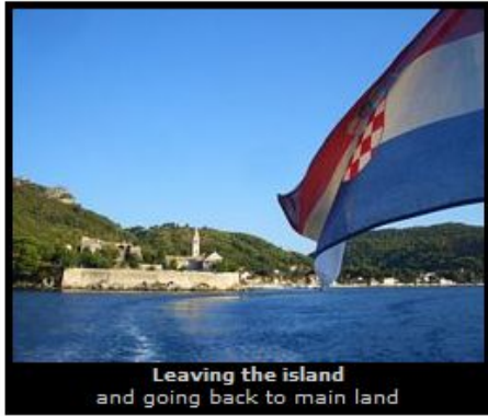
Leaving the island and going back to main land