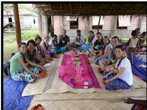
At the local village Sitting down for some local made tea