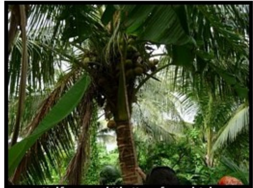
Halfway and it's time for a drink Bring on the coconuts