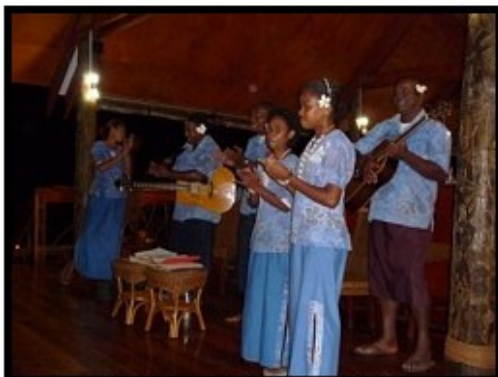
Farewell songs were sung the night before departure