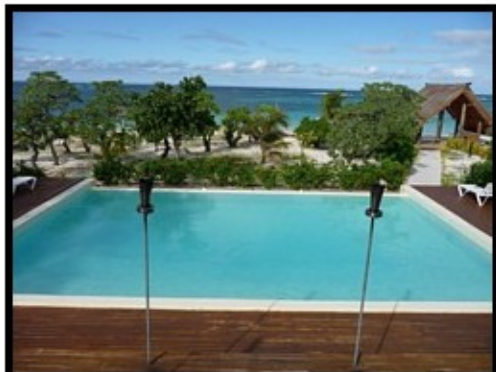
We have a pool this time Nice to mix ocean with some pool time