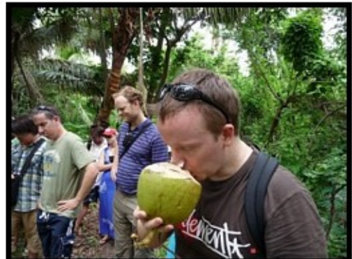
Coconut water Refreshing and tasty!