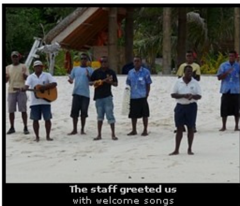
The staff greeted us with welcome songs

Our greeting here was even more impressive than it had been on our previous island. We had about 10 people on the beach singing to us, handing us leis and taking us up to the restaurant for our complimentary drinks (also, one of the great things everywhere in Fiji was that you didn't have to worry about your luggage, they carried it from the boat to your Bure... we could get used to this!).