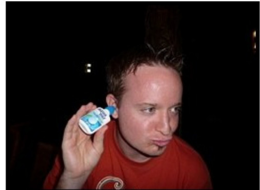
Aqua Ear... Too much snorkelling I think