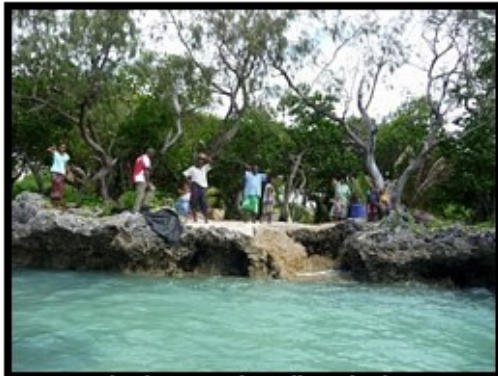
We're leaving the village by boat Everyone is very friendly...