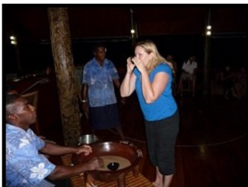
Kava Tastes like muddy water...