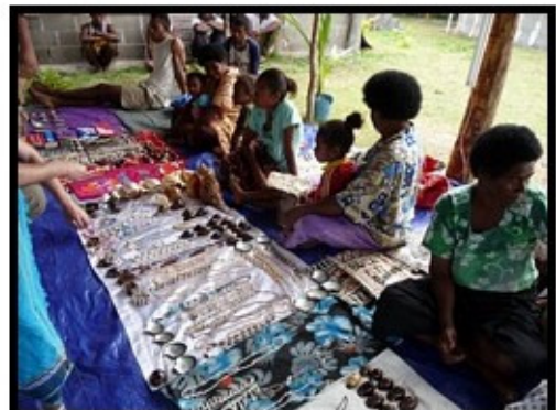
After the tea it's shopping time The villagers show us their goods...