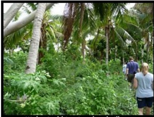
We're trekking to a local village On the other side of the island