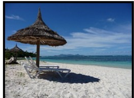
But in case you don't like the pool We have a pretty good beach here!