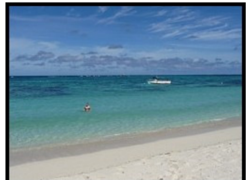
Back in the water again... There's no way to keep her out ;)