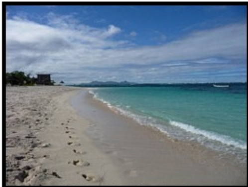
Walking along the beach One of our activities on the island