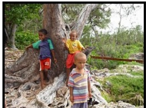
The village boys Very playful...