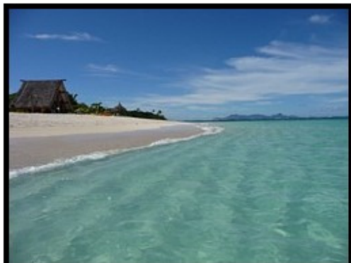
The beach at Viwa was definately its best feature