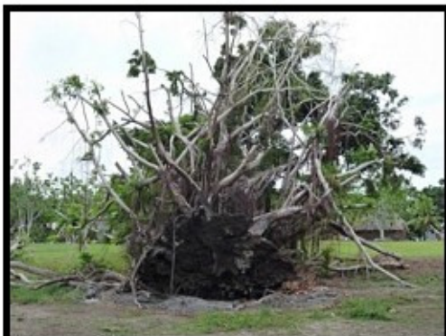
The last hurricane was in December 2009 and we can still see the evidence