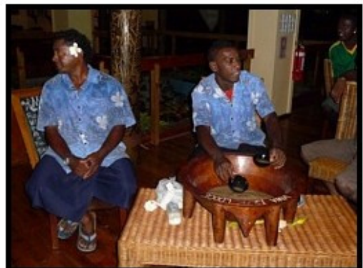
It's Kava Time! The traditional drink!