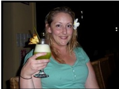
Happy Hour again... We didn't miss a single one ;)

Viwa was such a great island that we would happily return in the future... Sure it might be a bit further away than the other islands in the Yasawas but it's all worth it in the end!