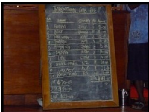
Hermit Crab Race The participants and their bids