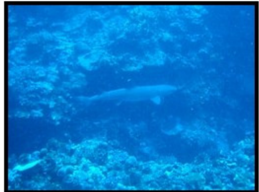
I also found a couple of sharks Only a small white tip though