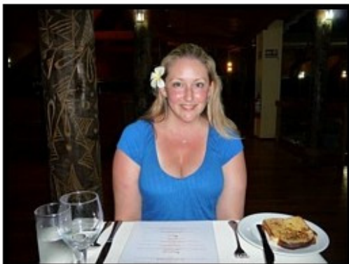
It's dinner time... We were all given frangipanis to wear!