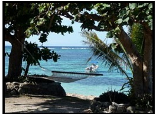
No relaxing on hammocks this time The ones at the other island were better