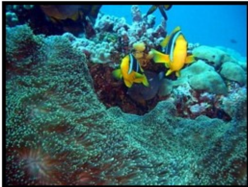
I got to do some diving here and found some cute clownfish