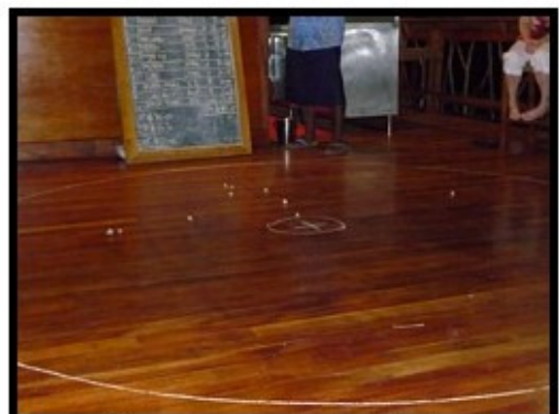
Our guys came second last... At least with last you win something