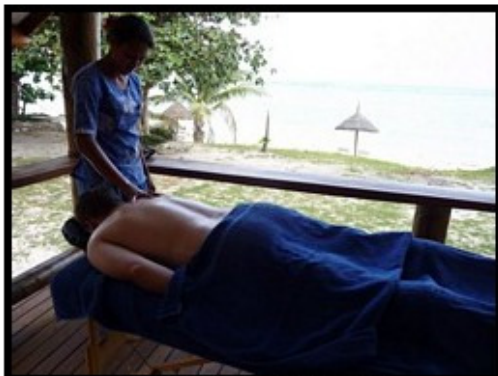
A much needed massage on our porch