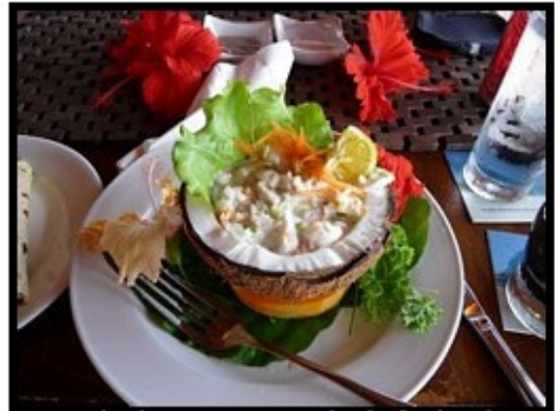
We're having some Kokoda for lunch A Fijian ceviche with coconut milk... YUM!