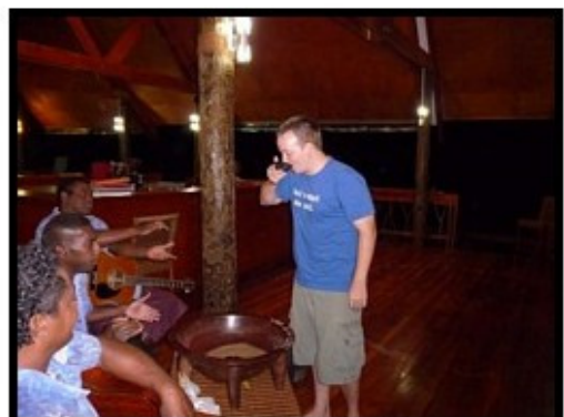
I went back for more... Not that I liked it... but it's what you do ;)