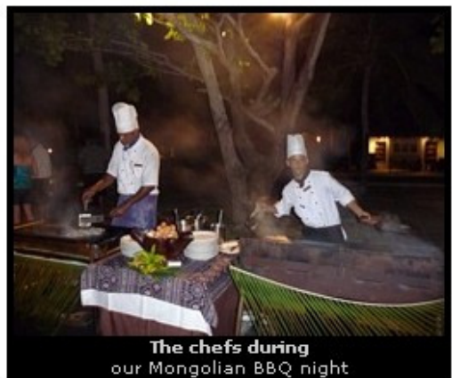
The chefs during our Mongolian BBQ night