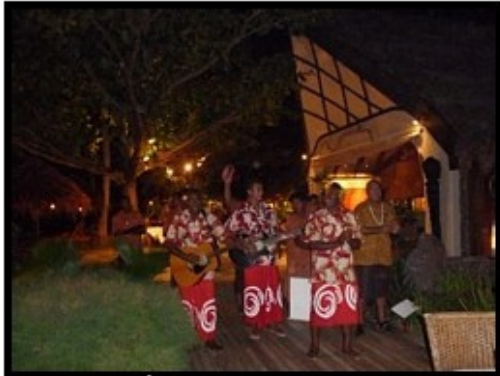
The Singing continues There is singing everywhere...