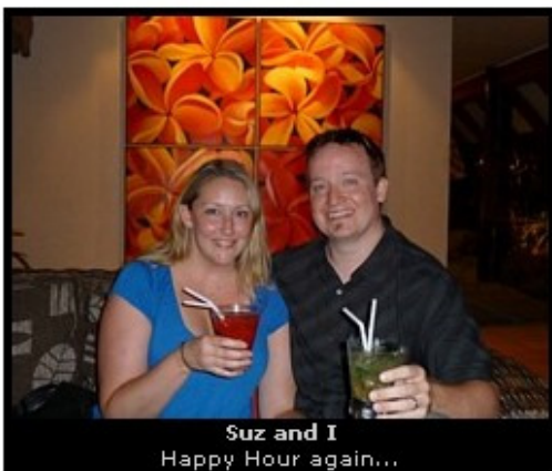
Suz and I Happy Hour again...