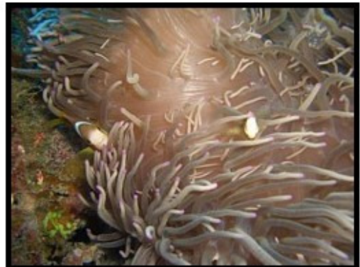
Some more clown fishes I like these guys!