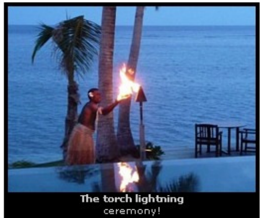
The torch lighting ceremony!