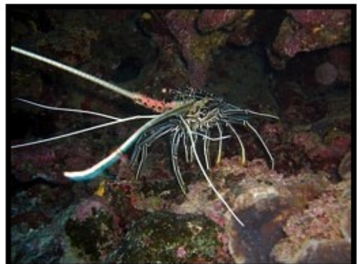
That's an enormous cray fish!