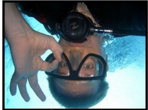
Time for some more diving All is OK!