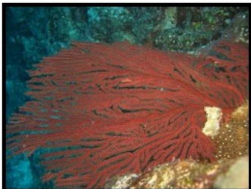
The colour of the coral really appears when flash is used