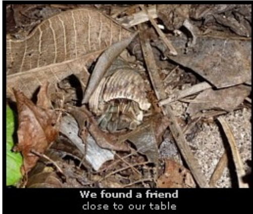
We found a friend close to our table