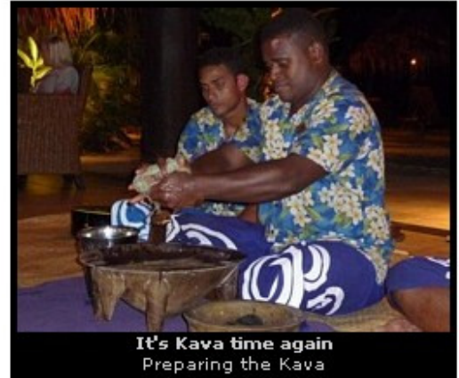
It's Kava time again Preparing the Kava