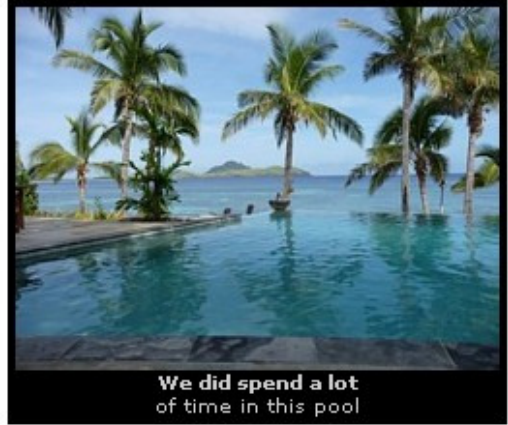
We did spend a lot of time in this pool