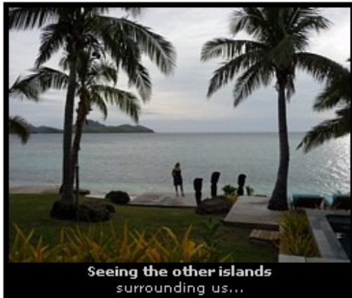
Seeing the other islands surrounding us...