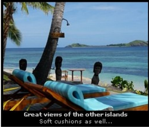
Great views of the other islands Soft cushions as well...