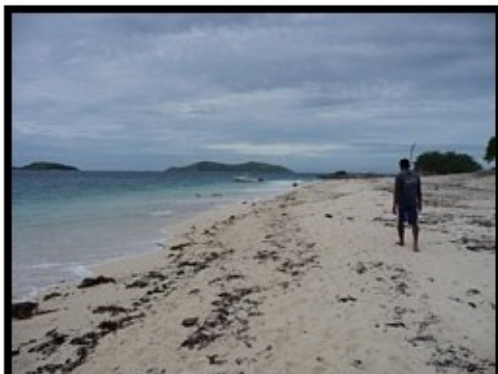
We had an overcast day but it was still a good day!