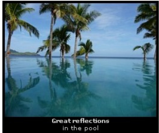
Great reflections in the pool