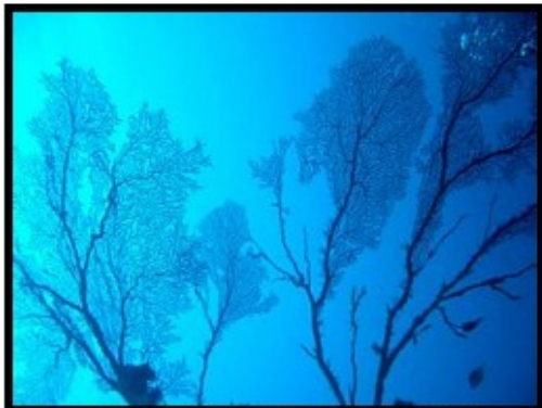
I now know why the site is called Sherwood Forrest!