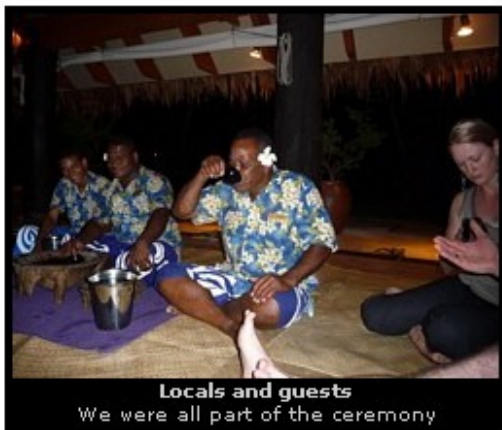
Locals and guests We were all part of the ceremony