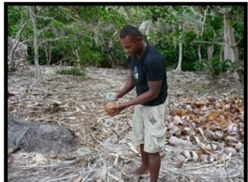
...and also how to crack them!