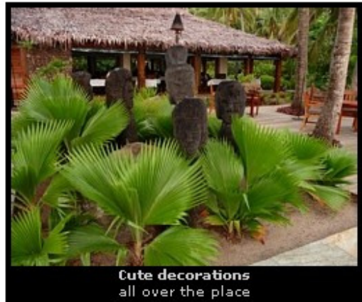
Cute decorations all over the place