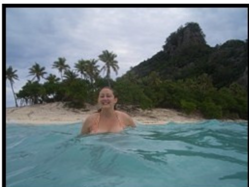
The water is great ...the snorkeling was alright as well!