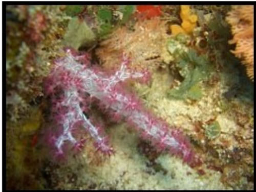
Beautiful soft corals surround me