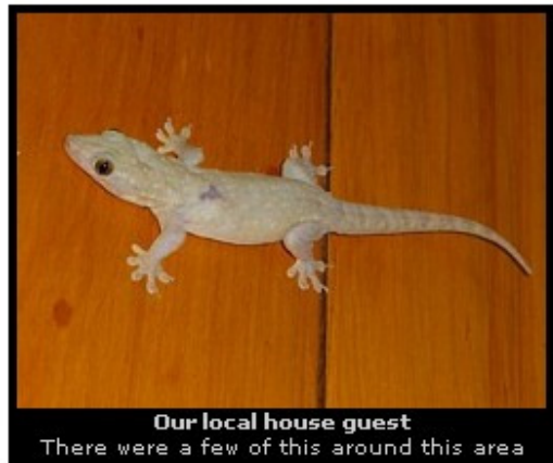
Our local house guest There were a few of this around this area