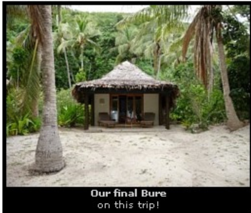
Our final Bure on this trip!