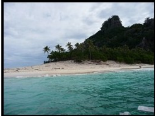
Cast Away! This is where the movie was filmed