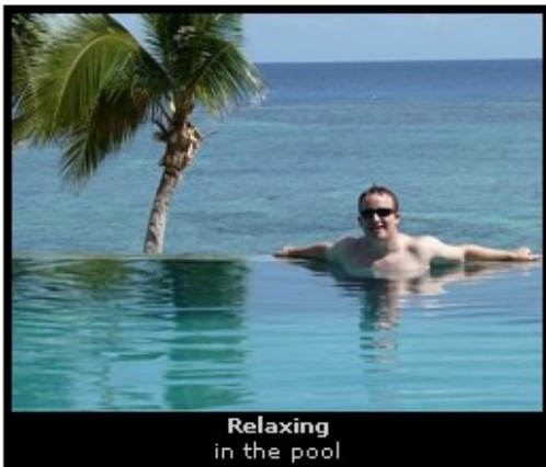
Relaxing in the pool