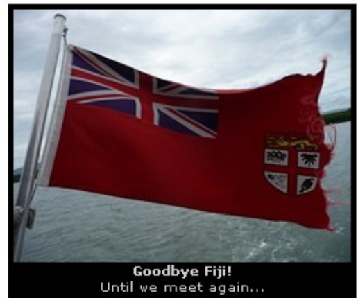
Goodbye Fiji! Until we meet again...