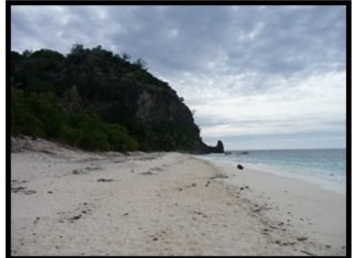
It was quite nice to be all by ourselves on a deserted island