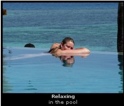
Relaxing in the pool