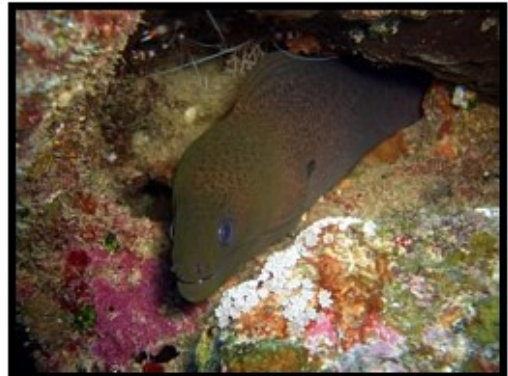
A Moray Eel shares a hole with a cleaning shrimp