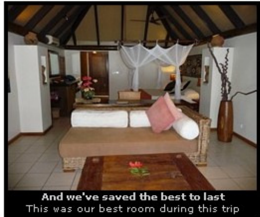
And we've saved the best to last This was our best room during this trip