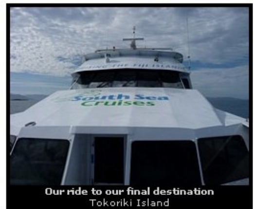
Our ride to our final destination Tokoriki Island

Oh yes... and we also had a great outdoor shower which we ended up using every single time... (it was just so much nicer than the indoor one).