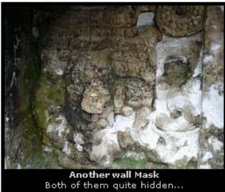
Another wall Mask Both of them quite hidden...