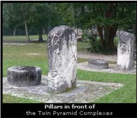
Pillars in front of the Twin Pyramid Complexes