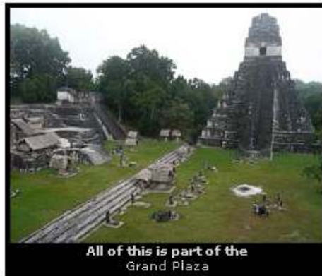
All of this is part of the Grand Plaza