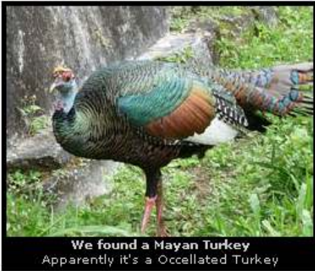
We found a Mayan Turkey Apparently it's a Ocellated Turkey