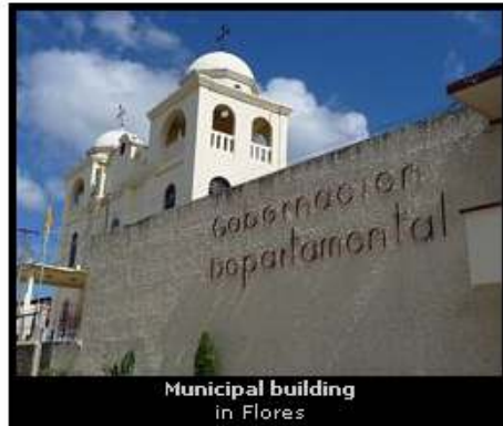
Municipal building in Flores