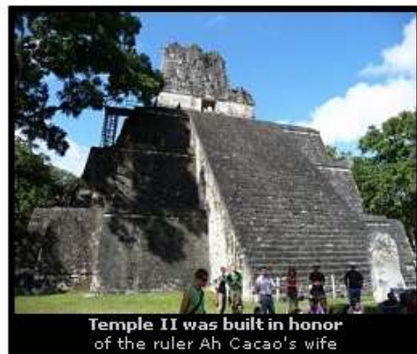
Temple II was built in honor of the ruler Ah Cacao's wife