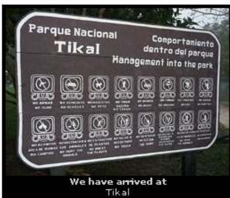
We have arrived at Tikal