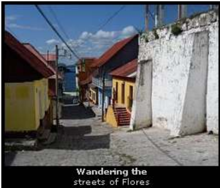
Wandering the streets of Flores