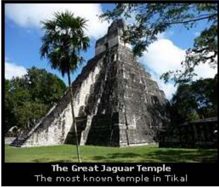
The Great Jaguar Temple The most known temple in Tikal