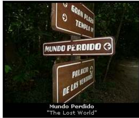
Mundo Perdido "The Lost World"