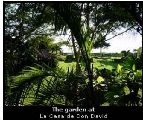
The garden at La Casa de Don David