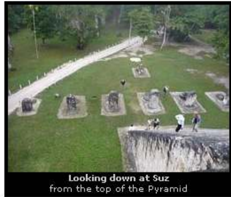
Looking down at Suz from the top of the Pyramid