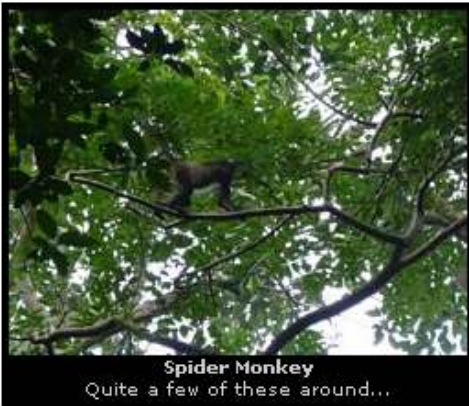
Spider Monkey Quite a few of these around...