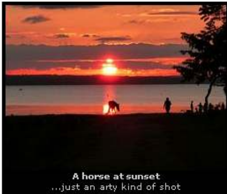
A horse at sunset ...just an arty kind of shot

Our visit in Guatemala was short, but we both really enjoyed it a lot, people are very friendly, the food is good and besides Tikal, there is so much more to see and experience here. Who knows.... we might come back here some time soon again!