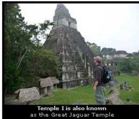
Temple I is also known as the Great Jaguar Temple