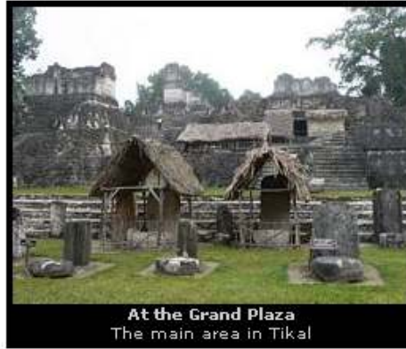
At the Grand Plaza The main area in Tikal