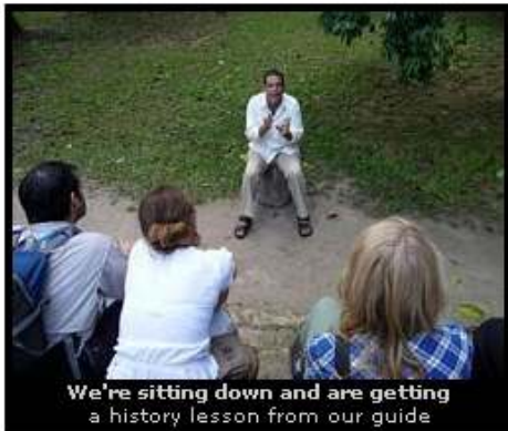
We're sitting down and are getting a history lesson from our guide