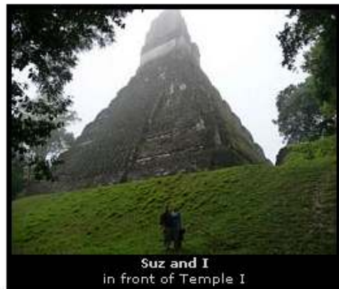
Suz and I in front of Temple I