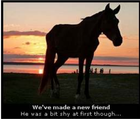
We've made a new friend He was a bit shy at first though...

Our original plan was to take the local bus into the city but when a man (Bruno) approached us and asked if we needed a taxi we just decided to go with it. In the end we managed to use him as a personal taxi driver for that day and he was also able to take us to the airport the next morning.