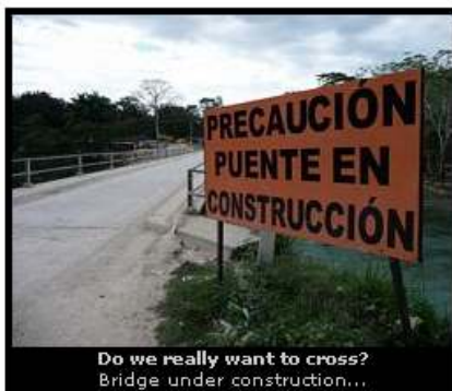
Do we really want to cross? Bridge under construction...

Needless to say, it wasn't the most comfortable bus ride. At least it didn't go on for that long. After around 3½ hours we reached the Guatemalan border where everyone had to disembark, pass Belizean immigration and then the Guatemalan immigration. All of this took another hour before all the passengers passed through.