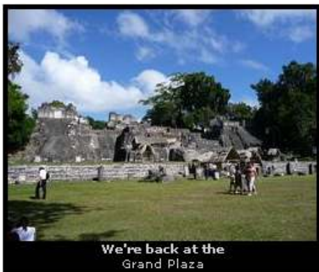
We're back at the Grand Plaza