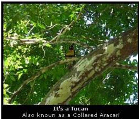
It's a Toucan Also known as a Collared Aracari