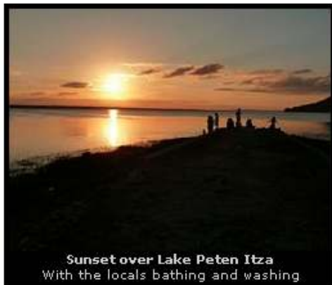
Sunset over Lake Peten Itza With the locals bathing and washing