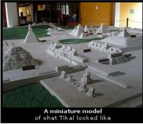
A miniature model of what Tikal looked like