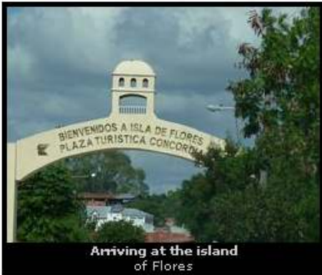
Arriving at the island of Flores