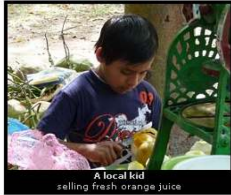
A local kid selling fresh orange juice