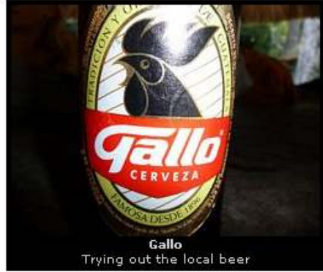
Gallo Trying out the local beer