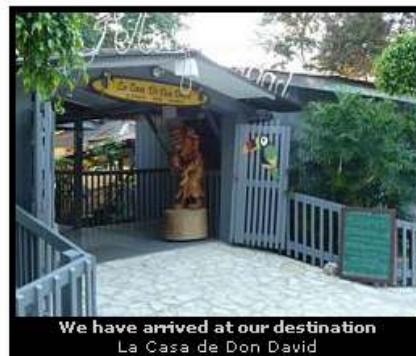
We have arrived at our destination La Casa de Don David

As soon as we had checked in we knew that we had chosen a great place to stay at.... its location is perfect, right next to the lake and it's also very quiet and peaceful. We loved it straight away!