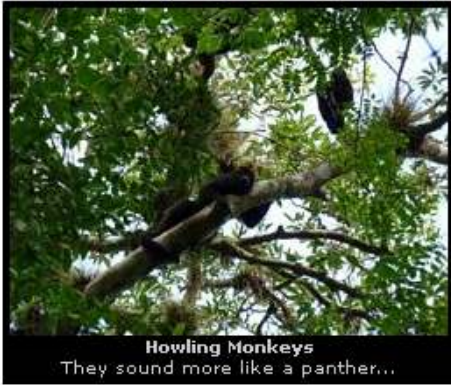
Howling Monkeys They sound more like a panther...