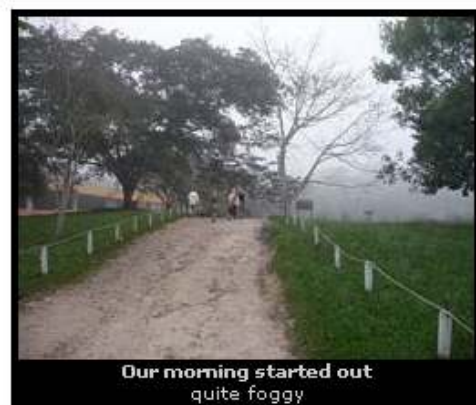
Our morning started out quite foggy