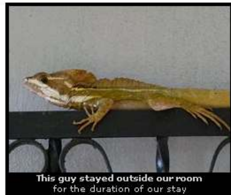
This guy stayed outside our room for the duration of our stay