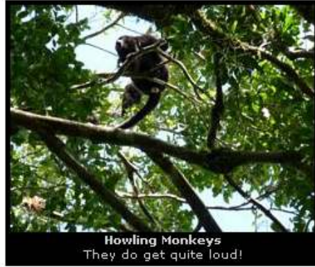
Howling Monkeys They do get quite loud!