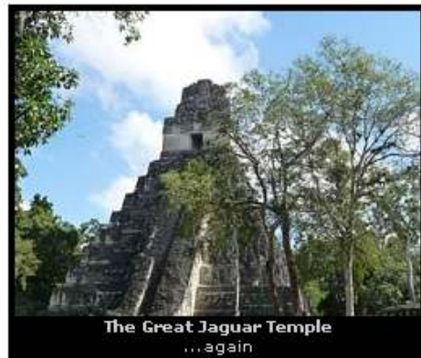
The Great Jaguar Temple ...again