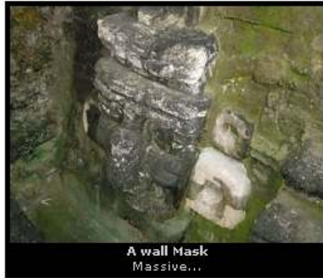
A wall Mask Massive...