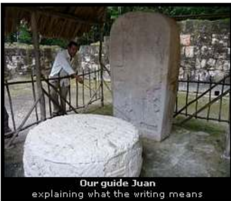
Our guide Juan explaining what the writing means