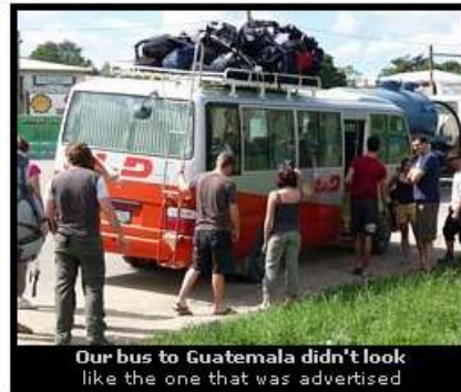
Our bus to Guatemala didn't look like the one that was advertised