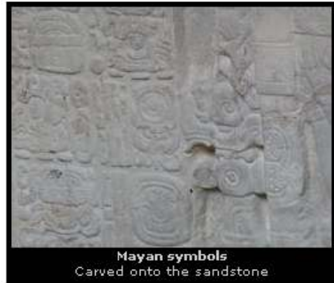
Mayan symbols Carved onto the sandstone