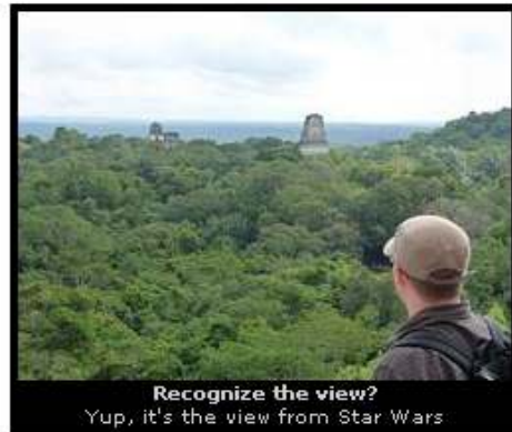
Recognize the view? Yup, it's the view from Star Wars