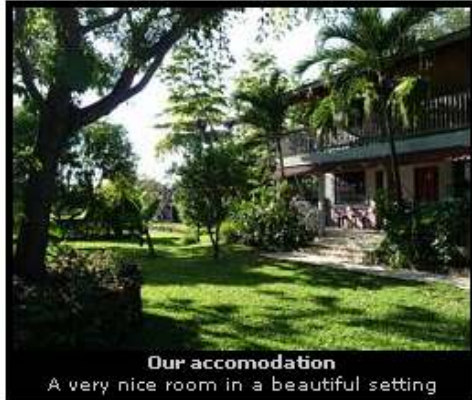
Our accomodation A very nice room in a beautiful setting

We decided to do a Tikal tour the very next day and signed up to their package with transport, lunch and a local guide.