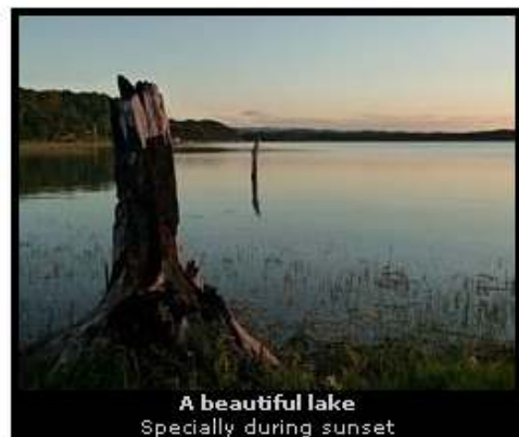
A beautiful lake Specially during sunset

We still had one more day in Guatemala though... so the next morning after breakfast (more lunch really if you go by the clock) we decided to make a day trip into Flores.