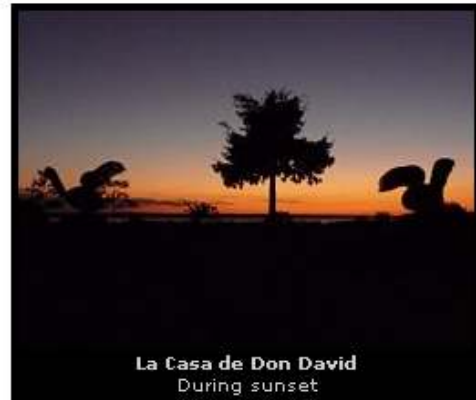
La Casa de Don David During sunset