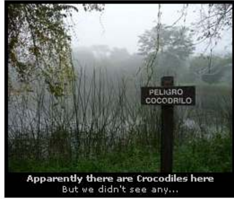
Apparently there are Crocodiles here But we didn't see any...