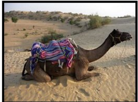
We've stopped to have a short break