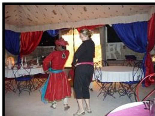
Suz was dragged up to participate She did a better job than me...