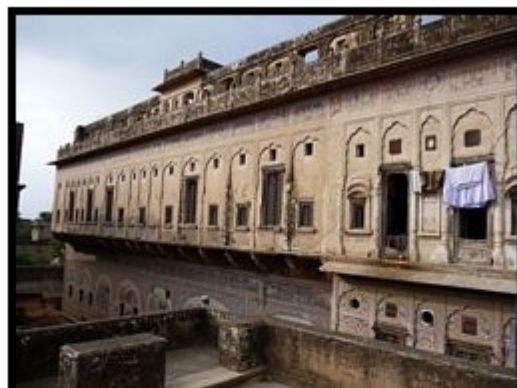
Mandawa Havelis Many beautiful buildings in the area