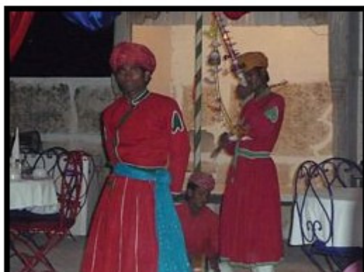
Our entertainment for the night Singing and dancing