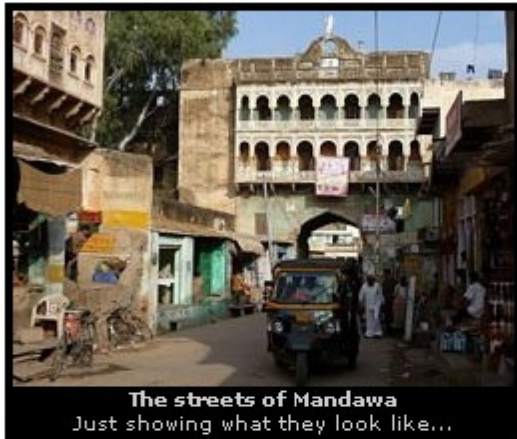
The streets of Mandawa Just showing what they look like...

Back in Bikaner we had a bit of a relaxing time that afternoon/evening and the following morning before we embarked on a camel trek.