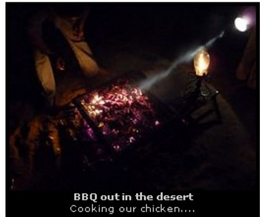
BBQ out in the desert Cooking our chicken....