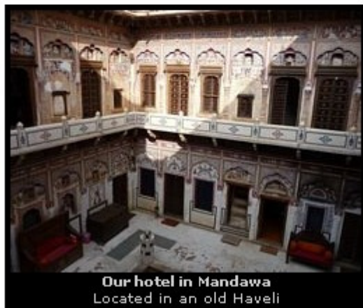
Our hotel in Mandawa Located in an old Haveli

This of course is also going to attract all sorts of people to you... We had a young boy (13-14 years old) asking us if we wanted a tour of the havelis in town for only 50 Rupees ($AUD 1.25). When we declined his offer he of course persisted for a while and said that we had spent lots of money on airplane, car and hotel... why not spend a little bit on him. Cheeky aren't they...?