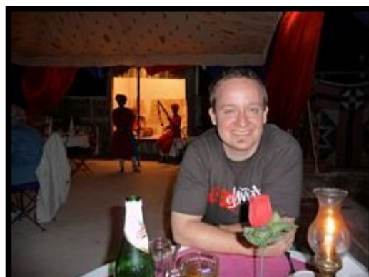
Dinner at our hotel Nice rooftop restaurant