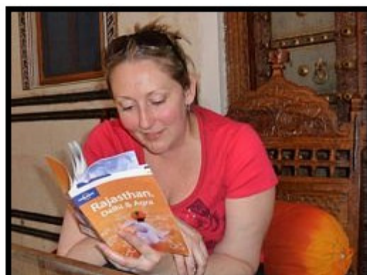
Suz reading about our next destination and what we can expect...