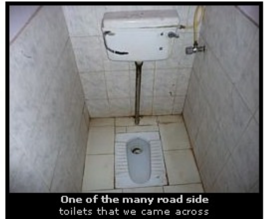
One of the many road side toilets that we came across

Also, since we'd been in the comfort of the car previously while travelling this was really the first time that we were able to walk by ourselves and explore at our own pace.