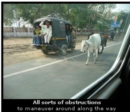
All sorts of obstructions to maneuver around along the way

Our first destination was the small town of Mandawa. The distance from Delhi is only 260km but getting out of Delhi takes quite a bit of time and the remaining roads are very narrow with plenty of twists and turns. Add on top of this the towns you go through where you need to maneuver people, bikes, rickshaws and cows, you then realise that it will take a bit longer than you might have expected.