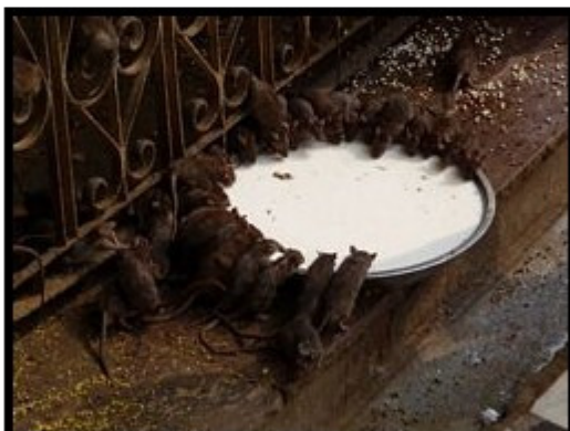
Oh how sweet... They left some milk out for the small ones