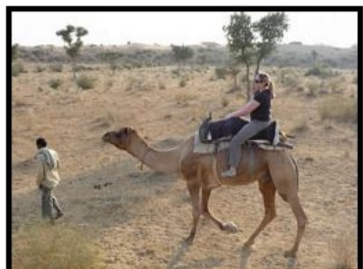
Camel trekking in the desert Moving along at a slow pace...