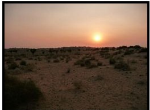
The sun is setting over the desert in Bikaner