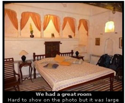
We had a great room Hard to show on the photo but it was large