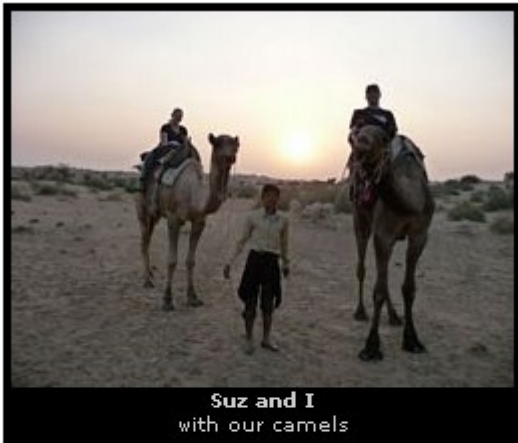
Suz and I with our camels