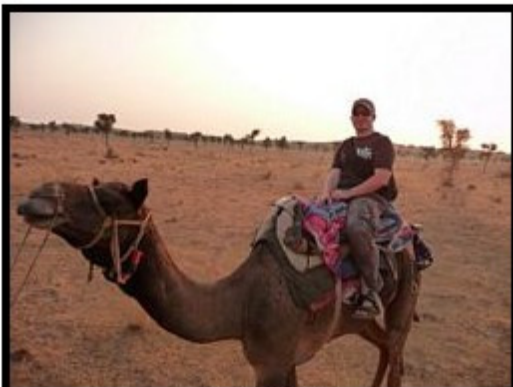
Riding a camel into the sunset