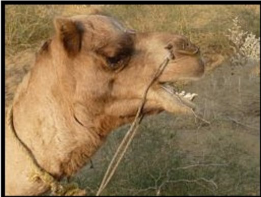
One of our camels About to have a snack