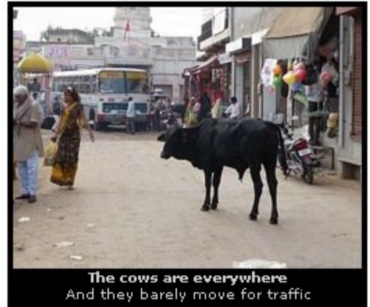
The cows are everywhere And they barely move for traffic