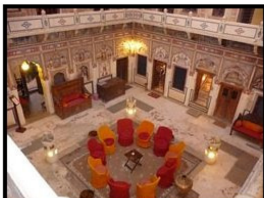
Evening in Mandawa