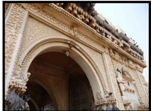
So many small details... on the entrance to the temple