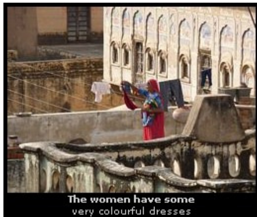
The women have some very colourful dresses

The next morning our trip continued towards Bikaner.