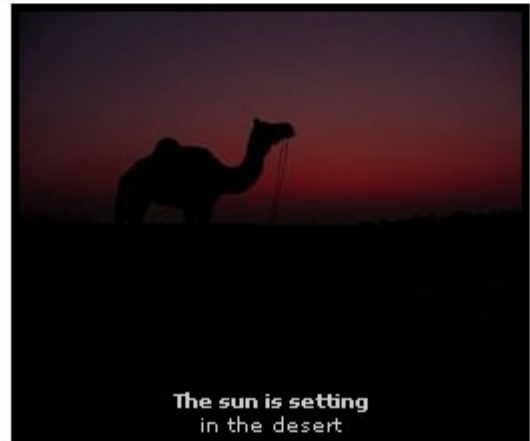
The sun is setting in the desert