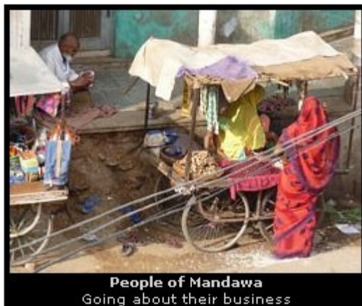
People of Mandawa Going about their business