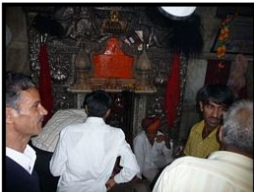
The holy shrine... No non-Indians allowed!