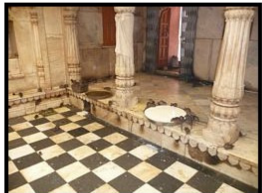
Rats running all over the place One of the weirder temples we've visited