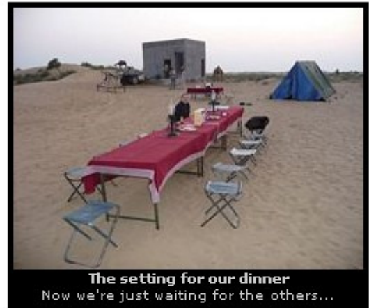
The setting for our dinner Now we're just waiting for the others...