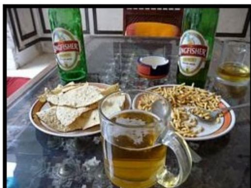
Our afternoon snack... Some beers, Papadums & Bjuja snacks