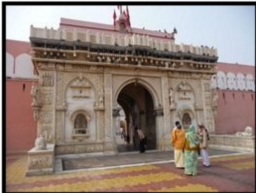
We're in Deshnok Visiting the rat temple