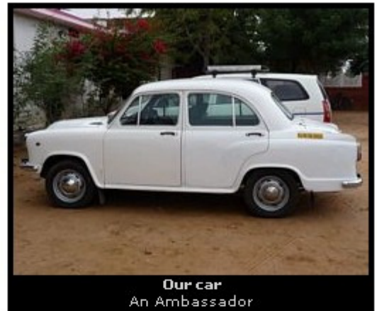
Dur car An Ambassador

Our car was a so called Ambassador which is a great car... Sure, it might not be as fast as the Indigo they were providing first but it's a lot more comfortable with plenty of leg space and an armrest.... plus it feels like you're sitting on a couch =)