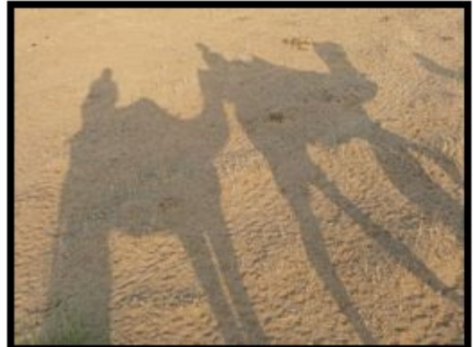
Our shadows reflecting in the sand