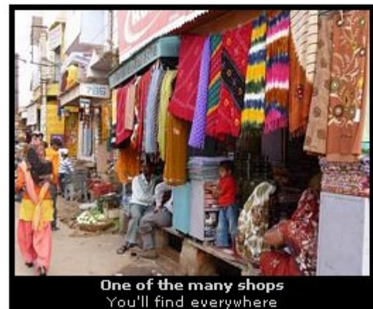
One of the many shops You'll find everywhere