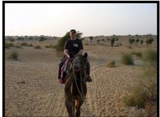
I really enjoyed my ride And wasn't too uncomfortable