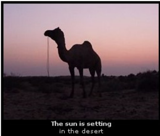
The sun is setting in the desert