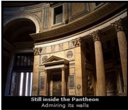
Still inside the Pantheon Admiring its walls