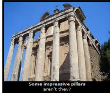
Some impressive pillars aren't they?