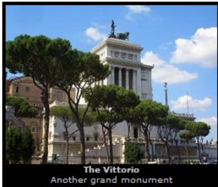
The Vittoriano Another grand monument