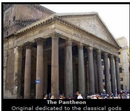
The Pantheon Original dedicated to the classical gods