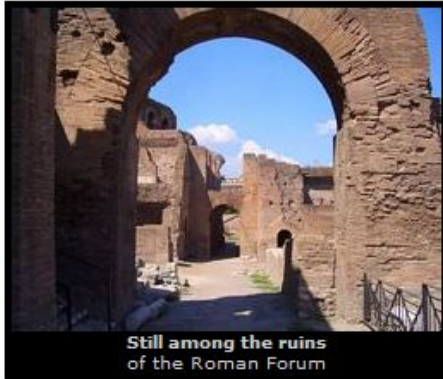
Still among the ruins of the Roman Forum