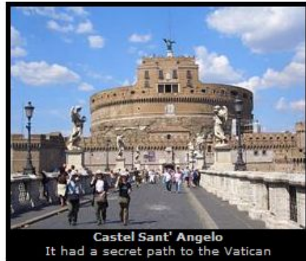
Castel Sant' Angelo It had a secret path to the Vatican