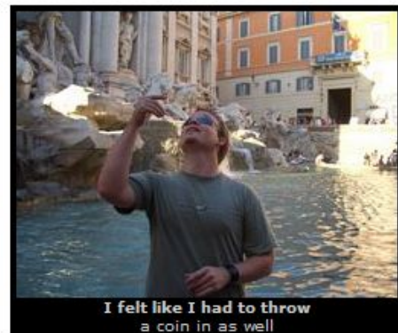
I felt like I had to throw a coin in as well

At the fountain it's tradition to toss a coin over your shoulder, tossing one coin will have you return to Italy, two coins will make you fall in love with an Italian and three coins will have you marry an Italian. Both Suz and I made sure we didn't toss more than one coin each (even when we came back we didn't toss any more coins, just in case).