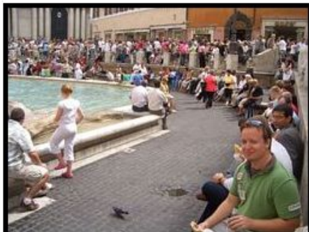
Having lunch at the Trevi Fountain.....again!