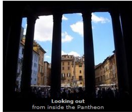
Looking out from inside the Pantheon