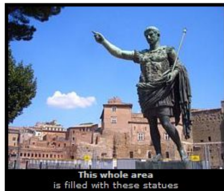
This whole area is filled with these statues