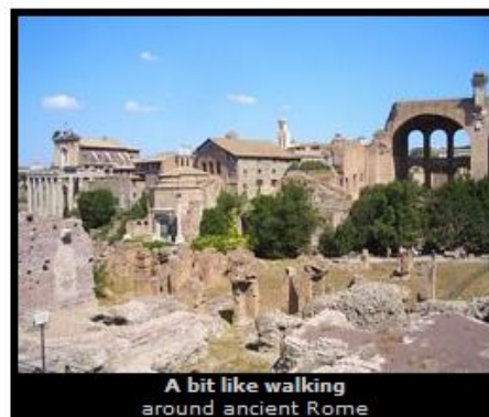
A bit like walking around ancient Rome