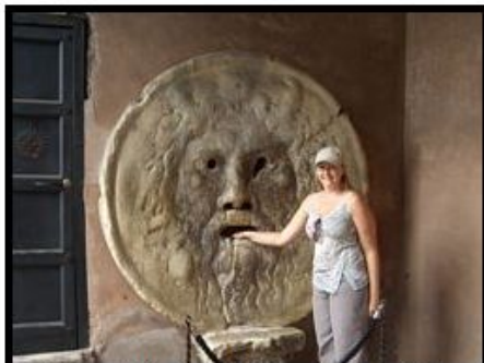
If you tell a lie while your hand is in its mouth, it will bite your hand off