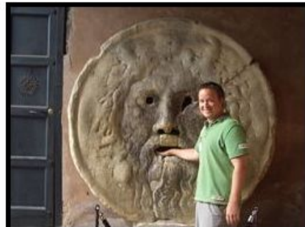
Bocca della Verita The Mouth of Truth