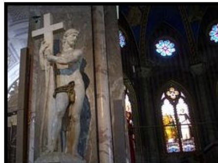
Another sculpture by Michelangelo "Christ bearing the Cross"