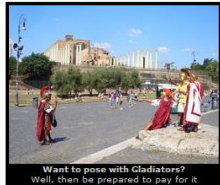
Want to pose with Gladiators? Well, then be prepared to pay for it

On our last full day of Rome we decided just to take it a bit easy and just strolled around the city. We re-visited a few locations that we had already seen and we saw some others that we hadn't. One of the funniest (and cheesiest) ones must be the "Bocca della Verita"