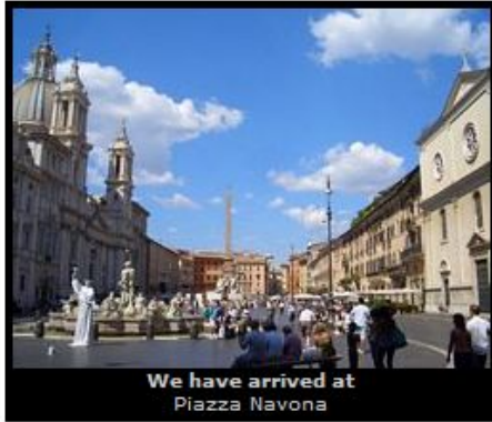
We have arrived at Piazza Navona