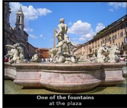
One of the fountains at the plaza