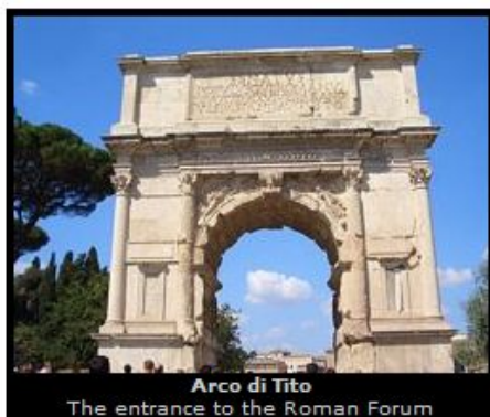
Arco di Tito The entrance to the Roman Forum

People say that Rome is a city you keep coming back to over and over again....well, we DID like the city and we might come back in the future, but for now we feel that we've experienced what it has to offer!