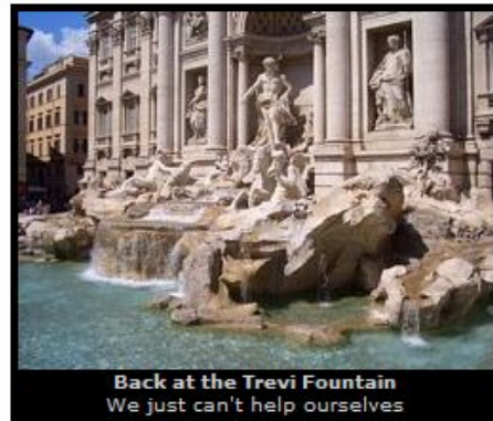
Back at the Trevi Fountain We just can't help ourselves