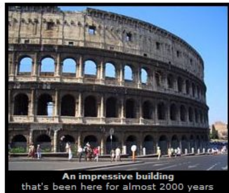
An impressive building that's been here for almost 2000 years

Suz decided to sample their flavours, the Pink Grapefruit, and she was sold, she had to have a cup! I had a Mango flavour and it was by far the best Gelato that we've had in Italy yet! Absolutely wonderful! Until now we've been a bit disapointed since we knew a place back in Sydney (Bar Italia) that served better gelato than most places we've found in Italy. But not this place!