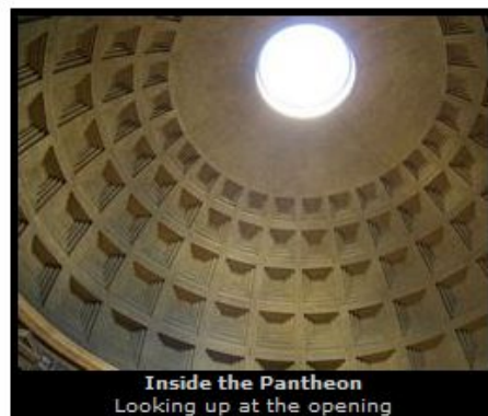
Inside the Pantheon Looking up at the opening