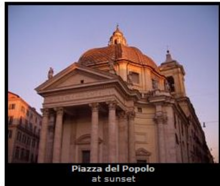
Piazza del Popolo at sunset

Walking through the Roman Forums gives you an incling of an idea of what it might have been like back then, of course it's all just ruins now, but with a lot of imagination you can almost see it in front of you.