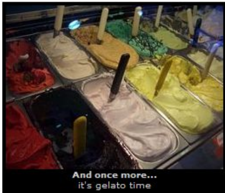
And once more... it's gelato time