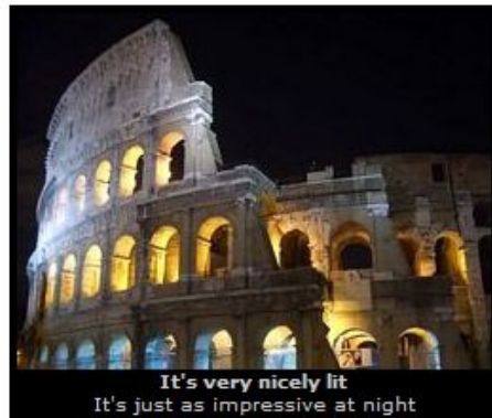
It's very nicely lit It's just as impressive at night