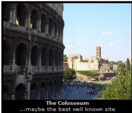
The Colosseum ...maybe the best well known site

We walked around the Forums up until that time that we figured that we had enough of it and then left via the Vittorio, walking past the Trevi Fountain and the Palazzo Montecitorio and eventually found ourselves staring up at the Pantheon, another of Rome's buildings that has been standing for more than 2000 years.