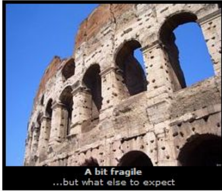
A bit fragile ...but what else to expect

It was actually so good that we went back the next day to the same place and tried the Pistachio flavour, and it was even better than we could have imagined, it was deliciously creamy and with a great flavour of Pistachio. The name of the place is "La Fonte della Salute" and it's located at Piazza Sant Eustachio if anyone would like to try them out.... we would recommend them to anyone!!