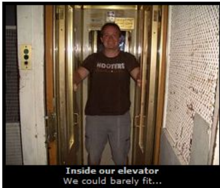
Inside our elevator We could barely fit...