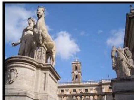
Looking out over Campidoglio