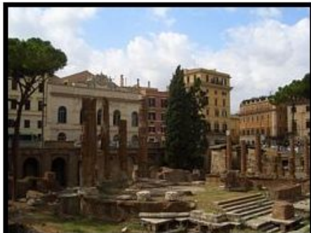
Area Sacra There are plenty of ruins all over Rome