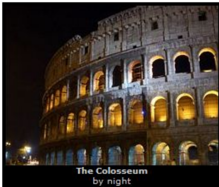
The Colosseum by night