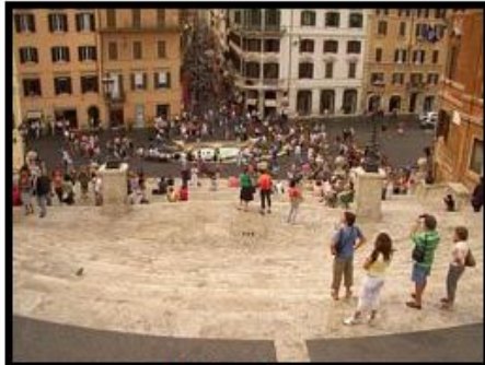
Looking down from the Spanish Steps