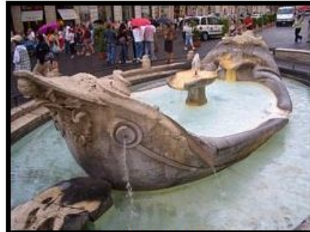
The boat fountain at the foot of the steps