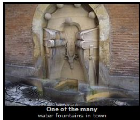
One of the many water fountains in town