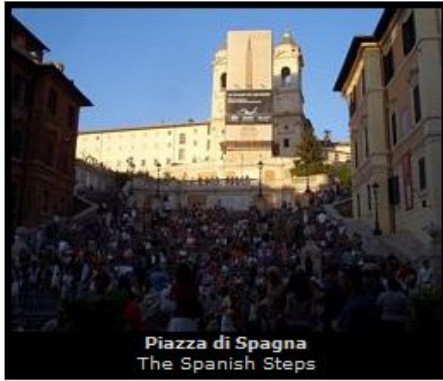
Piazza di Spagna The Spanish Steps

After spending a bit of time at the fountain we moved on towards Piazza Spagna and the Spanish Steps, another of Rome's famous sights.