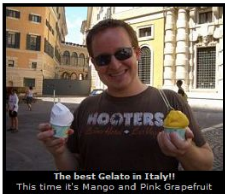
The best Gelato in Italy!! This time it's Mango and Pink Grapefruit