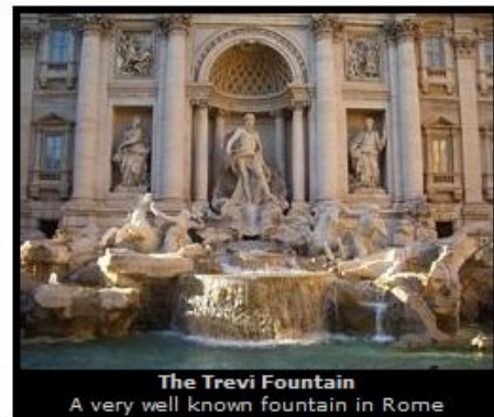
The Trevi Fountain A very well known fountain in Rome

We had booked accommodation at a place called "The Beehive", it's a hostel nicely located just two blocks away from the train station, great when you are lugging a backpack. The deal was that we were going to stay 1 night at the main house and then the remaining 3 nights at one of their apartments south of the Termini.