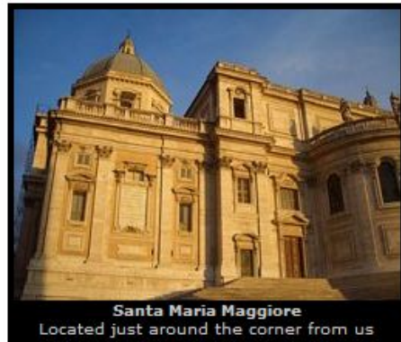
Santa Maria Maggiore Located just around the corner from us