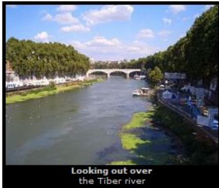
Looking out over the Tiber river