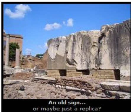
An old sign... or maybe just a replica?