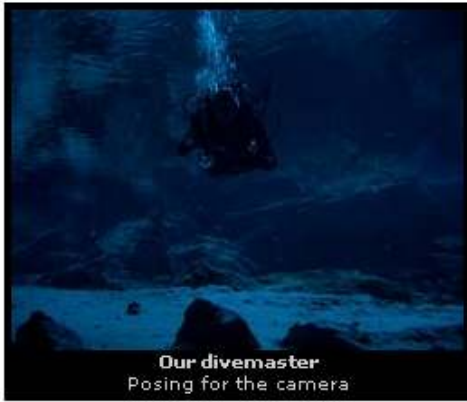
Our divemaster Posing for the camera