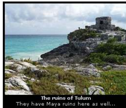
The ruins of Tulum They have Maya ruins here as well...