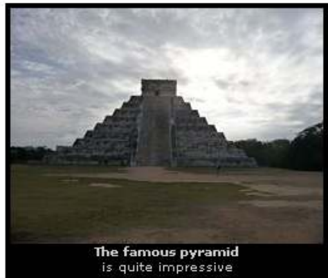
The famous pyramid is quite impressive