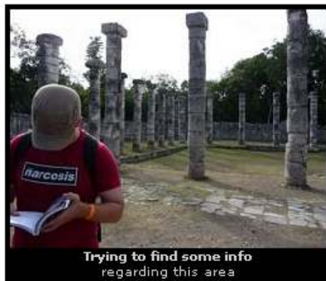
Trying to find some info regarding this area