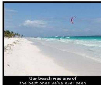
Our beach was one of the best ones we've ever seen

The next morning it was time for me to do some diving again... this time in a Cenote (an underwater cavern/cave dive). I had chosen to dive at one of the more famous cenotes in Tulum, the Dos Ojos Cenote.