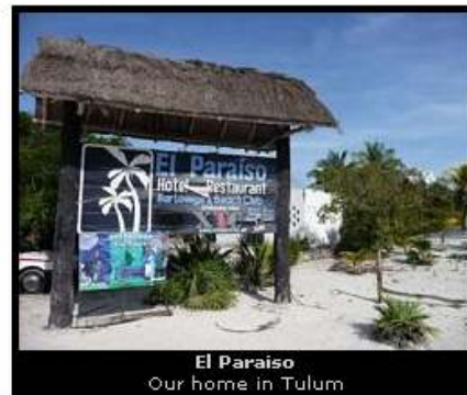
El Paraiso Our home in Tulum

The only drawback with living on the beach is that everyone else wants a piece of it. Since we were on the best beach in Tulum (with plenty of shade provided by the palm trees, plenty of sun chairs and a nice beach bar) there were bus loads of tourists arriving every day.