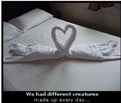
We had different creatures made up every day...

This of course brings the prices up quite a bit and after seeing the restaurant prices we made a mental note of heading into town every night for dinner ;)