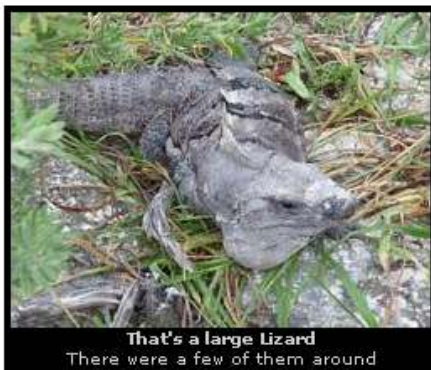
That's a large lizard There were a few of them around