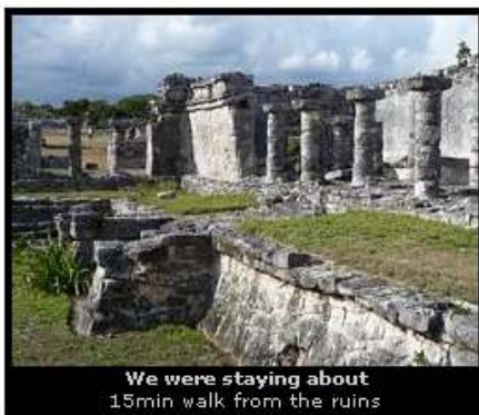
We were staying about 15min walk from the ruins