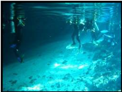
The Dos Ojos Cenote The visibility is awesome!