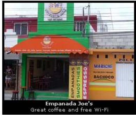
Empanada Joe's Great coffee and free Wi-Fi