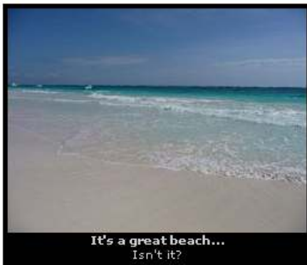
It's a great beach... Isn't it?