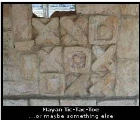
Mayan Tic-Tac-Toe ...or maybe something else