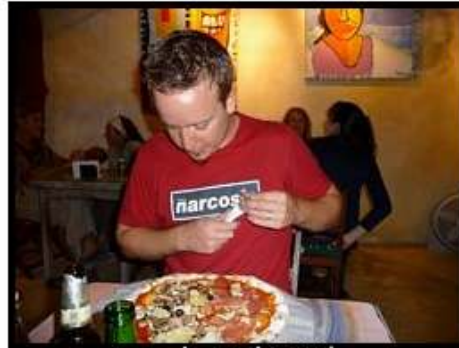
On our last night in Tulum we had some Italian food!