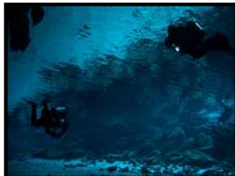
Still pretty awesome Isn't it?