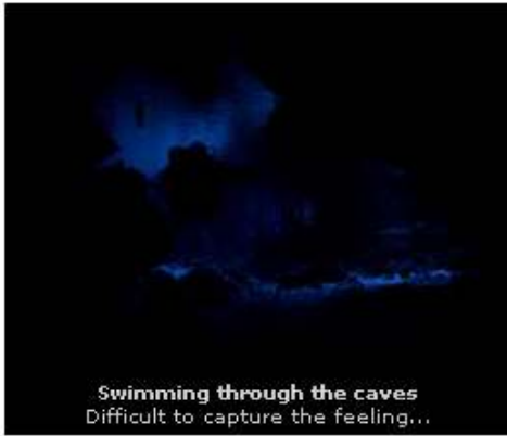
Swimming through the caves Difficult to capture the feeling...