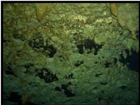
It's quite cool to see a few air bubbles here and there