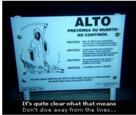
It's quite clear what that means Don't dive away from the lines...