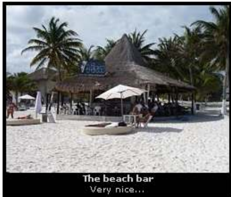
The beach bar Very nice...

Diving in a Cenote is completely different to diving in the ocean... Since I'm not a qualified cave diver I'm only allowed to dive in caverns, not caves. The main difference is that in a cavern you're never far from the surface (even though it might look and feel that way occasionally).