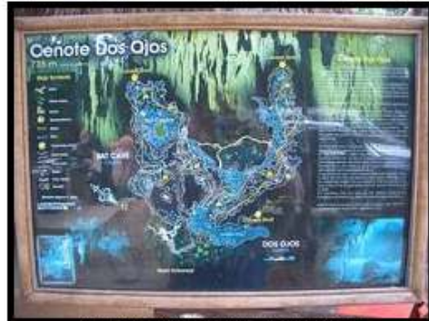
It's time for some more diving This time in a Cenote