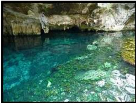
Looks inviting doesn't it? I need to try it out...