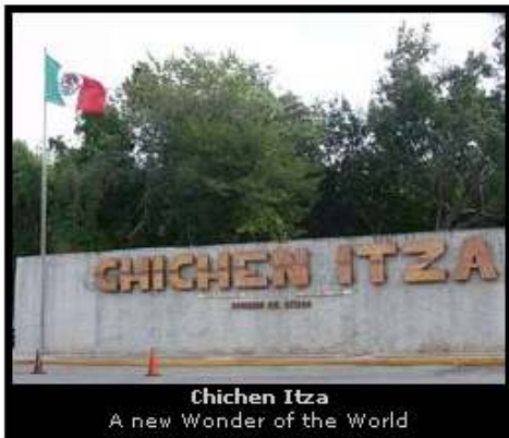
Chichen Itza A new Wonder of the World