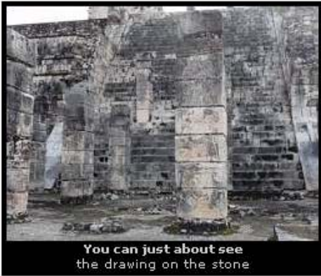
You can just about see the drawing on the stone