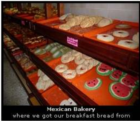
Mexican Bakery where we got our breakfast bread from