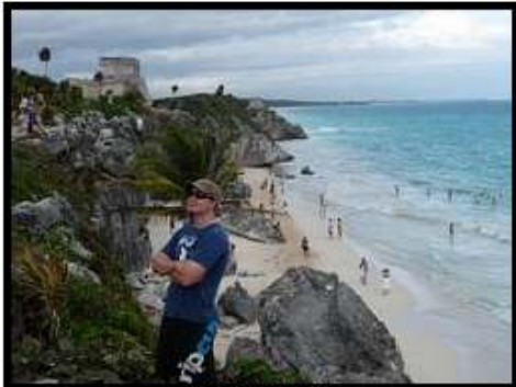
I had to pose for the same photo as well...