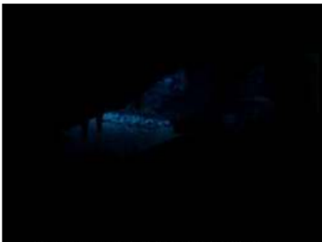
The day was cloudy and overcast... normally there is a stronger light