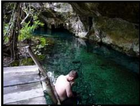
One of my contacts fell out I'm trying to get it back in...