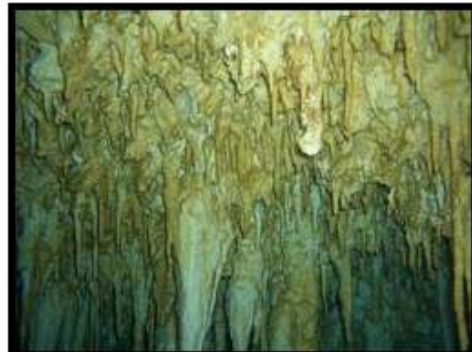
The dive contains some great stalactites (or are they stalacmites?)