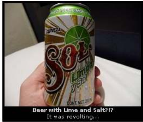
Beer with Lime and Salt?!? It was revolting...