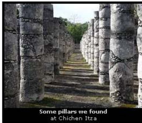
Some pillars we found at Chichen Itza