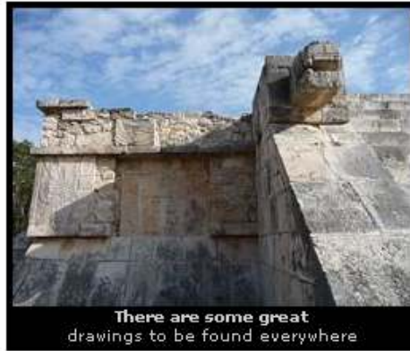
There are some great drawings to be found everywhere