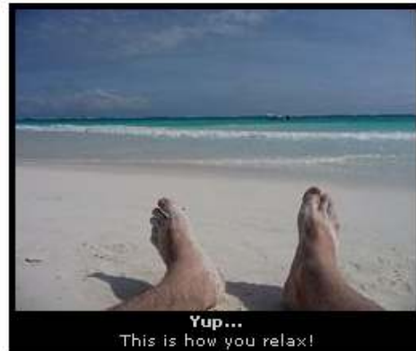
Yup... This is how you relax!

We were a bit apprehensive about renting a car in Mexico, we had read and heard a lot of stories about the corruption of the police and how you should just pay them 50-100 pesos if you're pulled over.