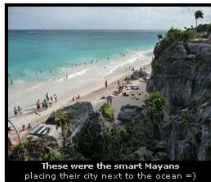
These were the smart Mayans placing their city next to the ocean =)