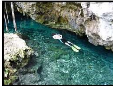
This time I just went snorkeling And it was great!