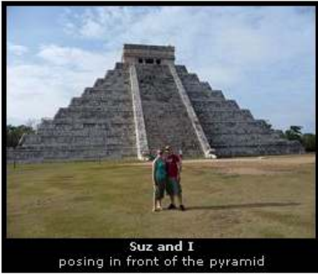
Suz and I posing in front of the pyramid