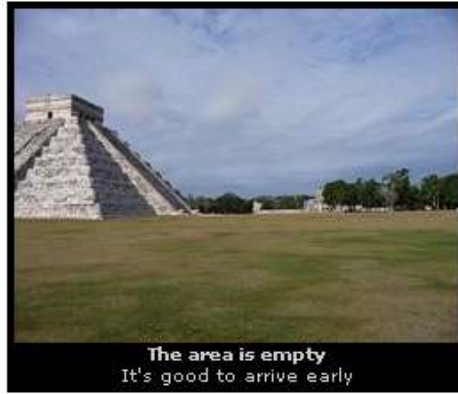
The area is empty It's good to arrive early