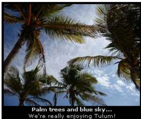
Palm trees and blue sky... We're really enjoying Tulum!

Also, if you don't have adequate insurance and hit another car, you might spend a night in a Mexican jail.... not something I was looking forward to trying out.