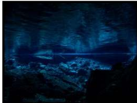
During the dive there are a few openings here and there