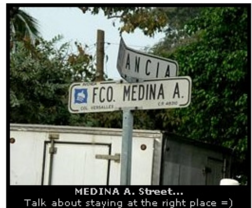
MEDINA A. Street... Talk about staying at the right place =>

Booked and done, we arrived at the airport and were immediately assaulted by the timeshare people.