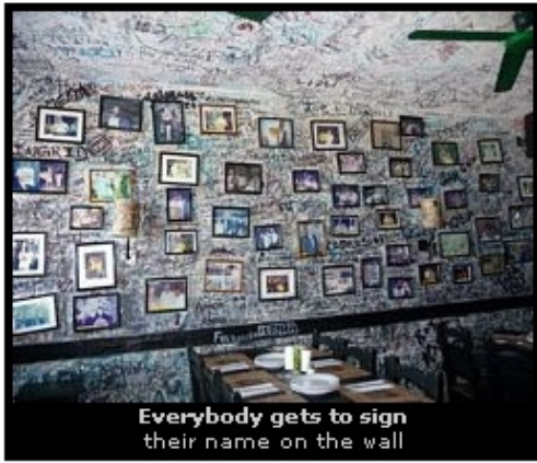
Everybody gets to sign their name on the wall