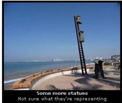
Some more statues Not sure what they're representing