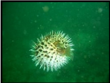
The pufferfish can barely swim away It's trying though =)