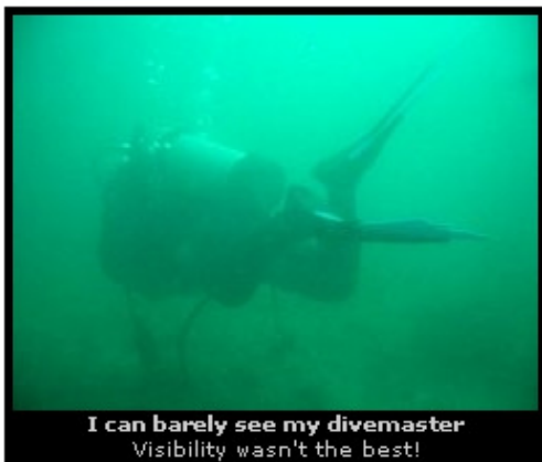
I can barely see my divemaster Visibility wasn't the best!