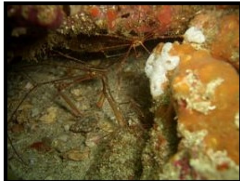
Spidercrabs They look quite freaky don't they?