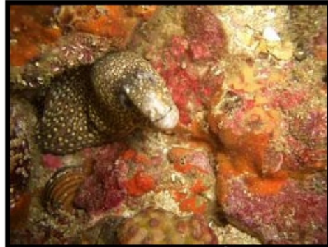
A tiny moray eel A curious one