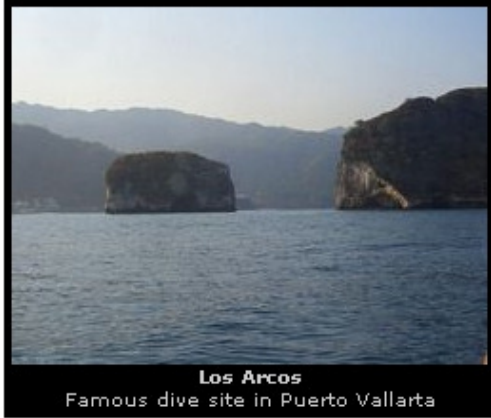
Los Arcos Famous dive site in Puerto Vallarta