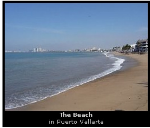
The Beach in Puerto Vallarta