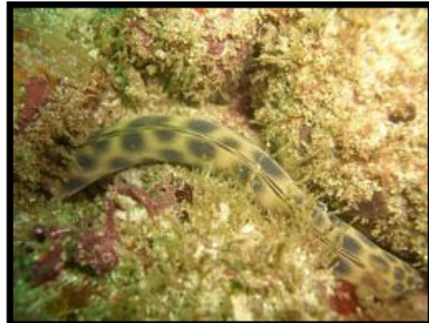
There were plenty of sea snakes around