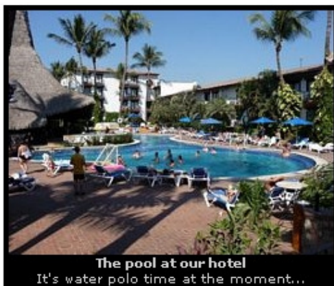
The pool at our hotel