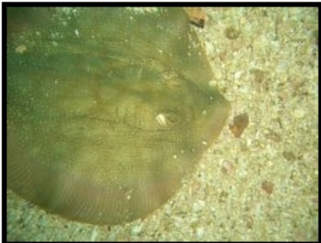
A stingray It left in a hurry after the photo