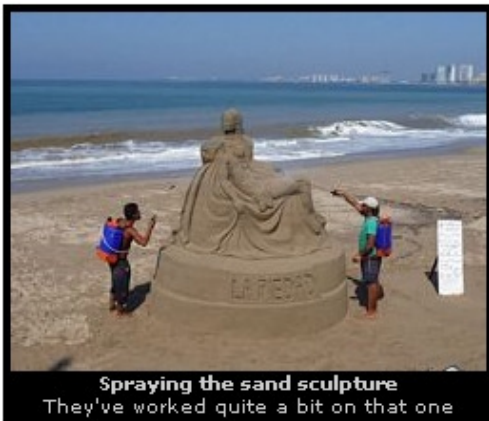
Spraying the sand sculpture They've worked quite a bit on that one