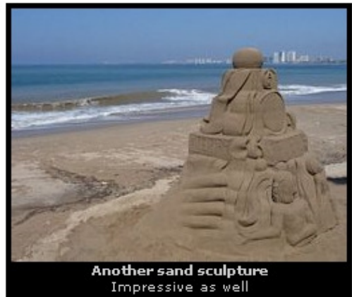
Another sand sculpture Impressive as well