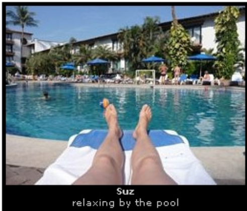
Suz relaxing by the pool