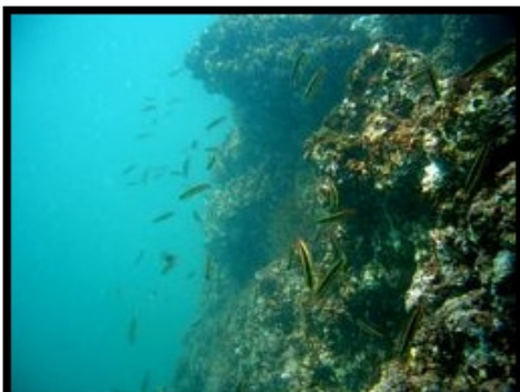
Visibility might be crap... but there is still lots to see!