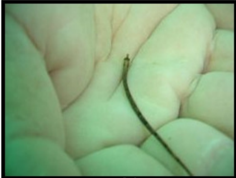
Pipefish We thought it was a string first...