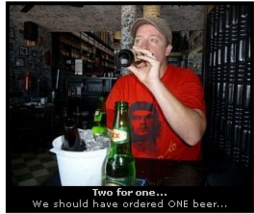
Two for one... We should have ordered ONE beer...