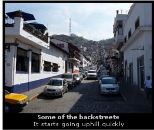
Some of the backstreets It starts going uphill quickly