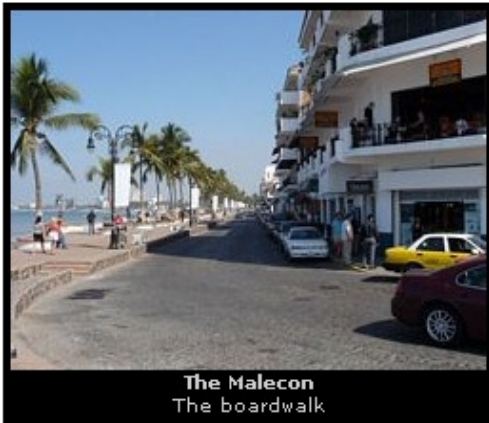
The Malecon The boardwalk