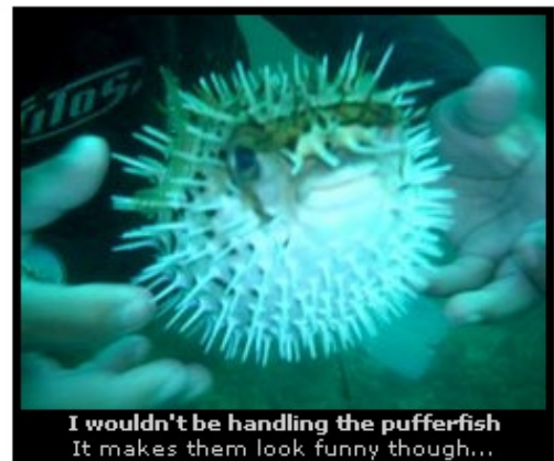
I wouldn't be handling the pufferfish It makes them look funny though...