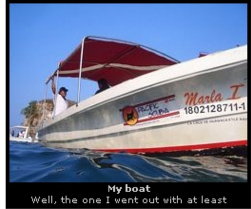
My boat Well, the one I went out with at least