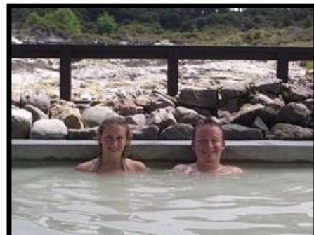
And then soaking away in the sulphur pool!