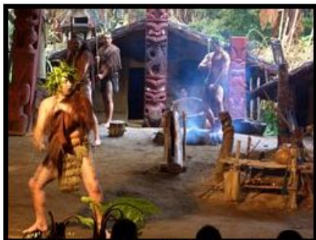
The ritual ceremony of encounter To determine if the visitor is friend or foe