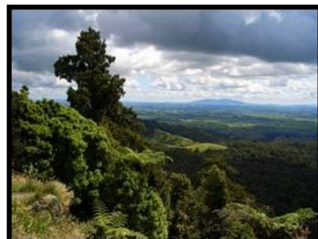
Not too bad is it? A beautiful view over the valley