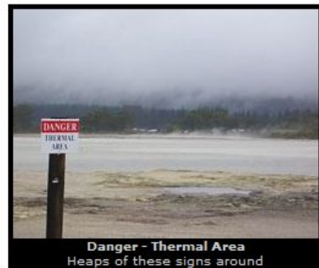
Danger - Thermal Area Heaps of these signs around

We had no problem finding our accommodation, checking in and leaving our luggage, we stayed at a hostel in the very centre of town, but we made sure we had an ensuite room for ourselves....we're just not dorm people anymore =))