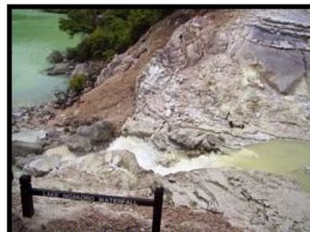
Lake Ngakoro Waterfall A nice waterfall