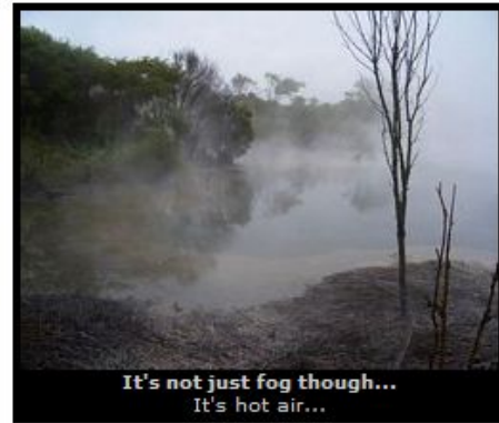
It's not just fog though... It's hot air...

Now that we'd explored the park and its thermal activities it was time for us to discover our first experience of some genuine Kiwi madness (which this country has lots of), Zorbing!!