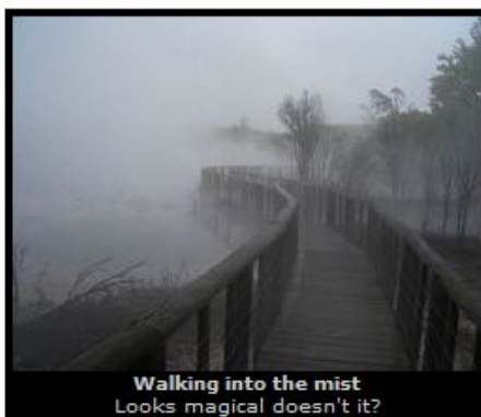
Walking into the mist Looks magical doesn't it?