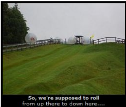
So, we're supposed to roll from up there to down here....