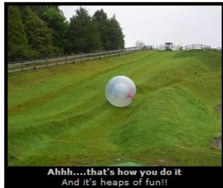
Ahhh....that's how you do it And it's heaps of fun!!