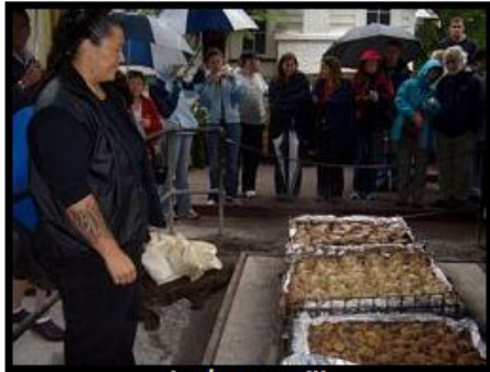
Looks yummi!! Chicken, Lamb, Kumara and Potatoes