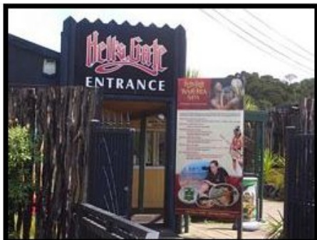
Tikitere... Also known as "Hells Gate"