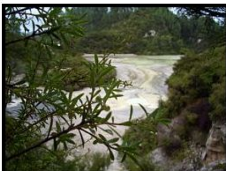
So many shades of green everywhere Trees, plants, water...