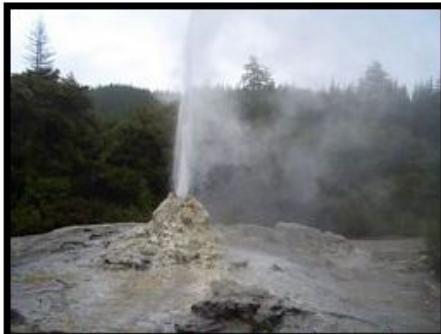
Quite powerful, even though it needs a "helping hand" to get started

Rotorua is an awesome area to visit, there is so much to see and so many things to keep you busy during your stay, there are still things we want to see and experience in the area, but we'll have to do that at a later time.