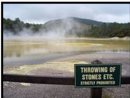
Not sure what would happen if someone would throw a stone in....