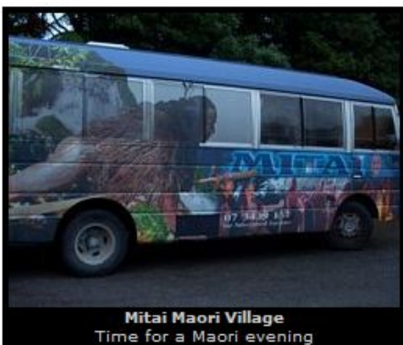
Mitai Maori Village Time for a Maori evening