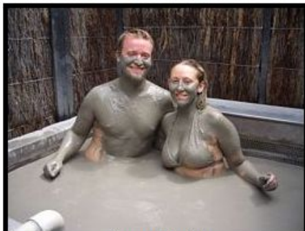
Our mud bath We're relaxing with some mud treatment