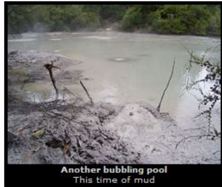
Another bubbling pool This time of mud