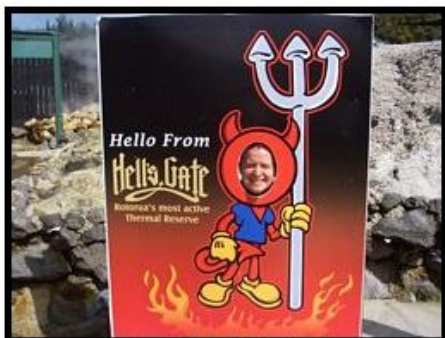
I'm being a little devil ...I'm still nice though!