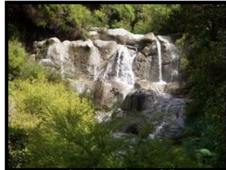
A hot thermal waterfall The largest in the southern hemisphere