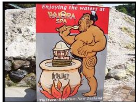
Suz in the cooking pot!