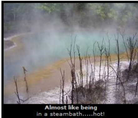
Almost like being in a steambath.....hot!

Zorbing is a very simple, yet genius concept. It works like this, you have a hill and a huge ball. You put the person in the ball, add some water and then roll the ball down the hill... It's great!!