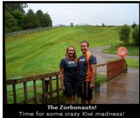
The Zorbonauts! Time for some crazy Kiwi madness!