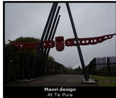
Maori design At Te Puia

Here we were given instructions on what the evening had in store for us, first we started off by having a look at our dinner for the evening, a "Hangi", a traditional Maori way of preparing the food which is cooked underground on hot rocks. Tonight we would be feasting on Chicken, Lamb, Potatoes and Kumara (sweet potatoes), it looked yummy, but it wasn't time to eat yet.