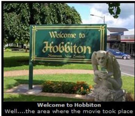
Welcome to Hobbiton Well....the area where the movie took place