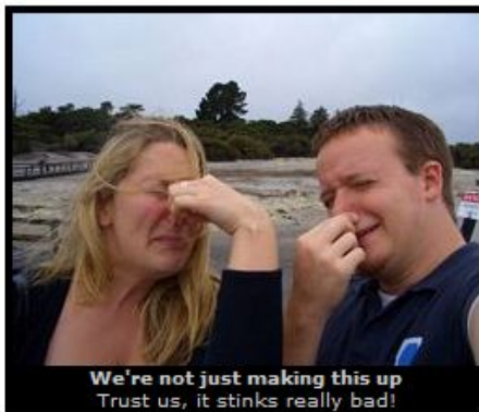
We're not just making this up Trust us, it stinks really bad!

That something else turned out to be Kuirau Park, a park filled with many hot springs with plenty of gas and steam coming from every direction. At least the smell wasn't bad here, we were just surrounded by steam. Which was very eerie and beautiful at the same time.