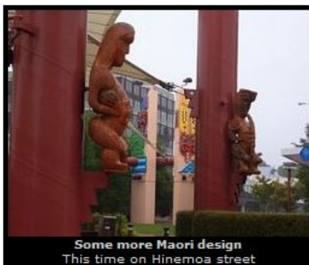
Some more Maori design This time on Hinemoa street

We were now taken down to the stream where we watched the Maori warriors arrive in the war canoe, we then followed them and got to see a show, starting off with a welcome ritual. This involves a warrior coming up to one of the visitors with hostile gestures and noises, he then lays down a fern leaf for the visitor to pick up. If it's picked up it means that the visitor comes in peace.