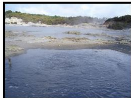
That water is bubbling I'd reckon it's pretty hot!