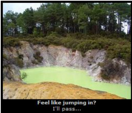
Feel like jumping in? I'll pass...