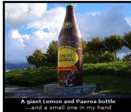
A giant Lemon and Paeroa bottle ...and a small one in my hand