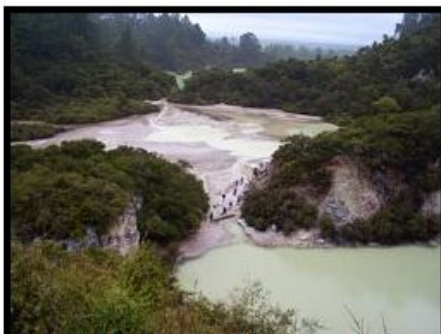
It's a beautiful landscape ...and so different!