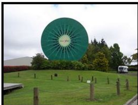
A giant Kiwi fruit We just had to stop and buy some