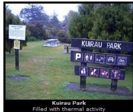
Kuirau Park Filled with thermal activity

It was actually quite entertaining to hear them watching the cricket and trying to make sense of it. One of them knew some basic rules and was trying to explain it to the rest. But after about 5min they dispersed to other areas of the bar....I guess it was all too confusing for them!