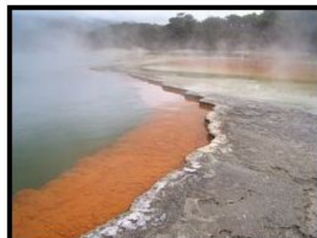
The "Champagne Pool" The highlight of the area!