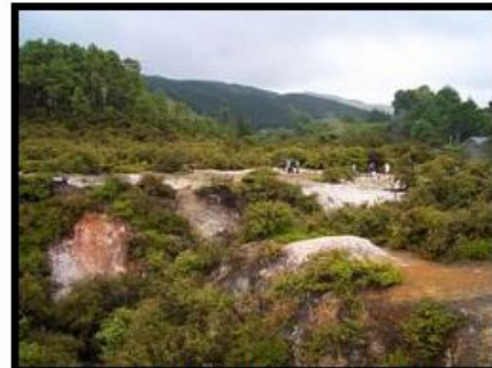
Waiotapu Thermal Wonderland All in all a walk of around 90min