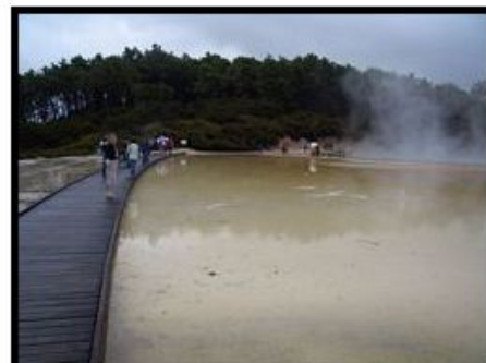
Make sure you stay on the designated pathway!