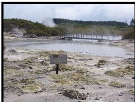
All these danger signs all over the place Maybe lots of people go wandering