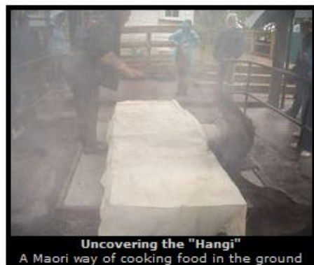
Uncovering the "Hangi" A Maori way of cooking food in the ground