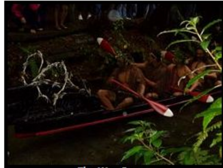
The War Canoe The arrival of the Maori warriors!