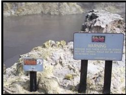
Make sure you don't litter ...you don't want to enter these pools