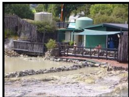
That's where we'll end up soon Let's just explore this area first