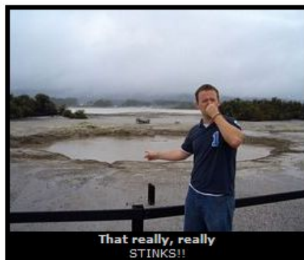
That really, really STINKS!!