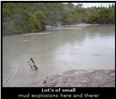
Lot's of small mud explosions here and there!