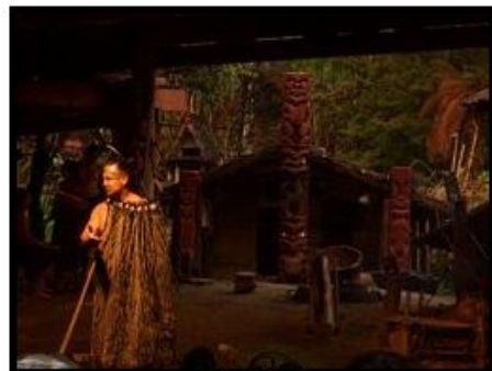
Maori Chief Explaining some of the Maori culture