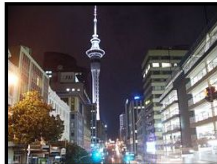
The view towards Skytower As seen from Albert Park