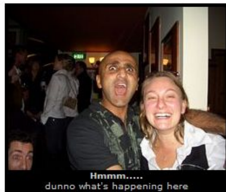
Hmmm..... dunno what's happening here