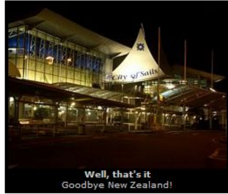
Well, that's it Goodbye New Zealand!