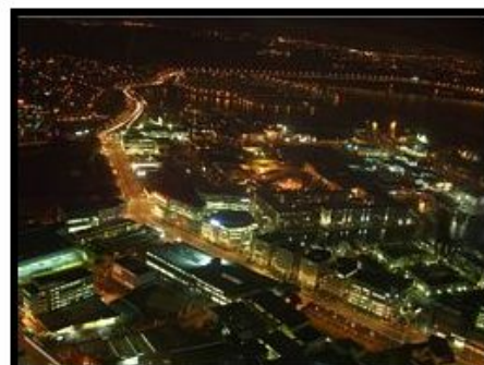
Towards Auckland Bridge ...and with my workbuilding down there