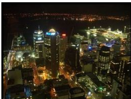
Looking out over the harbour From the Skytower