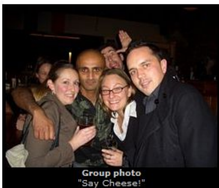
Group photo "Say Cheese!"