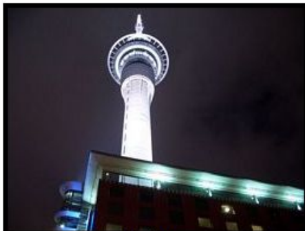
Skytower at night