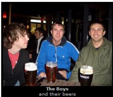
The Boys and their beers