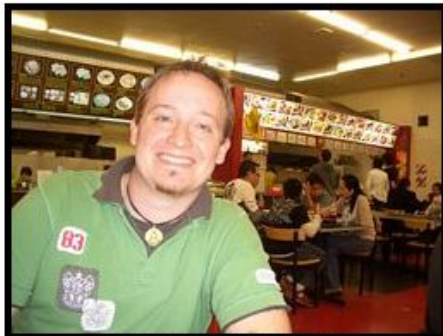
Our favorite Asian Food Hall And the Thai food here was brilliant!