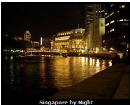
Singapore by Night