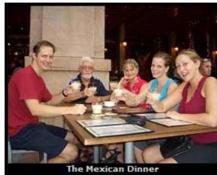
The Mexican Dinner