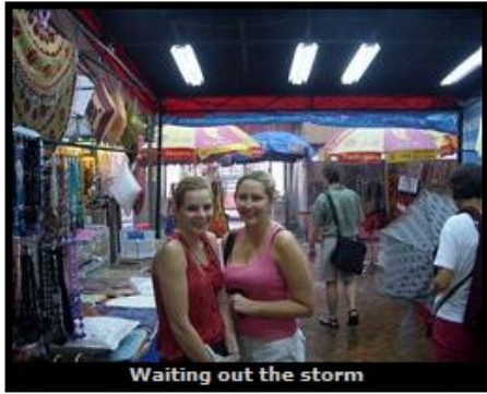
Waiting out the storm