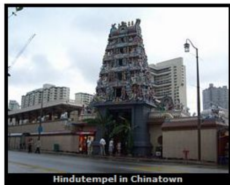
Hindutempel in Chinatown