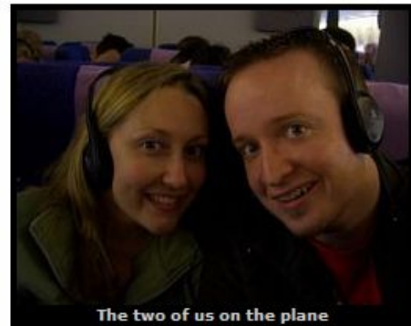
The two of us on the plane

This first leg of our trip we flew with Singapore Airlines and it was as good as we've heard. The flight was 7 and a bit hours but it felt way shorter than that. Both Suzie and I are used to travelling alone so the fact that we now had someone to spend the time with really made a difference (and of course the inflight entertainment also helped.....that is the movies on Demand, don't think of anything else ;))