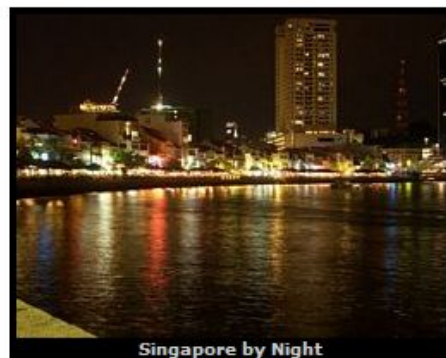
Singapore by Night