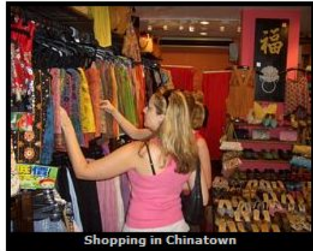
Shopping in Chinatown