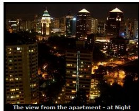
The view from the apartment - at Night

Our second day we started out by going down to the pool again, as soon as we woke up, better than a shower I tell you (even though all the chlorine means that we have to take a shower anyways....damn it).