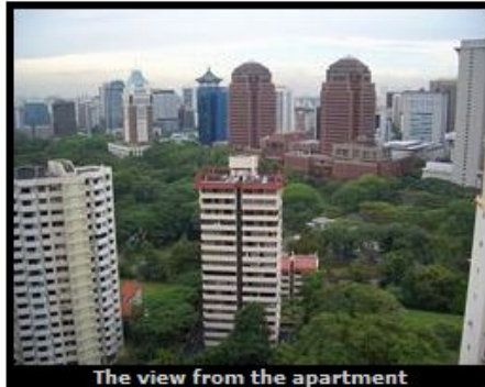
The view from the apartment

We landed at Changi airport, went through Immigration, picked up our luggage without a problem and were met by Suzie's friend Caitlyn.