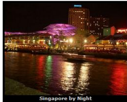
Singapore by Night