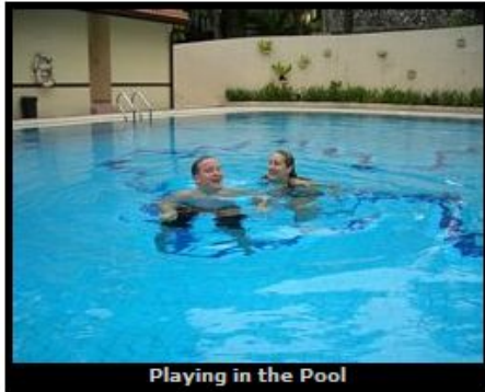
Playing in the Pool