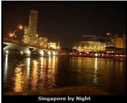
Singapore by Night