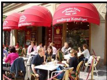
Same café as last time... ...but different company and warm weather!