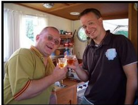
Cheers!! "99 bottle of Rum on the wall"