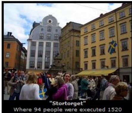
"Stortorget" Where 94 people were executed 1520

We met up with them and sat for a while having lunch and catching up....it was even warm enough for us all to get some delicious icecream after lunch, eating it whilst slowly walking through the streets of the old town.