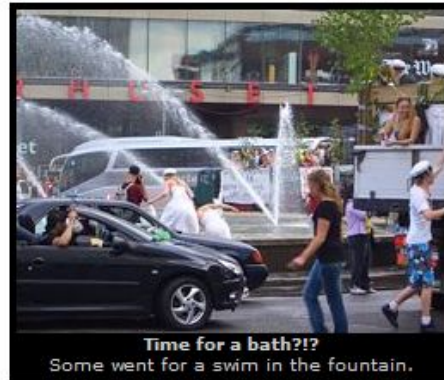
Time for a bath?!? Some went for a swim in the fountain.