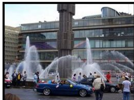
Celebrations! High School students and their graduation!