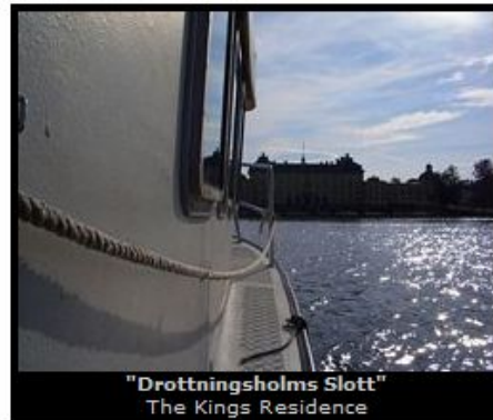
"Drottningholms Slott" The Kings Residence