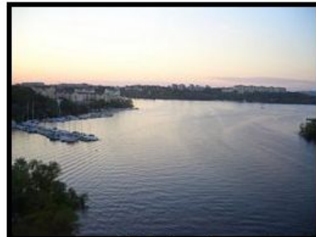
The boat yard ...photo taken from the train