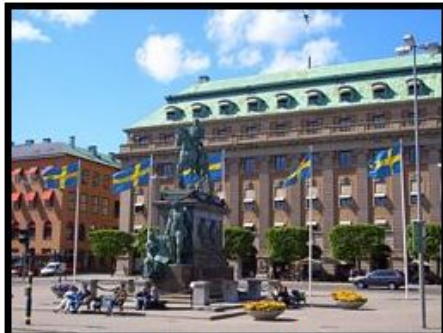
The flag is everywhere... the only day you will see the Swedish flag