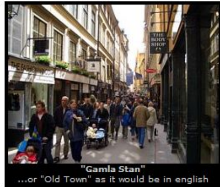
"Gamla Stan" ...or "Old Town" as it would be in english