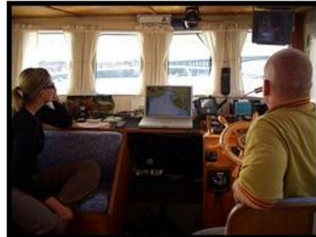
Following the GPS... ...to lead us back to the harbour.