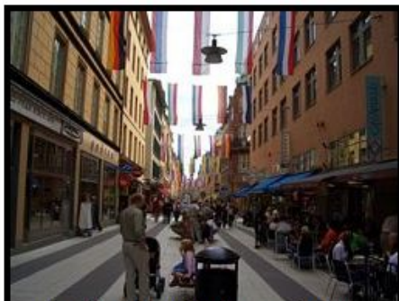
Looking down "The Queens Street" "Drottningsgatan" as it's known in Swedish!