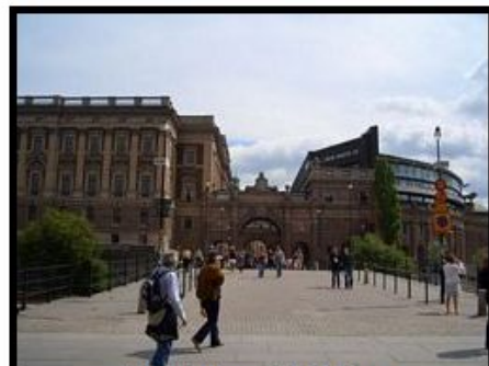
The Parliament Building A building with old and new architecture....