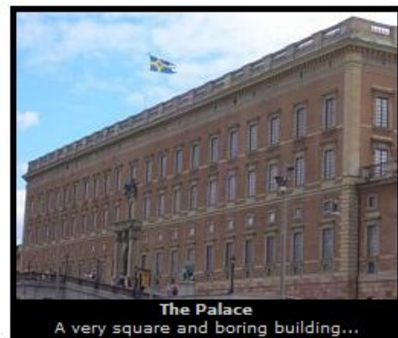
The Palace A very square and boring building...

Finding a café with some available seats wasn't easy to find. First of all, it's the national day which means lots and lots of people out on the streets. Second (and more important) was that it was freezing outside (around 16 degrees C)...Swedish summer indeed!!