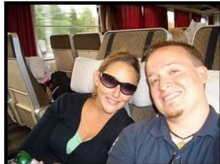
On the train... ...leaving a cold day in Stockholm!