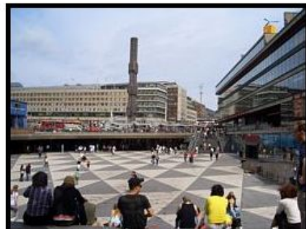
"Sergels Torg" THE main square in Stockholm