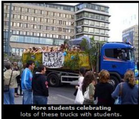
More students celebrating lots of these trucks with students.