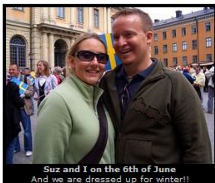
Suz and I on the 6th of June And we are dressed up for winter!!

The Uppsala edition of this blog will be coming shortly.....stay tuned.