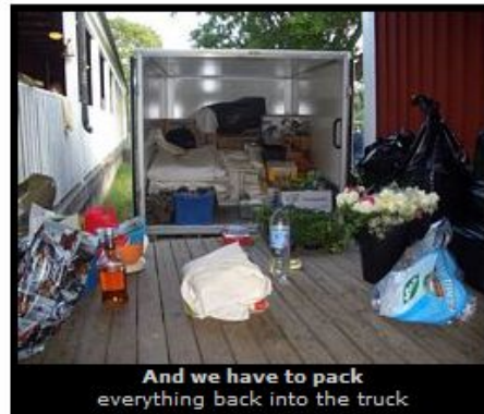
And we have to pack everything back into the truck