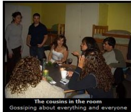
The cousins in the room Gossiping about everything and everyone