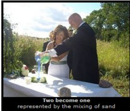
Two become one represented by the mixing of sand