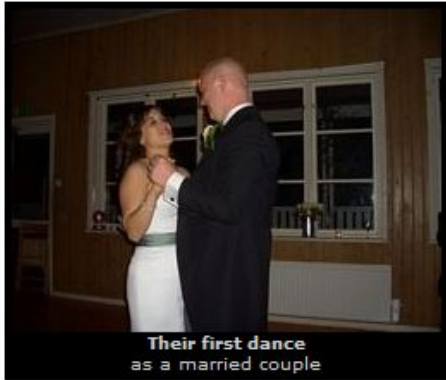
Their first dance as a married couple