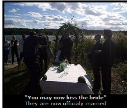
"You may now kiss the bride" They are now officially married