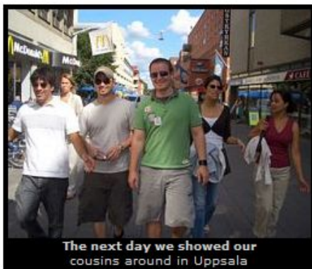
The next day we showed our cousins around in Uppsala