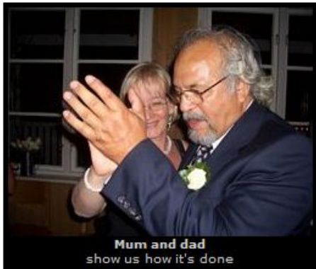
Mum and dad show us how it's done