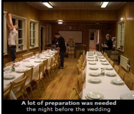
A lot of preparation was needed the night before the wedding

None of us guys were welcome... no problems, we stayed back in the apartment and had some whiskey while we got ready for the wedding.