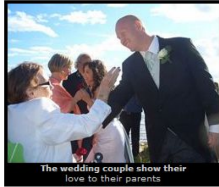
The wedding couple show their love to their parents