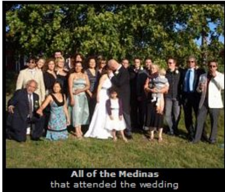
All of the Medinas that attended the wedding