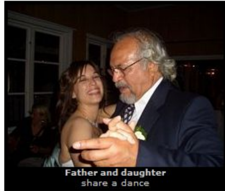
Father and daughter share a dance