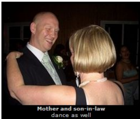
Mother and son-in-law dance as well