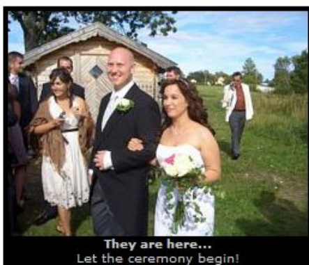
They are here... Let the ceremony begin!