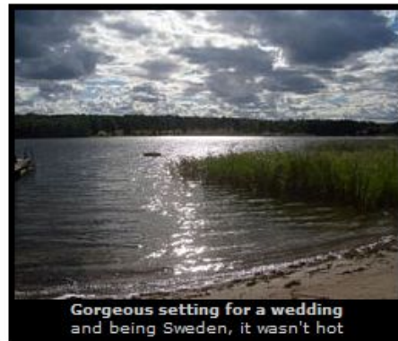
Gorgeous setting for a wedding and being Sweden, it wasn't hot