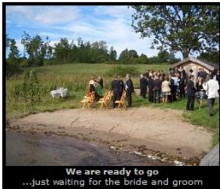
We are ready to go ...just waiting for the bride and groom

Well, these last few days have been hectic with loads of things to do and lots of people to see. But it's also been a lot of fun and I got to see my sister get married which I'm glad I got to do.