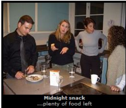
Midnight snack ...plenty of food left