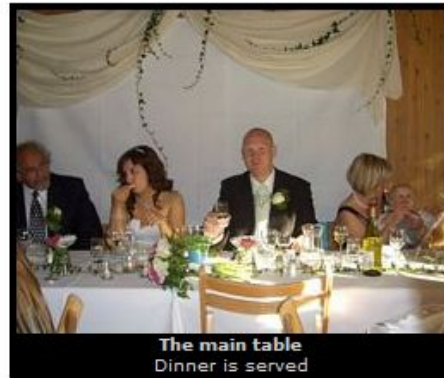
The main table Dinner is served