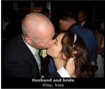
Husband and bride Kiss, kiss