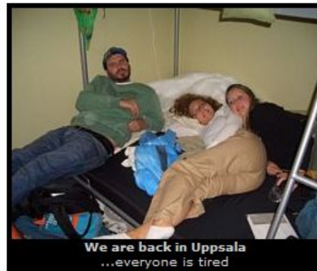
We are back in Uppsala ...everyone is tired