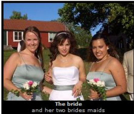
The bride and her two brides maids