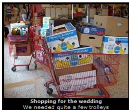
Shopping for the wedding We needed quite a few trolleys