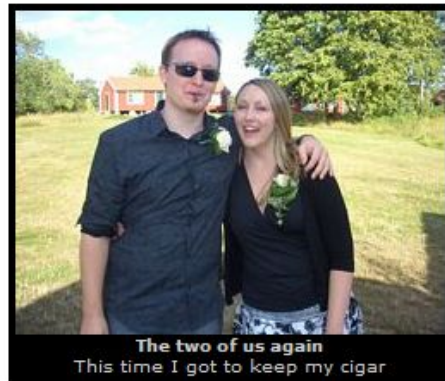
The two of us again This time I got to keep my cigar