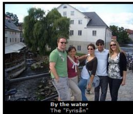
By the water The "Fyrisån"