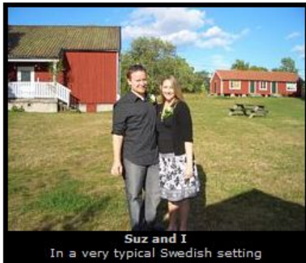
Suz and I In a very typical Swedish setting