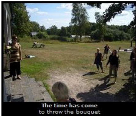
The time has come to throw the bouquet