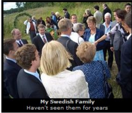
My Swedish Family Haven't seen them for years

We got up at midday, had some breakfast, chilled by the water, played some football and after lunch (which was around 4pm) we all helped to clean up and pack away in the van once more.