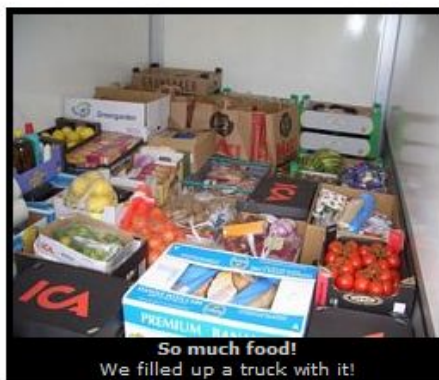
So much food! We filled up a truck with it!

The next morning all the girls got together with Zilia.