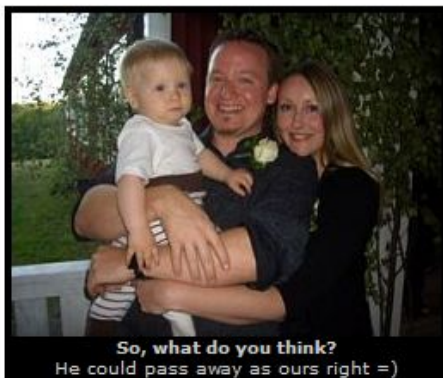
So, what do you think? He could pass away as ours right =)