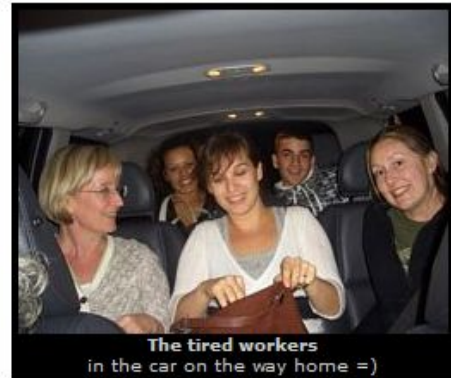
The tired workers in the car on the way home =)

One poem was read in Spanish another in Swedish and the ceremony was in English, very multinational. The ceremony was beautiful and finally they were pronounced man and wife, I now have a new brother.... well, brother-in-law.