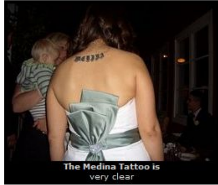
The Medina Tattoo is very clear