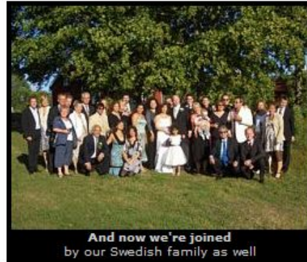
And now we're joined by our Swedish family as well