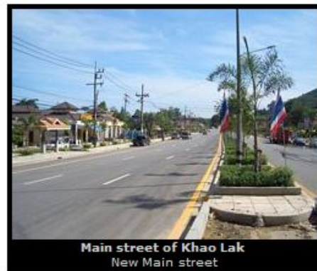
Main street of Khao Lak New Main street