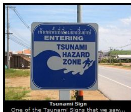
Tsunami Sign One of the Tsunami Signs that we saw...