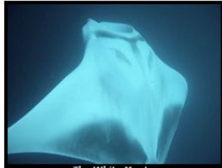
The White Manta The White Manta, something special to see!