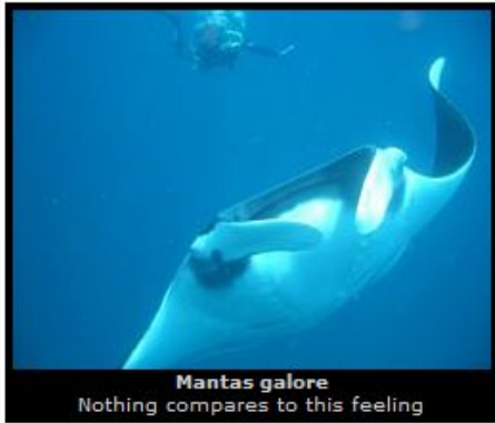
Mantas galore Nothing compares to this feeling