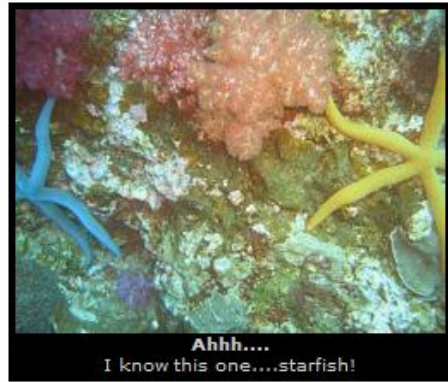
Ahhh.... I know this one....starfish!