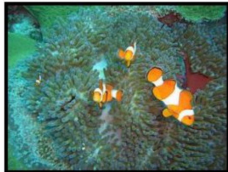
Nemo I found him!!!