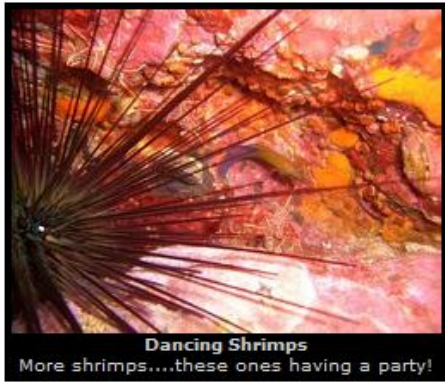
Dancing Shrimps More shrimps.....these ones having a party!