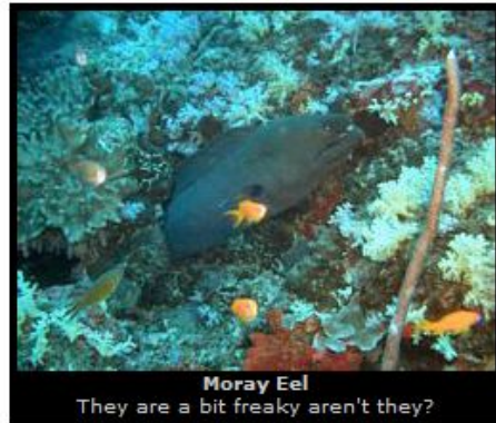
Moray Eel They are a bit freaky aren't they?