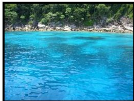
Koh Tachai Last dive at Koh Tachai