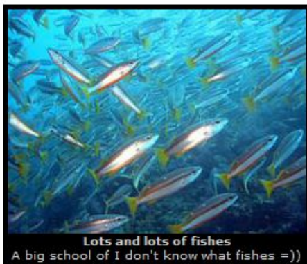
Lots and lots of fishes A big school of I don't know what fishes =))