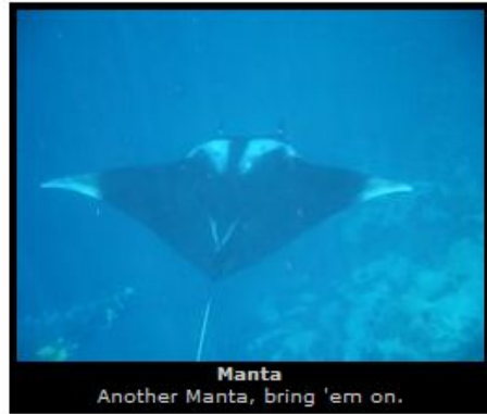
Manta Another Manta, bring 'em on.