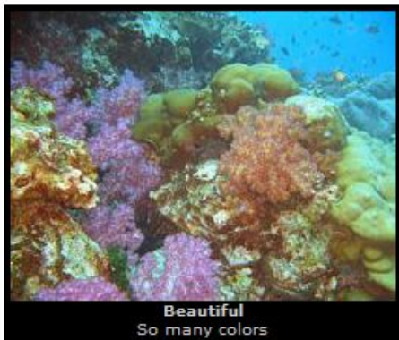
Beautiful So many colors