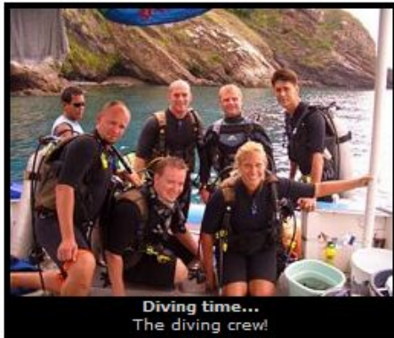
Diving time... The diving crew!