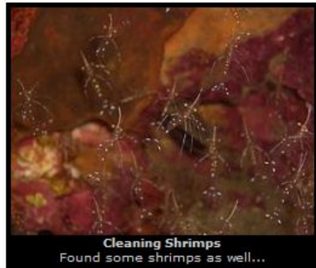
Cleaning Shrimps Found some shrimps as well...