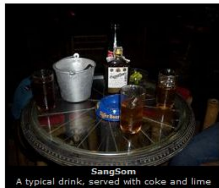
SangSom A typical drink, served with coke and lime