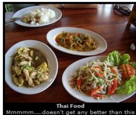
Thai Food Mmmm.....doesn't get any better than this