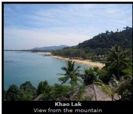
Khao Lak View from the mountain