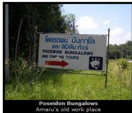
Poseidon Bungalows Amaru's old work place