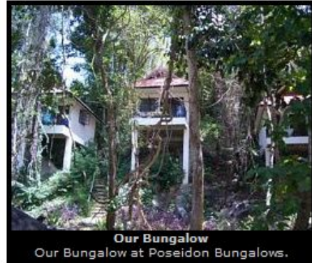
Our Bungalow Our Bungalow at Poseidon Bungalows.

There were some major changes, the biggest one being that the main road now has 4 lanes and that there is a sidewalk on the side instead of just sand. It looks much much better now with the lights that lined the street at night.