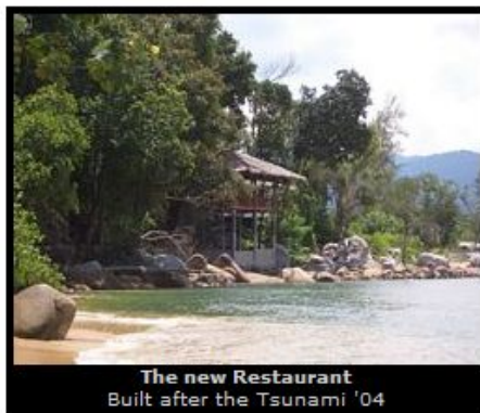
The new Restaurant Built after the Tsunami '04