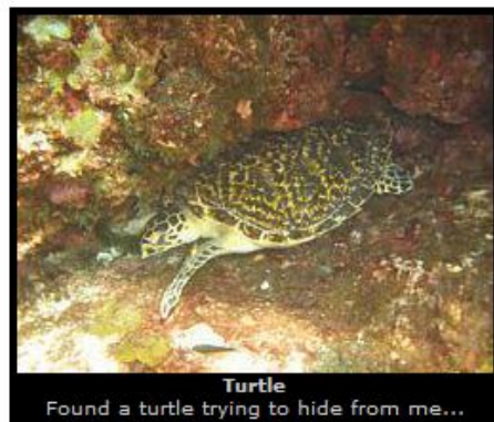
Turtle Found a turtle trying to hide from me...