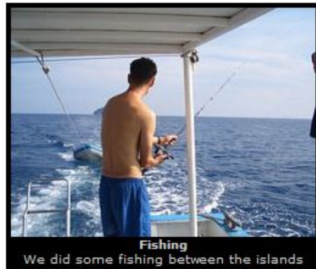
Fishing We did some fishing between the islands