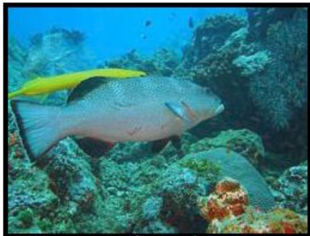
Hitching a ride The trumpetfish is a lazy one....