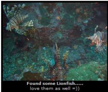
Found some Lionfish..... love them as well =))