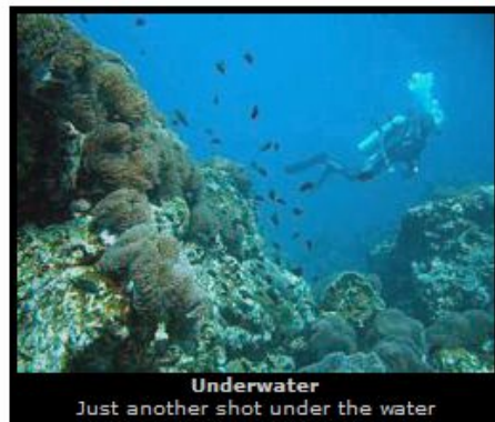
Underwater Just another shot under the water