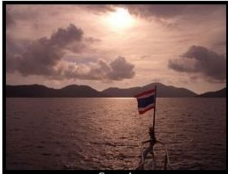
Sunset One of many beautiful sunsets in Thailand