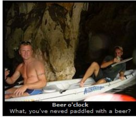
Beer o'clock What, you've never paddled with a beer?