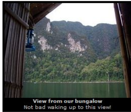
View from our bungalow Not bad waking up to this view!