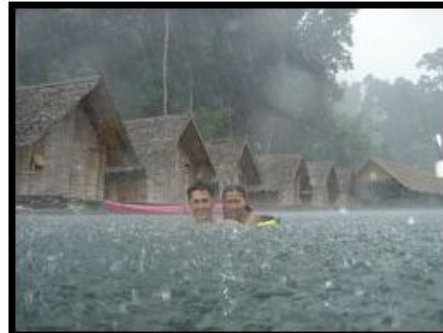
Rain, rain, rain Nice to be in the water during this downpour!