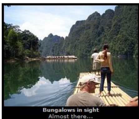
Bungalows in sight Almost there...