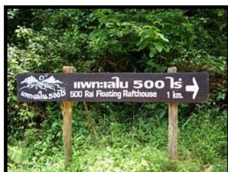
Only 1 km to the Bungalows 1km....we'll do that quickly....

While we were in the water we started to complain that we weren't as bouyant as in the saltwater...(duhhhh)...so we had to struggle to keep afloat. All of a sudden one of us had the great idea of using lifejackets to support us, we did put them on, but not like you might imagine. They worked very well and kept us afloat....the only drawback was that it looked like we had nappies on us.....ah well.