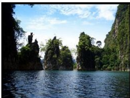
Limestone Cliffs Back to Civilization