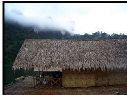
The clouds... ...lying low in the mountains.