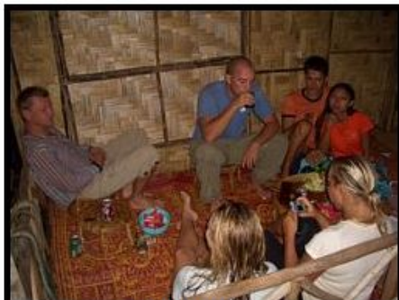
Under cover Escaping the rain and having some drinks...