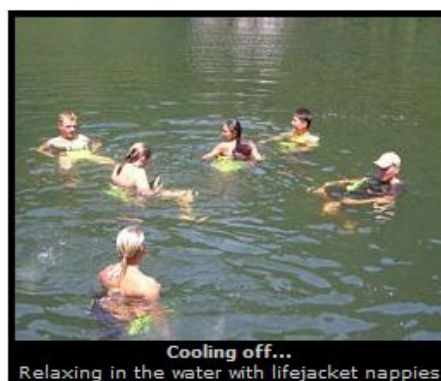
Cooling off... Relaxing in the water with lifejacket nappies