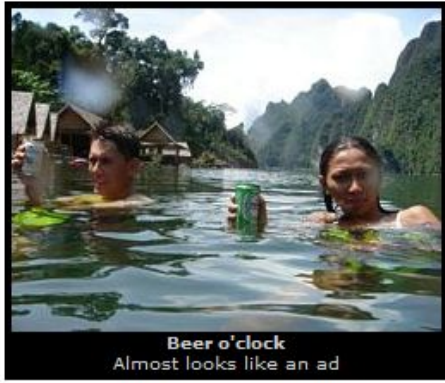
Beer o'clock Almost looks like an ad