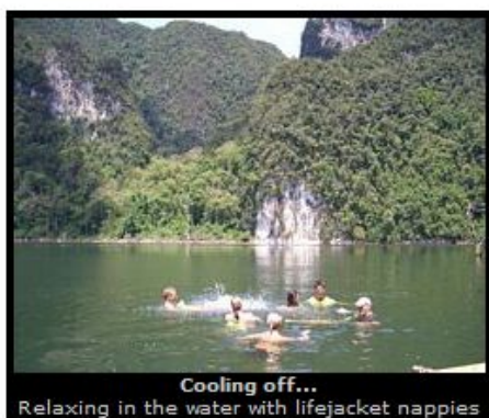
Cooling off... Relaxing in the water with lifejacket nappies