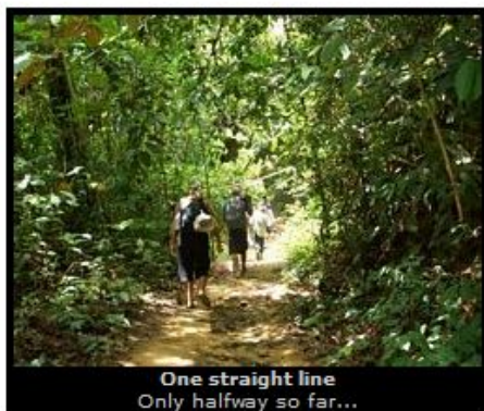
One straight line Only halfway so far...

The next day Suz was feeling better about the bungalows, the place and most of all the toilets so we had a more relaxed time. The others went on for a trekking in the jungle but Suz and I just stayed behind relaxing, reading and just taking it easy.