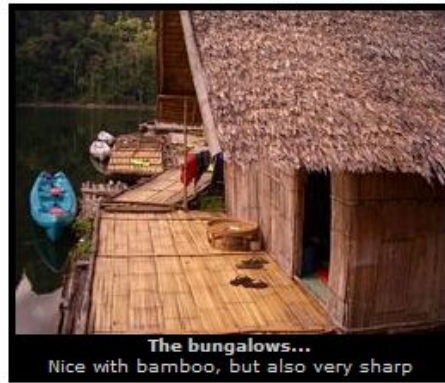
The bungalows... Nice with bamboo, but also very sharp