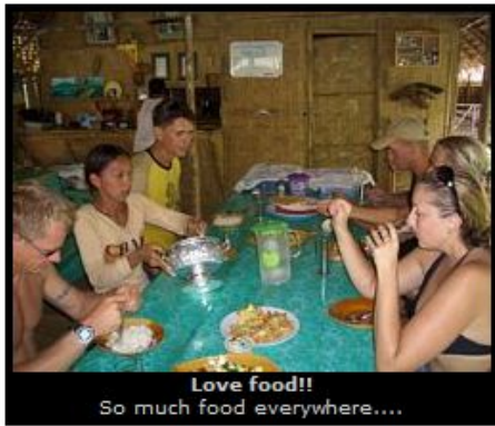
Love food!! So much food everywhere....