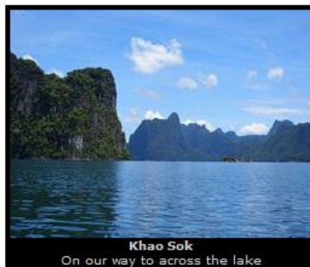
Khao Sok On our way to across the lake

We finally made it over, all of us drenched in our own sweat and here they told us that we had to get on another raft to continue.....you have got to be kidding me!?! Luckily it was only another 5 min and then we were there, at our bungalows.....the floating ones....on the lake. The first thing we did was to undress and get in the water to cool off.....good luck, the water was like a bath so it didn't really cool us off that much....anyways, it was better than the hike.