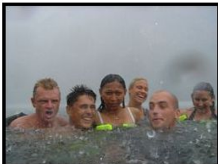
And then the rain... Let it rain, let it rain...