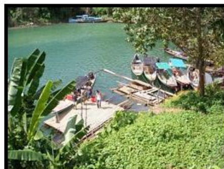
Finally there... Another 2½ to go before we are home...