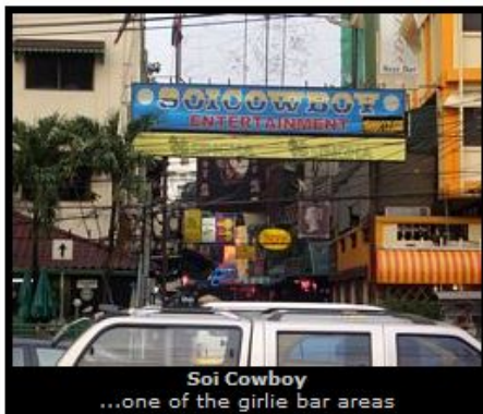
Soi Cowboy ...one of the girlie bar areas