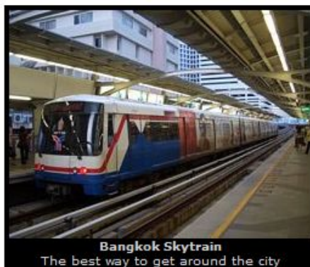
Bangkok Skytrain The best way to get around the city

Instead, we caught the escalators to the departure level, walked out and just flagged the first cab we saw. The only thing that you usually have to haggle about is for the cab driver to use the taxi meter and not quote you an outrageous price. We were lucky, he turned the meter on straight away and in the end we made it into the city for around 270 baht.