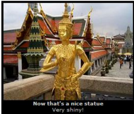
Now that's a nice statue Very shiny!