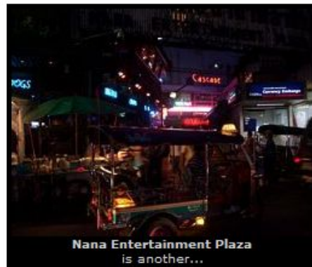
Nana Entertainment Plaza is another...