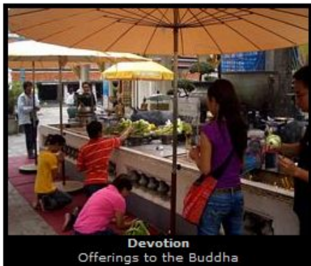
Devotion Offerings to the Buddha