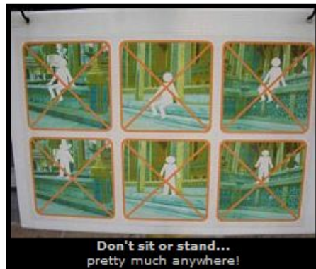
Don't sit or stand... pretty much anywhere!