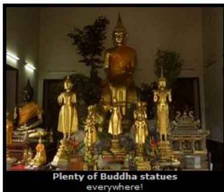
Plenty of Buddha statues everywhere!