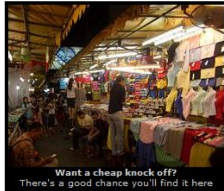
Want a cheap knock off? There's a good chance you'll find it here