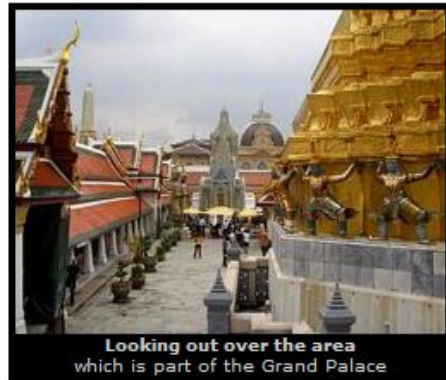
Looking out over the area which is part of the Grand Palace