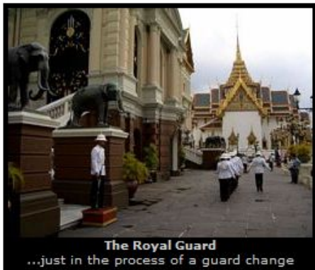
The Royal Guard ...just in the process of a guard change