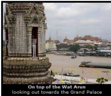
On top of the Wat Arun looking out towards the Grand Palace

That evening we had a good simple dinner from a street stall, the best way to enjoy the foods Bangkok has to offer... and the fact that it's really cheap doesn't hurt either =)