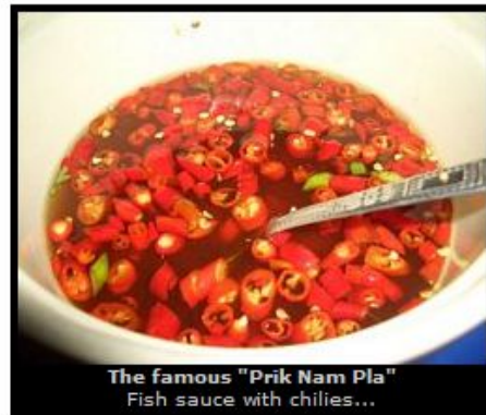
The famous "Prik Nam Pla" Fish sauce with chilies...