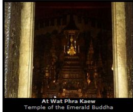
At Wat Phra Kaew Temple of the Emerald Buddha