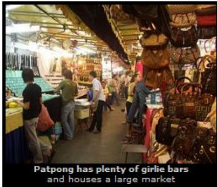
Patpong has plenty of girlie bars and houses a large market