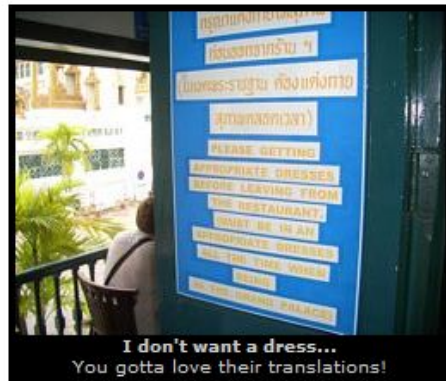
I don't want a dress... You gotta love their translations!