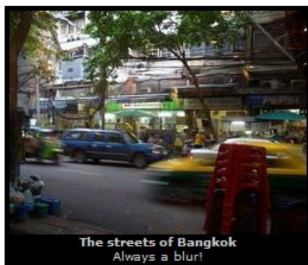
The streets of Bangkok Always a blur!

Unfortunately, it was all a big disappointment... First of all, there are no individual tv screens, which I can get over that fact - if they have some good entertainment on the big screen.