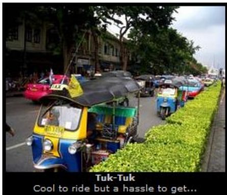
Tuk-Tuk Cool to ride but a hassle to get...