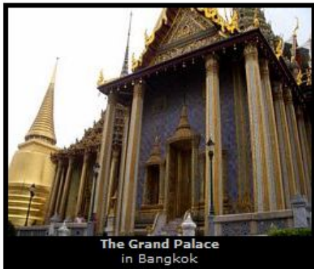
The Grand Palace in Bangkok