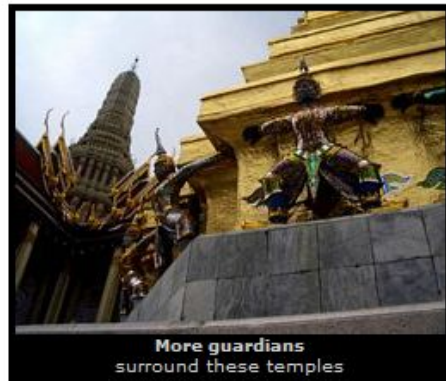
More guardians surround these temples