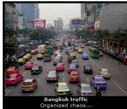
Bangkok traffic Organized chaos...