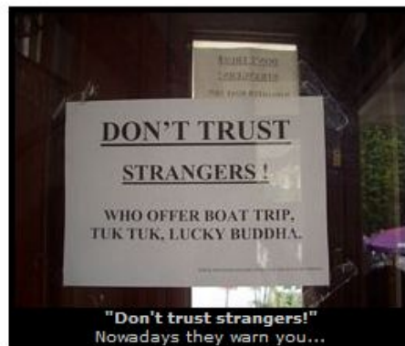
"Don't trust strangers!" Nowadays they warn you...