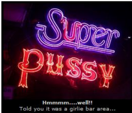
Hmmm...well!! Told you it was a girlie bar area...