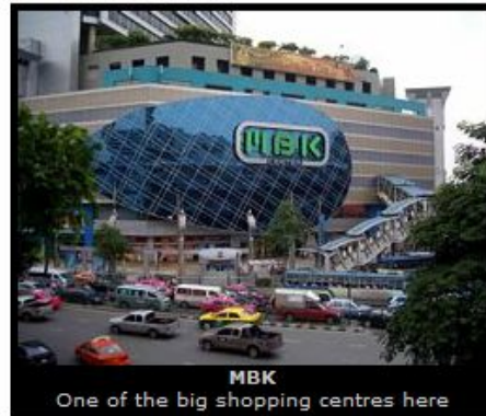
MBK One of the big shopping centres here