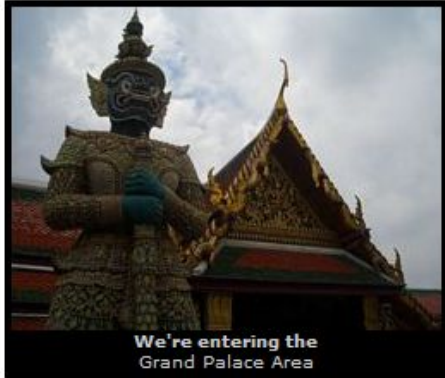
We're entering the Grand Palace Area