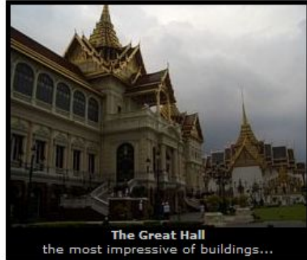
The Great Hall the most impressive of buildings...