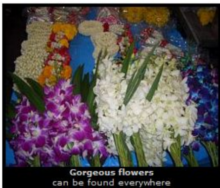
Gorgeous flowers can be found everywhere