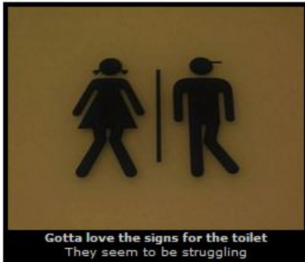
Gotta love the signs for the toilet They seem to be struggling