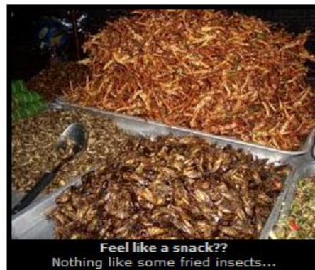
Feel like a snack?? Nothing like some fried insects...