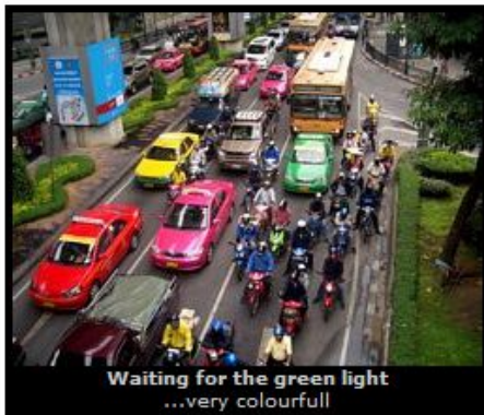
Waiting for the green light ...very colourfull