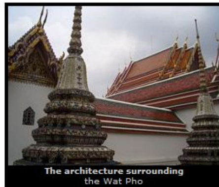
The architecture surrounding the Wat Pho