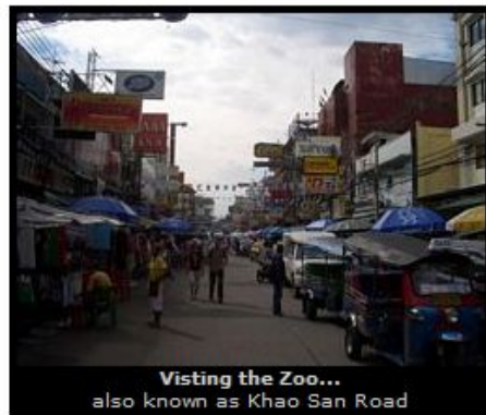
Visiting the Zoo... also known as Khao San Road