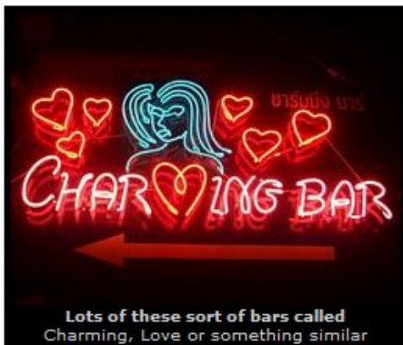
Lots of these sort of bars called Charming, Love or something similar