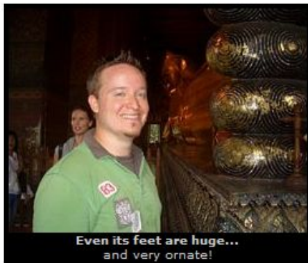
Even its feet are huge... and very ornate!