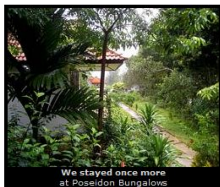
We stayed once more at Poseidon Bungalows