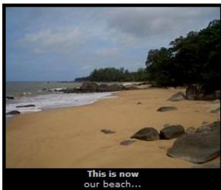
This is now our beach...