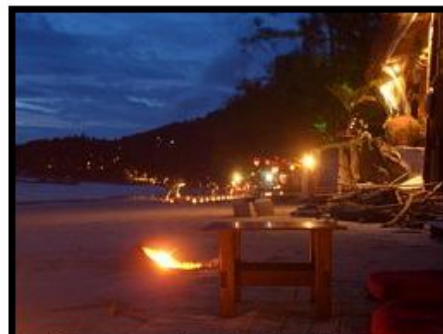
It's gorgeous to walk along the beach after sunset!