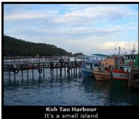
Koh Tao Harbour It's a small island