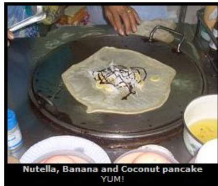
Nutella, Banana and Coconut pancake YUM!