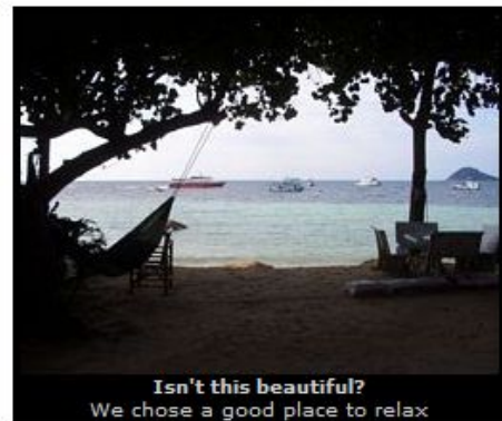
Isn't this beautiful? We chose a good place to relax

Afterwards the bar girl asked if we wanted to keep the candles, it turned out that she loved them, we were glad to give them away to her to use on some other occasion!