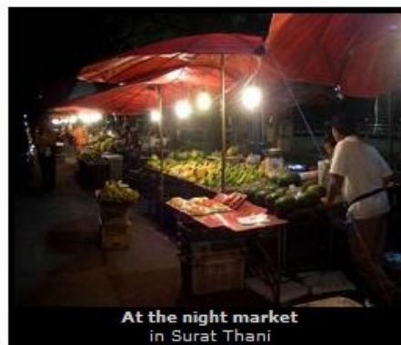
At the night market in Surat Thani

I could see the bus, it had stopped at a red light about 150-200m further up the street, I could also see the countdown to the green light and realized that I had around 70 seconds to get to the bus.