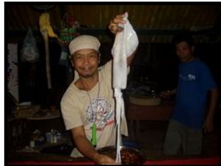
That's a HUGE squid I'm having that for my B-Day dinner