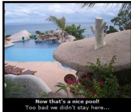
Now that's a nice pool! Too bad we didn't stay here...