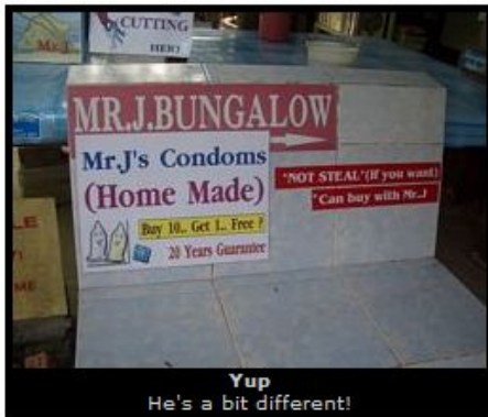
Yup He's a bit different!

Our treatment then started with an hour of Thai Massage which was followed by a full facial treatment. We felt very relaxed after the massage and now during the facial we were lying on our backs, eyes covered with some cotton buds and then an array of creams on our face.