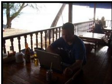
This is a good place to work on the blog!