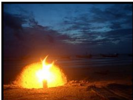
The torches are turned on after sunset