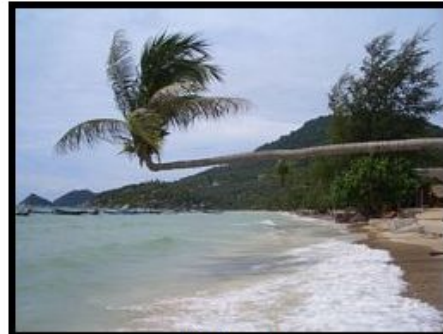
The Beach in Koh Tao