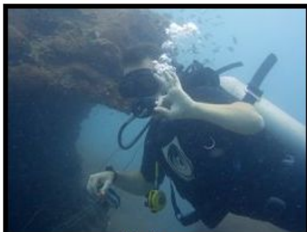
That's me All is good!