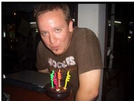
I'm turning 30 Recognize the candles?