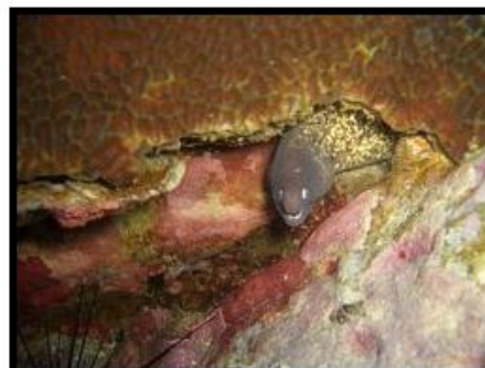
A tiny Moray Eel Very cute isn't it?