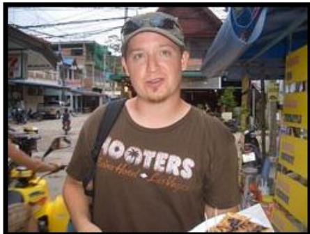
I like these pancake stands Quick and Yummy!