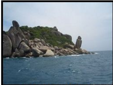
Now what does that look like? You've got a dirty, dirty mind!