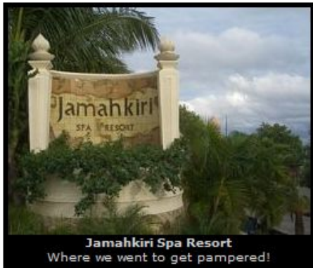
Jamahkiri Spa Resort Where we went to get pampered!