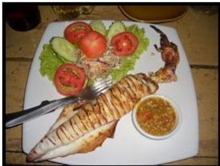
This is what it looked like later... And it tasted amazing!!