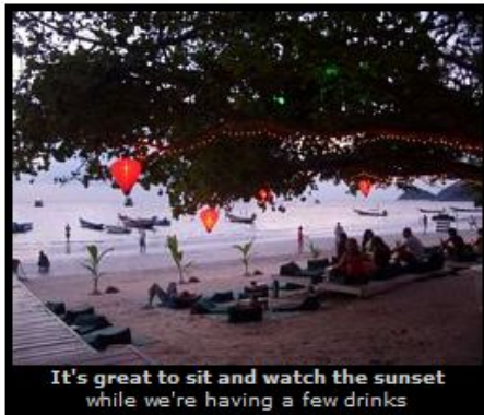
It's great to sit and watch the sunset while we're having a few drinks

The next day we chilled all day and in the evening made our way down to the harbour to take the boat back to main land, the time to leave had finally arrived.