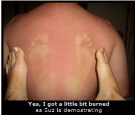
Yes, I got a little bit burned as Suz is demonstrating