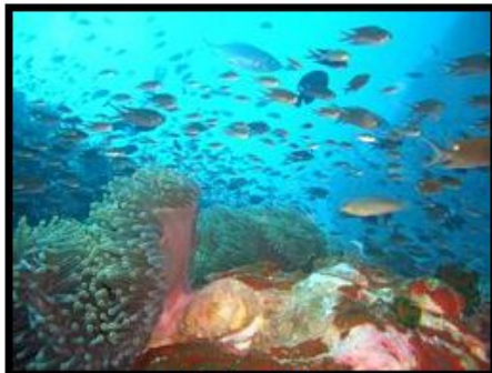
Plenty of life At dive site Chumpon Pinnacle