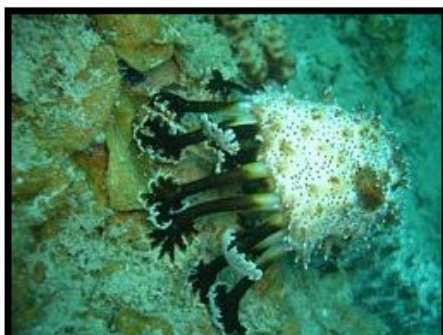
A huge Sea Cucumber