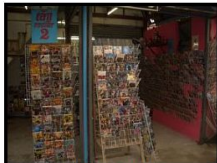
Need some DVDs? You can find a few here...