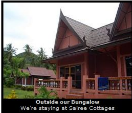
Outside our Bungalow We're staying at Sairee Cottages

The next morning I was diving again and so the cycle continued =))