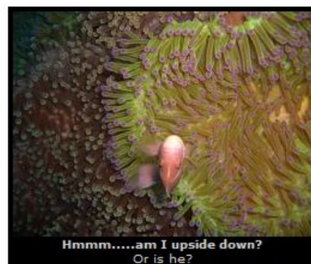
Hmmm.....am I upside down? Or is he?