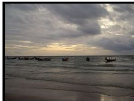
It's cloudy but still a nice sunset ...this is the rainy season