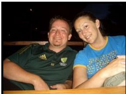
Suz and I relaxing next to the sea