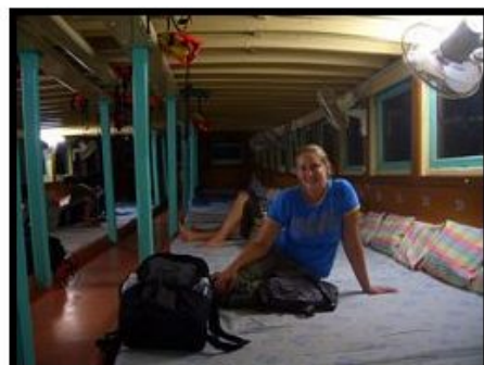
It's time to go back to main land On another night boat!