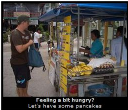
Feeling a bit hungry? Let's have some pancakes