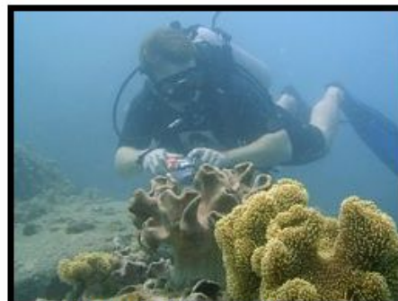
"Under the sea, under the sea" Love my diving!