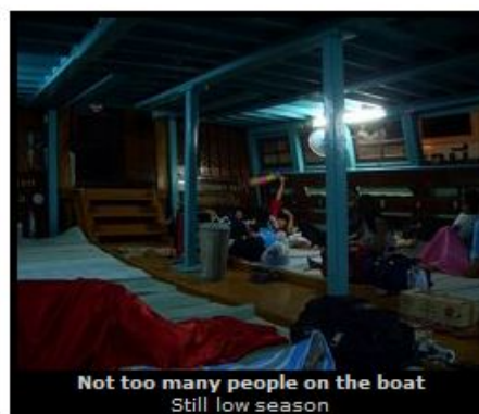
Not too many people on the boat Still low season

The boat left Surat Thani at 11pm and arrived in Koh Tao the following morning at around 7am and we had managed to get some sleep here and there, at least the ride was nice and smooth which was a bit surprising considering that we were travelling during the moonson period.