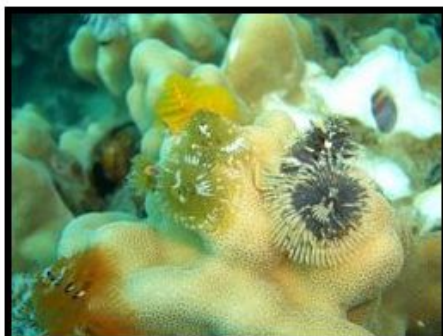
Christmas Tree Worms Pretty and fun to play with