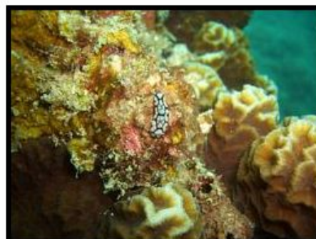
A small nudibranch Tricky to find them...