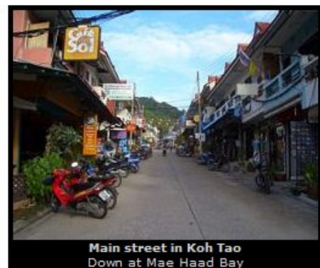
Main street in Koh Tao Down at Mae Haad Bay

The rest of that day and the next day as well were fairly similar, we went down to the beach if the sun was out, if it was raining we just sat either in our bungalow or in the restaurant (which was located right by the sea). Our main purpose here was to relax and do as little as possible.... and we did a pretty good job at that!