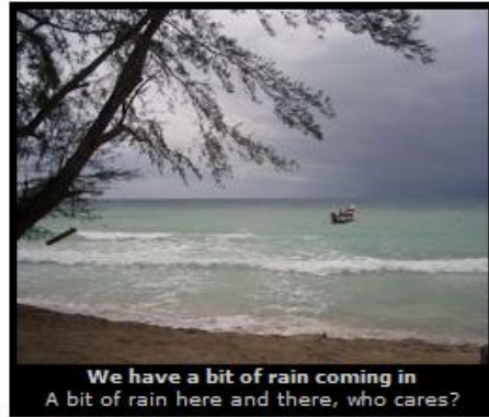
We have a bit of rain coming in A bit of rain here and there, who cares?