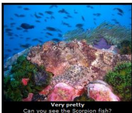
Very pretty Can you see the Scorpion fish?