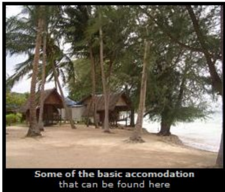
Some of the basic accomodation that can be found here