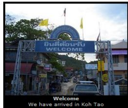
Welcome We have arrived in Koh Tao

Since it wasn't possible to dive the Similan Islands at this time of year, I had decided to do a few dives here anyway, if nothing else it's just nice to get back into the water!