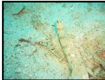
A good partnership... Between the Gobi and the Prawn