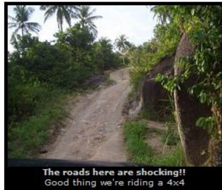
The roads here are shocking!! Good thing we're riding a 4x4