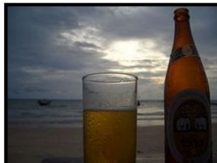
Beer and Sunset Do you need anything else?