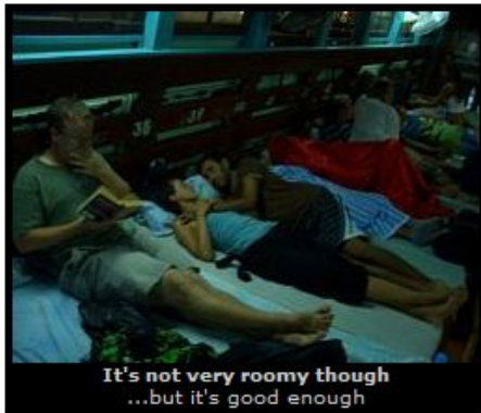
It's not very roomy though ...but it's good enough

I had been to this island on a few occasions in the past so I knew where I wanted to stay. We jumped on the back of a 4x4 (a Koh Tao Taxi) and told them to drop us off on Sairee Beach, the longest and busiest beach on the island.