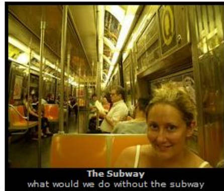
The Subway what would we do without the subway