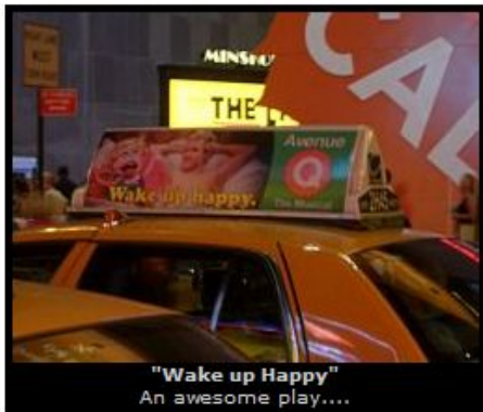
"Wake up Happy" An awesome play....