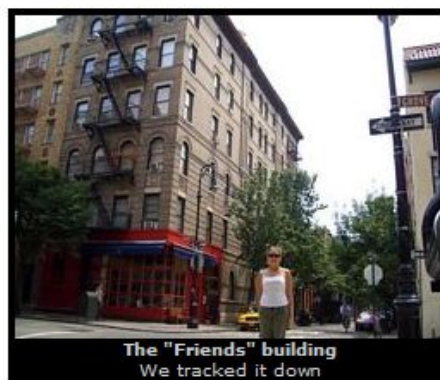
The "Friends" building We tracked it down

From here we found our way to the subway and went all the way to 86th street and then walked over to the Guggenheim museum just to have a look at it from the outside....and wouldn't you know it, the outside of the museum was under restoration just at the time so we couldn't see it from the outside.....so we entered it just to have a quick look inside and all the spirals....we didn't pay to see any exhibitions though.