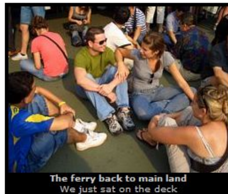
The ferry back to main land We just sat on the deck