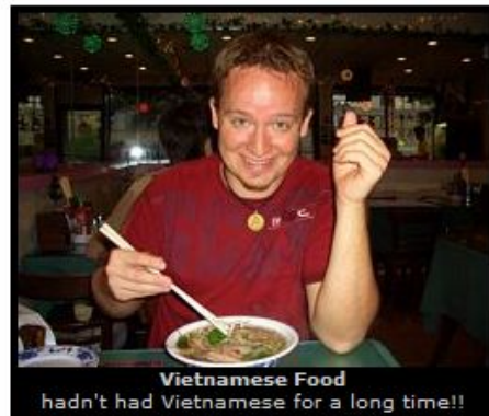
Vietnamese Food hadn't had Vietnamese for a long time!!