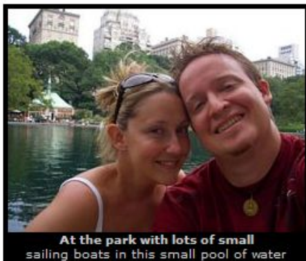
At the park with lots of small sailing boats in this small pool of water