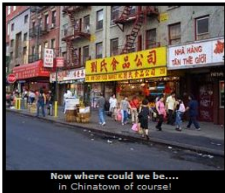
Now where could we be.... in Chinatown of course!