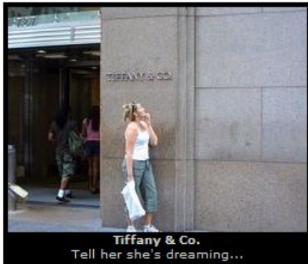
Tiffany & Co. Tell her she's dreaming...