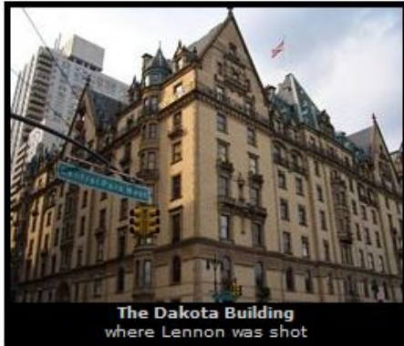
The Dakota Building where Lennon was shot