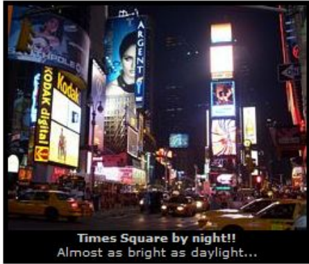
Times Square by night!! Almost as bright as daylight...