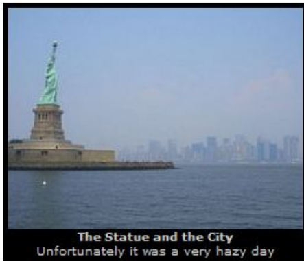
The Statue and the City Unfortunately it was a very hazy day