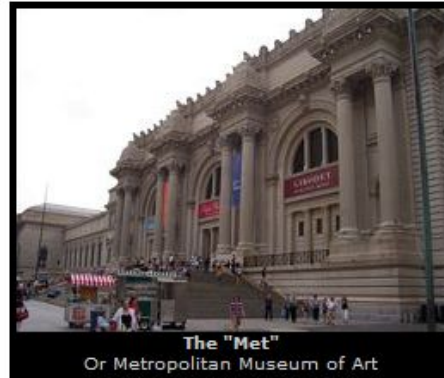
The "Met" Or Metropolitan Museum of Art