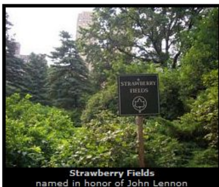
Strawberry Fields named in honor of John Lennon