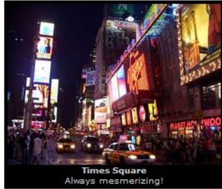
Times Square Always mesmerizing!