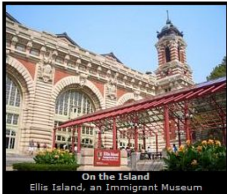
On the Island Ellis Island, an Immigrant Museum