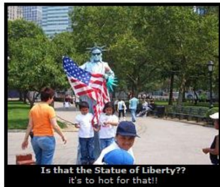
Is that the Statue of Liberty?? it's to hot for that!!