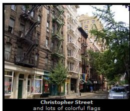
Christopher Street and lots of colorful flags

We moved on towards the Metropolitan Museum of Art, also called "The Met". Here we saw that they had a "recommended" fee for entry. The recommended fee was $15, so we were wondering what would happen if we just offered them $1 each and asked for two tickets. Since we weren't in a museum "looking-at-mouldy-old-things" mood we just left the place and entered Central Park.