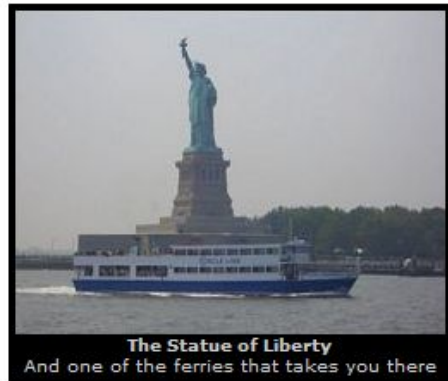
The Statue of Liberty And one of the ferries that takes you there