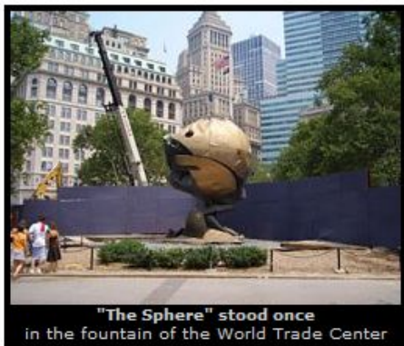
"The Sphere" stood once in the fountain of the World Trade Center