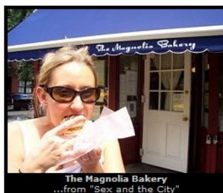
The Magnolia Bakery ...from "Sex and the City"