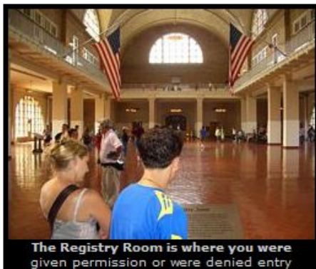
The Registry Room is where you were given permission or were denied entry