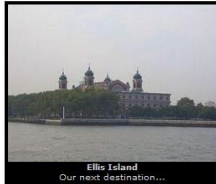
Ellis Island Our next destination...