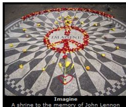
Imagine A shrine to the memory of John Lennon