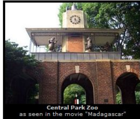
Central Park Zoo as seen in the movie "Madagascar"