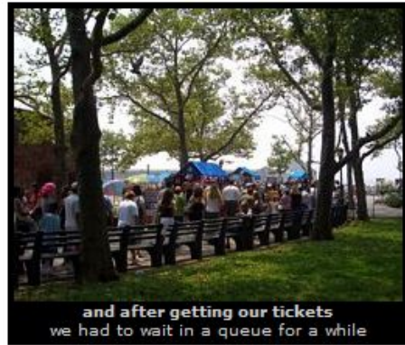
and after getting our tickets we had to wait in a queue for a while