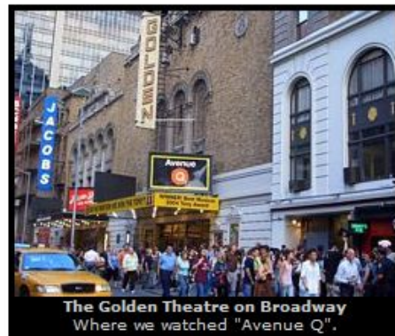
The Golden Theatre on Broadway Where we watched "Avenue Q".