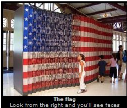
The flag Look from the right and you'll see faces