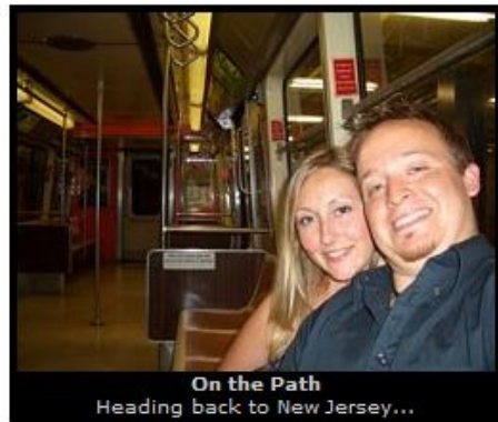
On the Path Heading back to New Jersey...