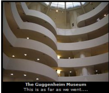
The Guggenheim Museum This is as far as we went....