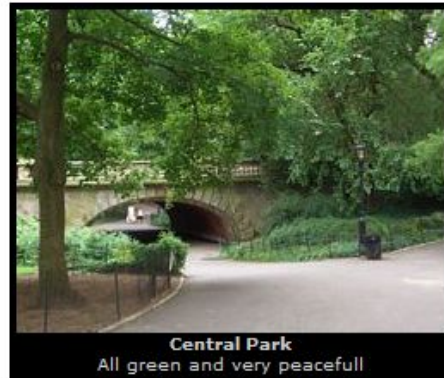
Central Park All green and very peaceful