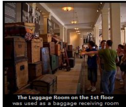
The Luggage Room on the 1st floor was used as a baggage receiving room