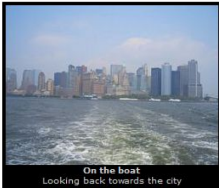
On the boat Looking back towards the city