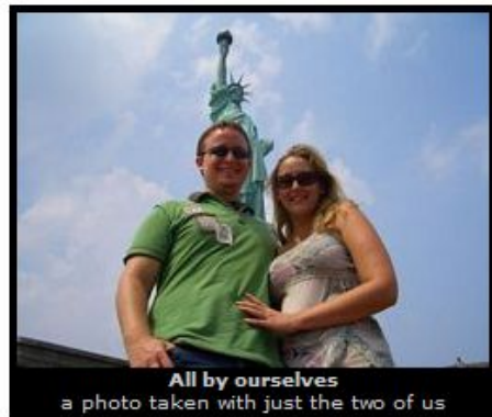
All by ourselves a photo taken with just the two of us