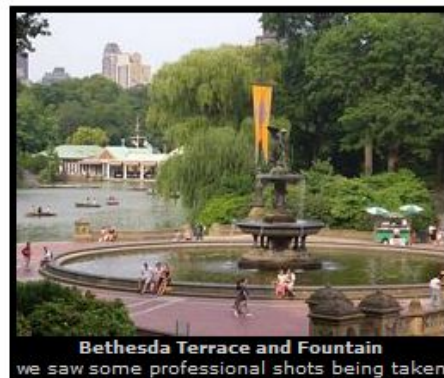
Bethesda Terrace and Fountain we saw some professional shots being taken