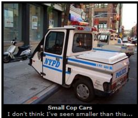
Small Cop Cars I don't think I've seen smaller than this...