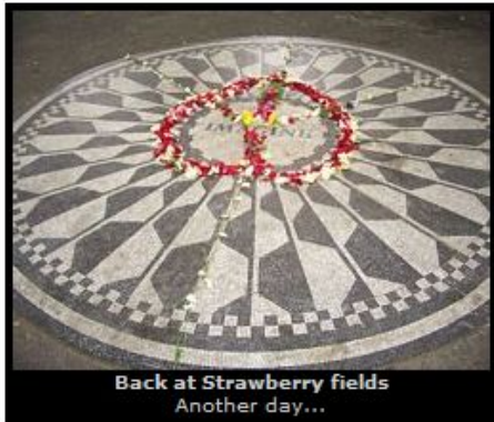
Back at Strawberry fields Another day...