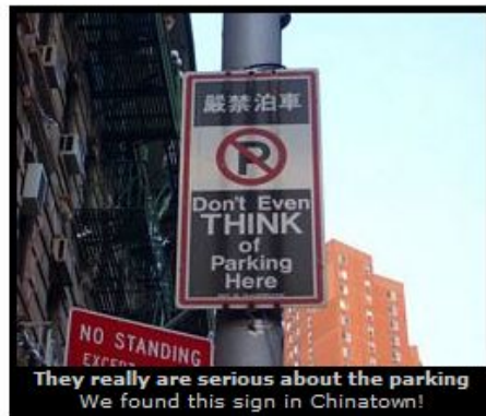
They really are serious about the parking We found this sign in Chinatown!