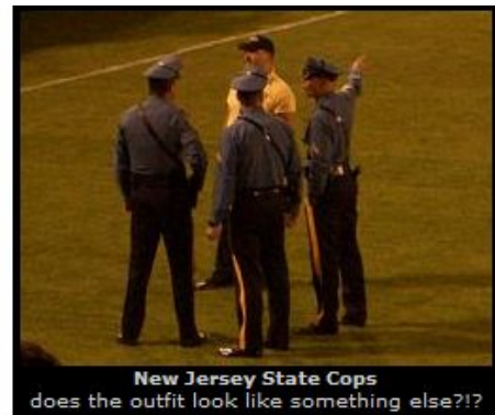
New Jersey State Cops does the outfit look like something else!?

The time was around 2am and we were now driving home, we were litterally around 10 blocks before we entered our town when all of a sudden an SUV behind us starts flashing its cop lights. We pulled over and the second the car stopped there were narcs, dressed in undercover clothes and with their badges hanging from their necks, all around the car with the guns drawn against us and yelling for us to keep our hands up. They then opened my door, took a half eaten burger from my hand (which they just tossed away) leaned in, undid the safety belt and had me get out against the car to be padded down. Once that was done I was told to stand at the back of the car so they could get Magnus out as well and padd him down.