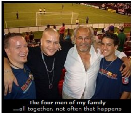
The four men of my family ...all together, not often that happens