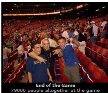
End of the Game 79000 people altogether at the game

Once this was done a HUGE guy approached and asked; "Have you searched them", to which one of the other cops replied; "Not as good as you do it". Now as you can probably see all of us were imagining the gloves coming out and then some poking in not so nice areas.....but the only thing that happened was that everything we had in our pockets was taken out and inspected.