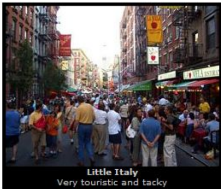
Little Italy Very touristic and tacky