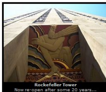
Rockefeller Tower Now re-open after some 20 years...