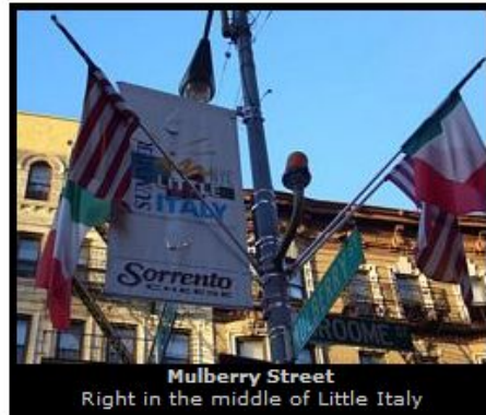
Mulberry Street Right in the middle of Little Italy