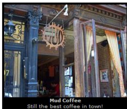
Mud Coffee Still the best coffee in town!