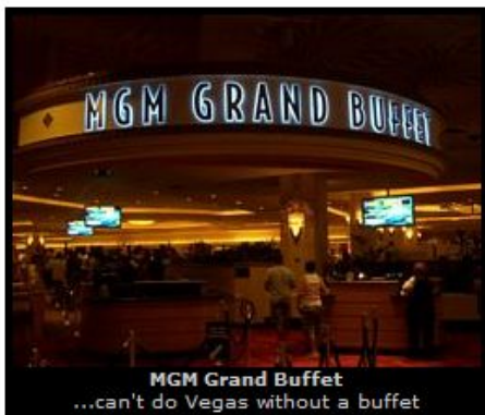
MGM Grand Buffet ...can't do Vegas without a buffet