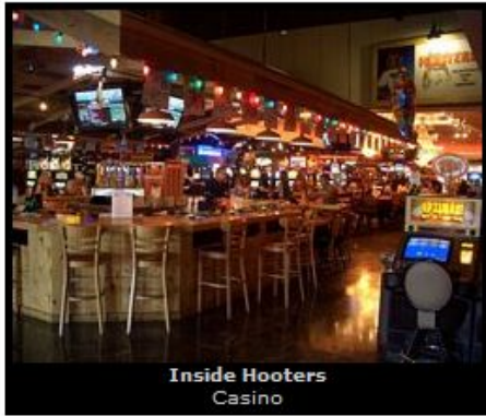
Inside Hooters Casino