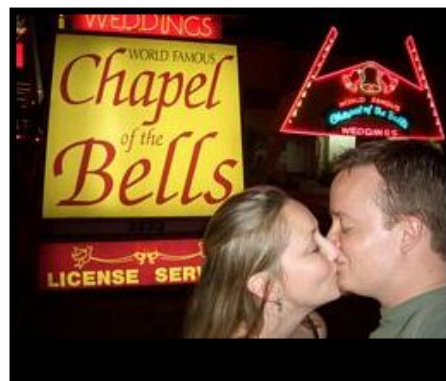
WEDDINGS WORLD FAMOUS Chapel of the Bells LICENSE SERVICE