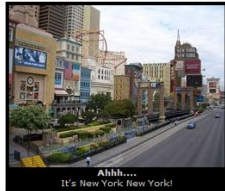
Ahhh.... It's New York New York!

We left and continued to explore the casinos along the strip such as the elaborate Excalibur, walking into MGM and see its lions, past the Monte Carlo and the Bellagio with its fountains (unfortunately it was too early for a fountain show) and eventually we ended up at Caesars Palace.