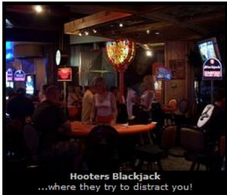
Hooters Blackjack ...where they try to distract you!