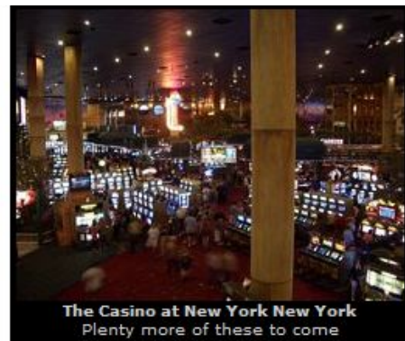
The Casino at New York New York Plenty more of these to come

After a few hours sleep we made a short tour of the southern part of the strip, just to get a first quick look at Las Vegas by Night, and it's pretty amazing.... very tacky but still amazing! They really have gone all the way when it comes to the lights, one of the most impressive ones is by far the Luxor with the beams that shoot out from the top of the pyramid. These lights can be seen from anywhere on the strip.