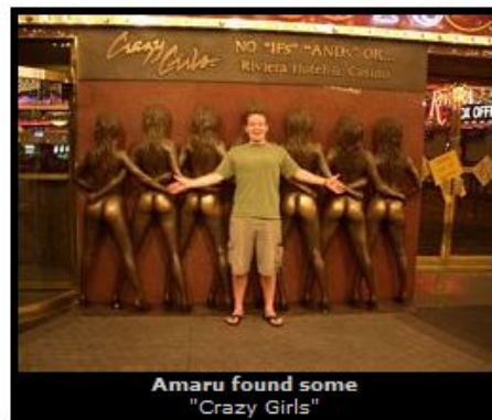
Amaru found some "Crazy Girls"