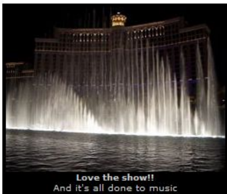
Love the show!! And it's all done to music