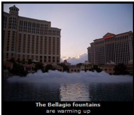
The Bellagio fountains are warming up