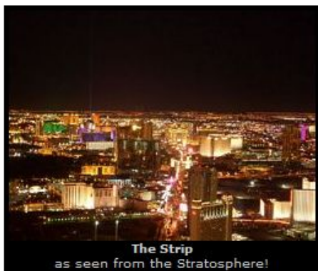
The Strip as seen from the Stratosphere!