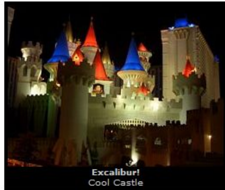
Excalibur! Cool Castle