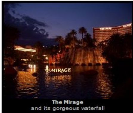
The Mirage and its gorgeous waterfall