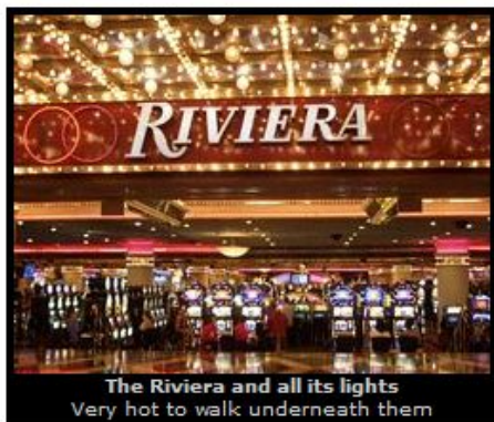
The Riviera and all its lights Very hot to walk underneath them