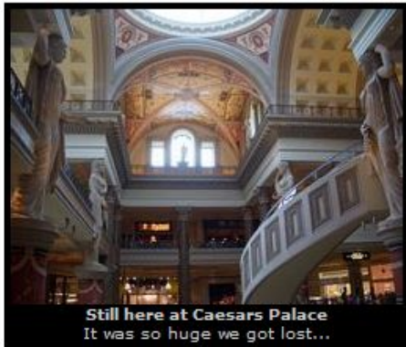
Still here at Caesars Palace It was so huge we got lost...