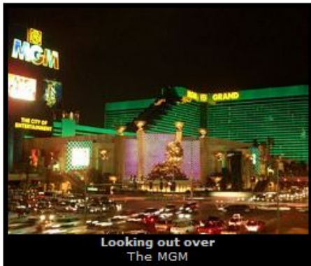
Looking out over The MGM