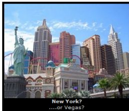
New York? ...or Vegas?

We had reservations at the Hooters Casino Hotel and reached there around 9am, unfortunately, the earliest we could check-in according to the receptionist was at 4pm. We had expected this but were kind of hoping for an early check-in. None of us had slept on the plane so we were quite tired by now....but, with nothing else to do but store our bags and leave to explore the city, we left.