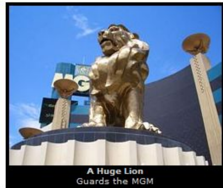
A Huge Lion Guards the MGM

Since we had already cleared immigration in Hawaii and this was a domestic flight we didn't have to worry about any lines or pain in the a** officers, so we just strolled to the luggage area, waited for around 20min before the luggage arrived and then headed off to catch a Shuttle Bus.