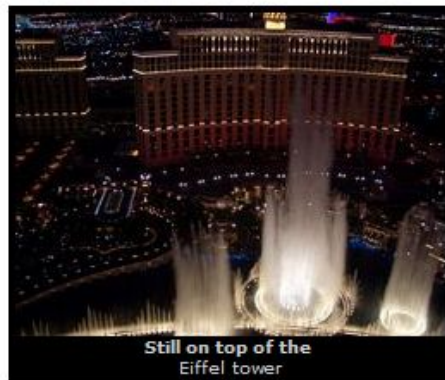
Still on top of the Eiffel tower