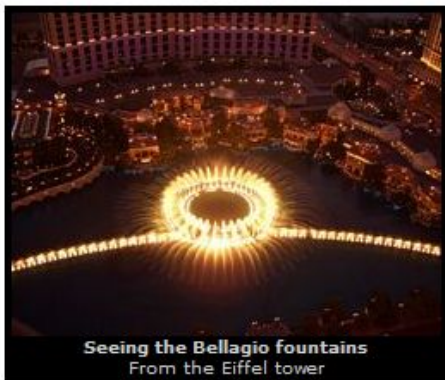
Seeing the Bellagio fountains From the Eiffel tower