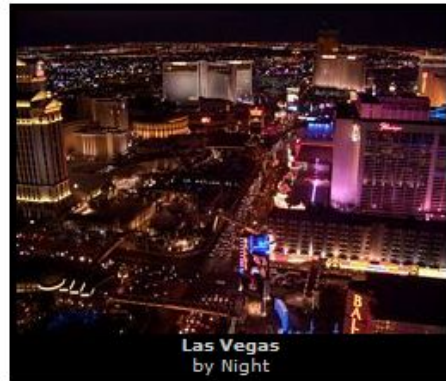
Las Vegas by Night