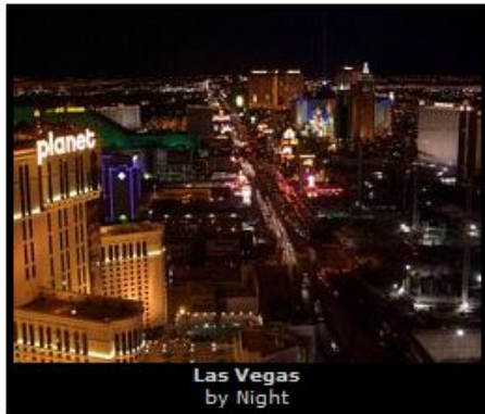
Las Vegas by Night