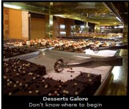
Desserts Galore Don't know where to begin