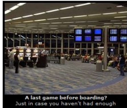
A last game before boarding? Just in case you haven't had enough