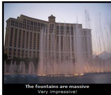
The fountains are massive Very impressive!