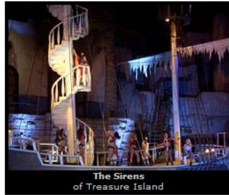
The Sirens of Treasure Island