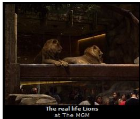
The real life Lions at The MGM