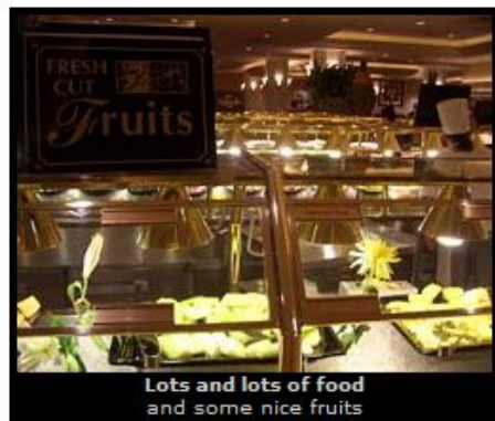
Lots and lots of food and some nice fruits