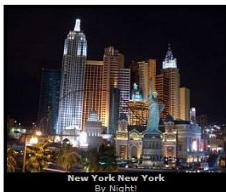
New York New York By Night!

We also wanted to try out one of the Buffets so we went to the MGM for a lunch buffet. There is lots and lots to eat and the people there are eating lots! We had our share of the food, some of it good, some just ok and were able to finish off with some fruits and dessert. After the buffet both of us were so full that we couldn't understand how some people have these buffets several time a day. We figured that once during a three day period was enough.