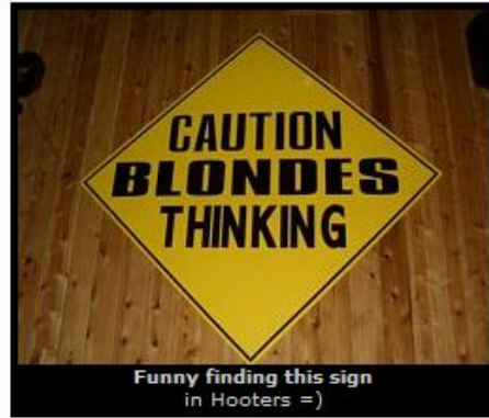
Funny finding this sign in Hooters =)