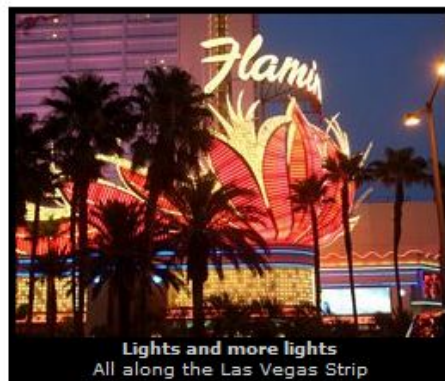
Lights and more lights All along the Las Vegas Strip