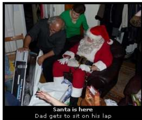
Santa is here Dad gets to sit on his lap