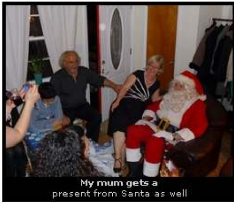
My mum gets a present from Santa as well