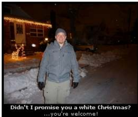
Didn't I promise you a white Christmas? ...you're welcome!