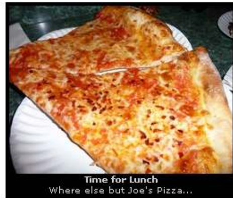
Time for Lunch Where else but Joe's Pizza...