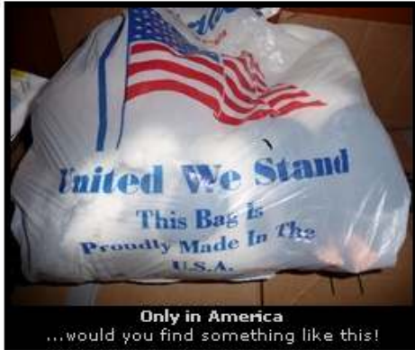
Only in America ...would you find something like this!