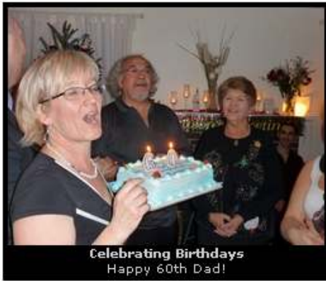
Celebrating Birthdays Happy 60th Dad!