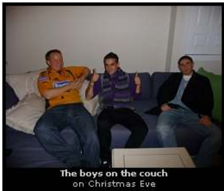
The boys on the couch on Christmas Eve