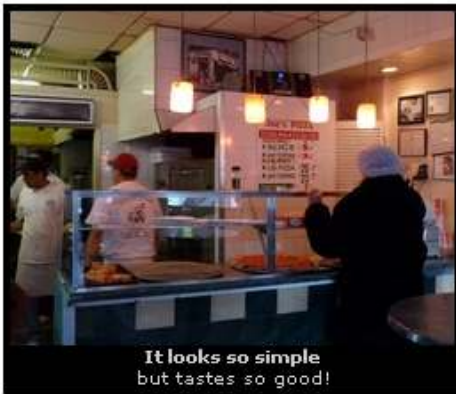
It looks so simple but tastes so good!