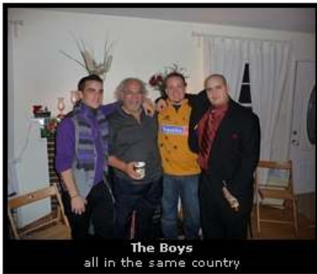
The Boys all in the same country