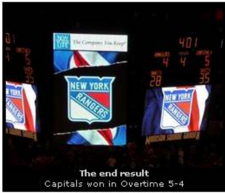
The end result Capitals won in Overtime 5-4