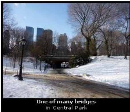
One of many bridges in Central Park