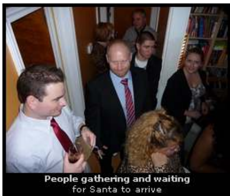
People gathering and waiting for Santa to arrive