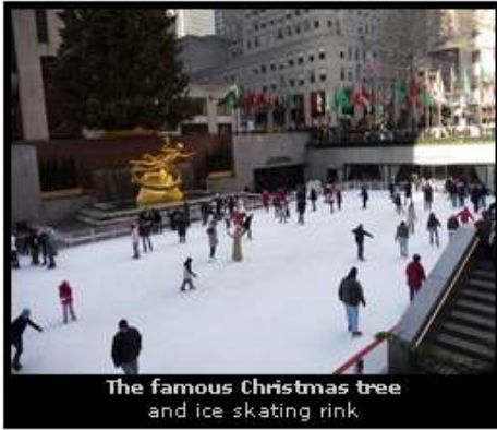
The famous Christmas tree and ice skating rink