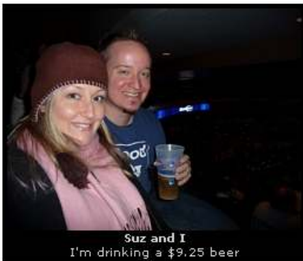
Suz and I I'm drinking a $9.25 beer