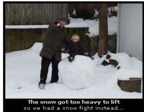
The snow got too heavy to lift so we had a snow fight instead...

Later on that evening we sang birthday songs for my sister and dad, my sisters birthday is on the 24th and my dad had his 60th on the 25th of December. Christmas has always been about big birthdays at our house.