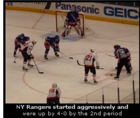
NY Rangers started aggressively and were up by 4-0 by the 2nd period