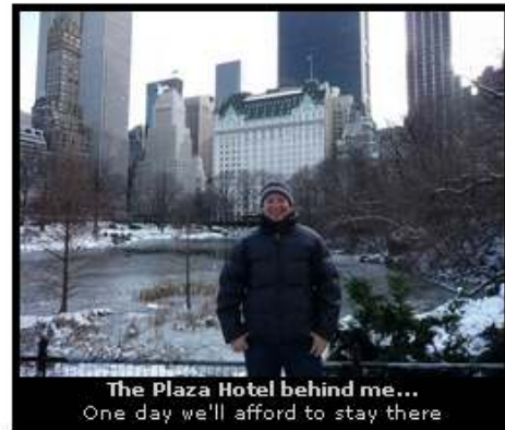
The Plaza Hotel behind me... One day we'll afford to stay there