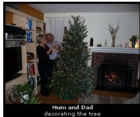
Mum and Dad decorating the tree

Central Park in winter is amazing, it's such a winter wonderland! And it was actually warmer here than in the rest of the city since the wind couldn't make it through as easily.