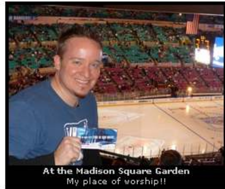
At the Madison Square Garden My place of worship!!