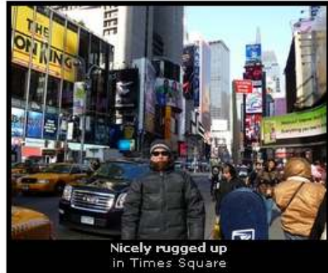
Nicely rugged up in Times Square