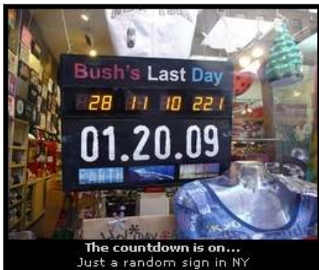
The countdown is on... Just a random sign in NY