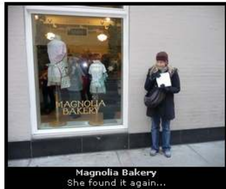
Magnolia Bakery She found it again...