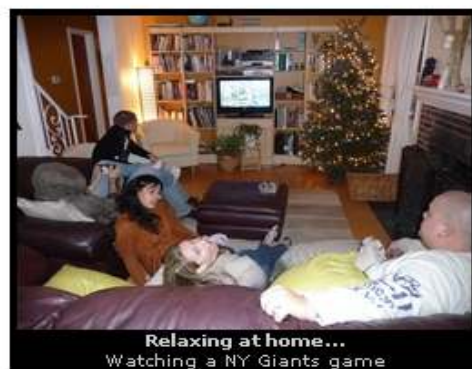
Relaxing at home... Watching a NY Giants game