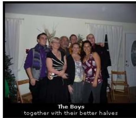
The Boys together with their better halves