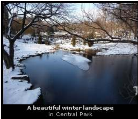
A beautiful winter landscape in Central Park