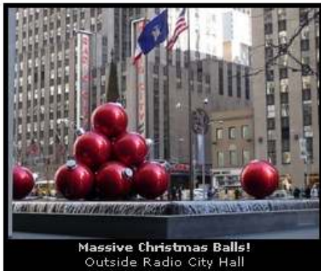
Massive Christmas Balls! Outside Radio City Hall