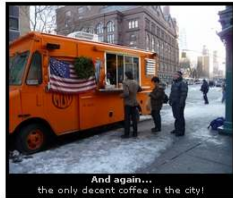
And again... the only decent coffee in the city!