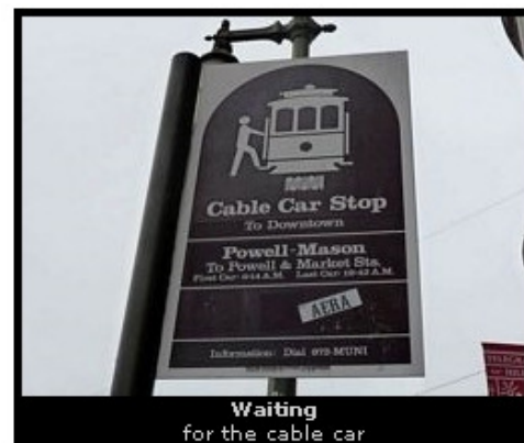
Waiting for the cable car