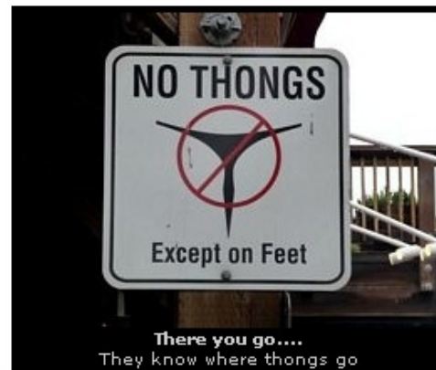
There you go.... They know where thongs go