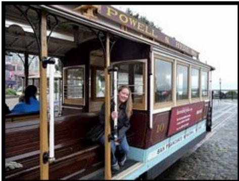
We got ourself a day-pass and rode the cable cars all day...