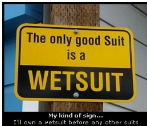
My kind of sign... I'll own a wetsuit before any other suits

We've had a great 5 weeks holiday that included a white Christmas, some great Caribbean feeling and great diving in Belize, awesome beaches in Isla Mujeres and Tulum and some great Tequila and street food in Guadalajara... Sure, Puerto Vallarta might not have been a highlight, but we still had a good time.... I mean, not even getting Bells Palsy ruined our holiday for us =)