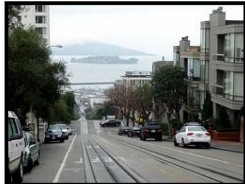
Climbing Hyde Street With Alcatraz in the background