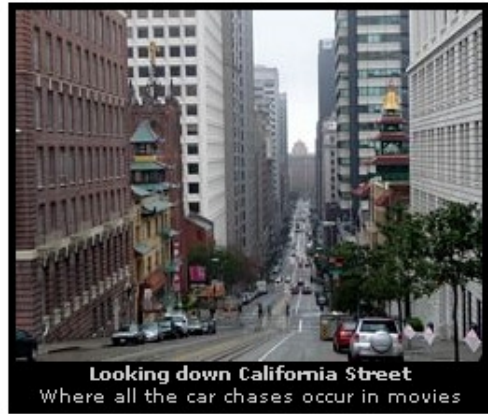
Looking down California Street Where all the car chases occur in movies