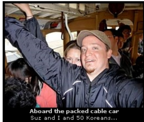
Aboard the packed cable car Suz and I and 50 Koreans...