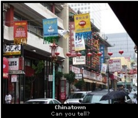
Chinatown Can you tell?