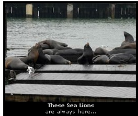
These Sea Lions are always here...

Since it's winter time and it was cold and raining we decided to just stroll around the city during the day, maybe check some stores to see if they had any good sales and just enjoy the vibe of the city. And since the city centre is quite compact you can cover a lot of ground in one day, specially since we got ourselves a day-pass on the cable car and could ride them up and down the streets as much as we wanted =)