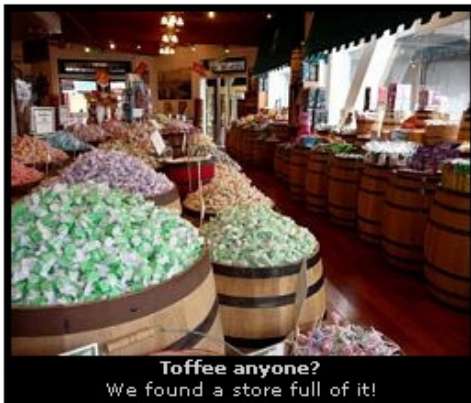
Toffee anyone? We found a store full of it!

So that's what we did, we revisited some sights such as Pier 39 to see the Sea Lions, we walked around the Fishermans Wharf area, we walked down Lombard Street (the crookedest street in the world), visited Chinatown for some dumplings and walked around downtown along some of the city's shops.