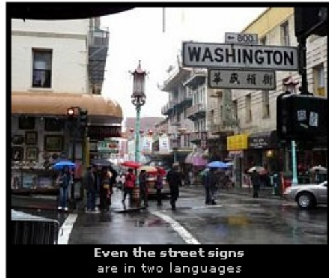
Even the street signs are in two languages