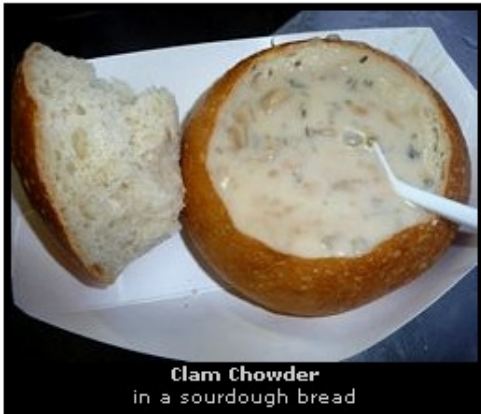
Clam Chowder in a sourdough bread