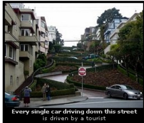
Every single car driving down this street is driven by a tourist