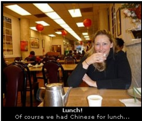
Lunch! Of course we had Chinese for lunch...