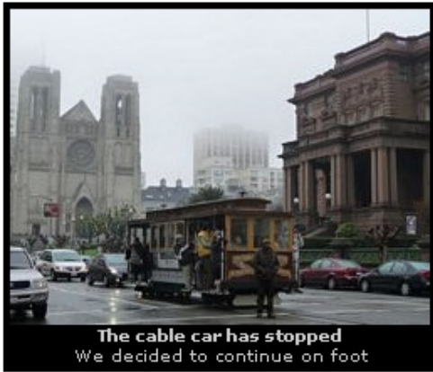
The cable car has stopped We decided to continue on foot