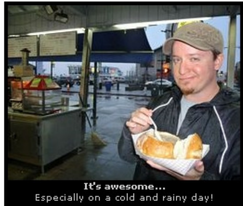
It's awesome... Especially on a cold and rainy day!